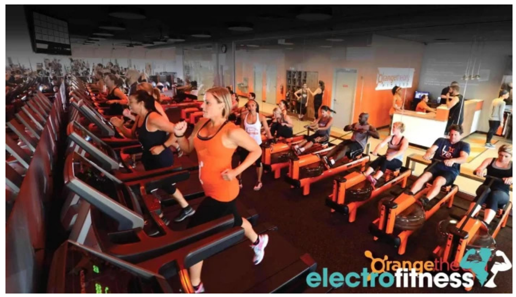
Orangetheory fitness all