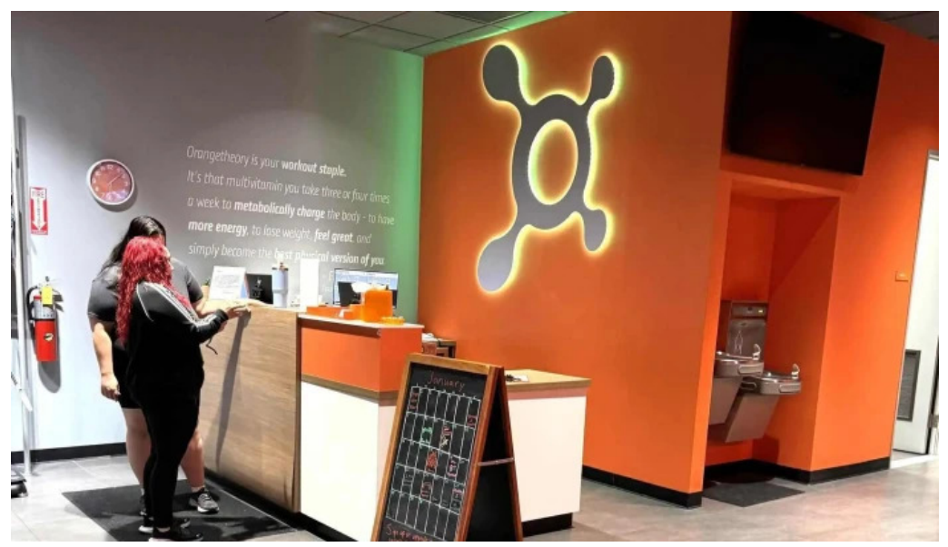
Orangetheory fitness gym