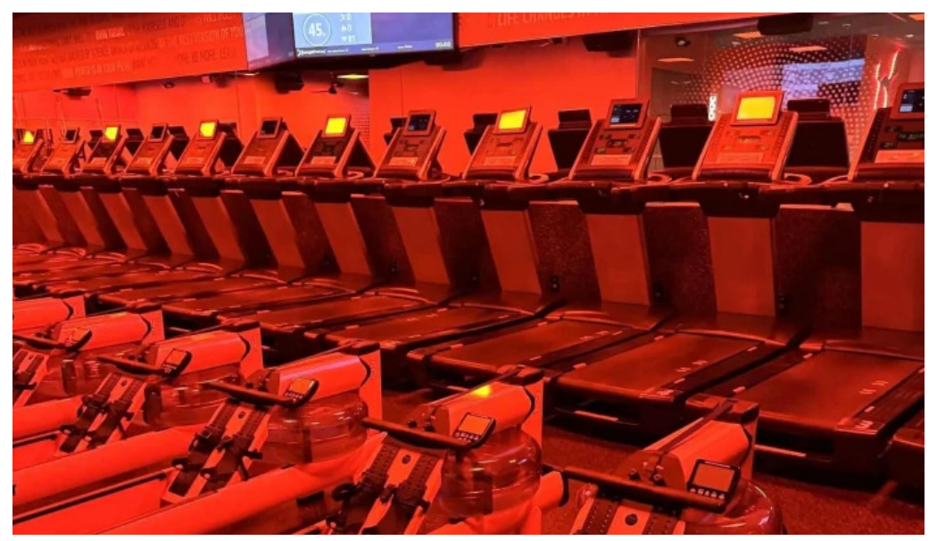
Orangetheory fitness agoura hills