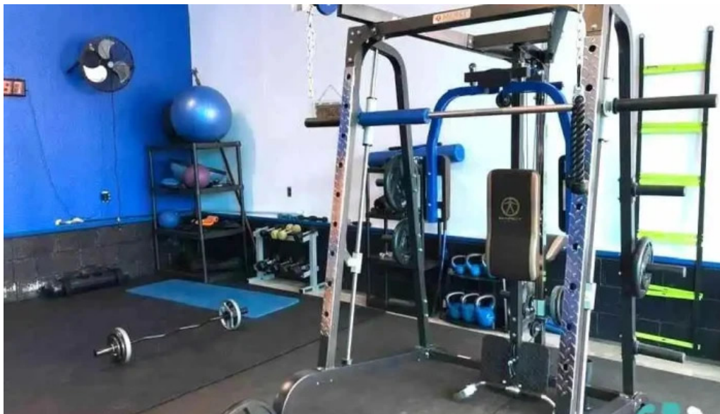
Md fitness gym