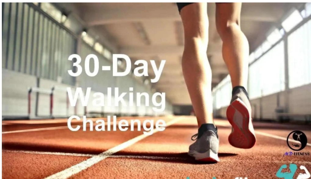
Md fitness ahwahnee