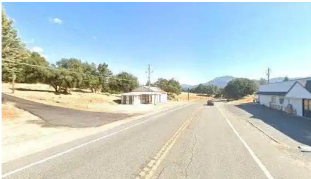
Md fitness street view 360deg