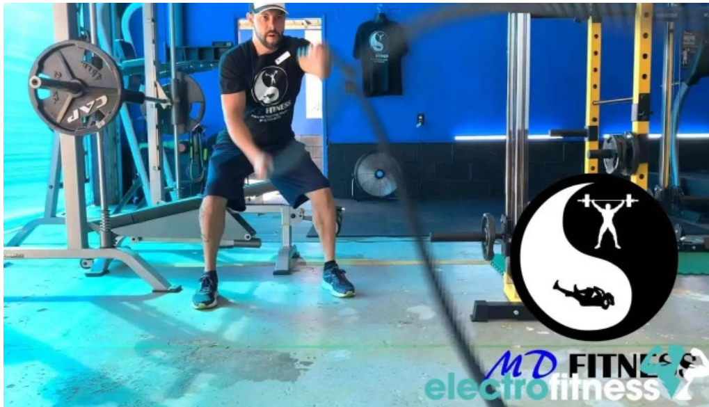
Md fitness videos