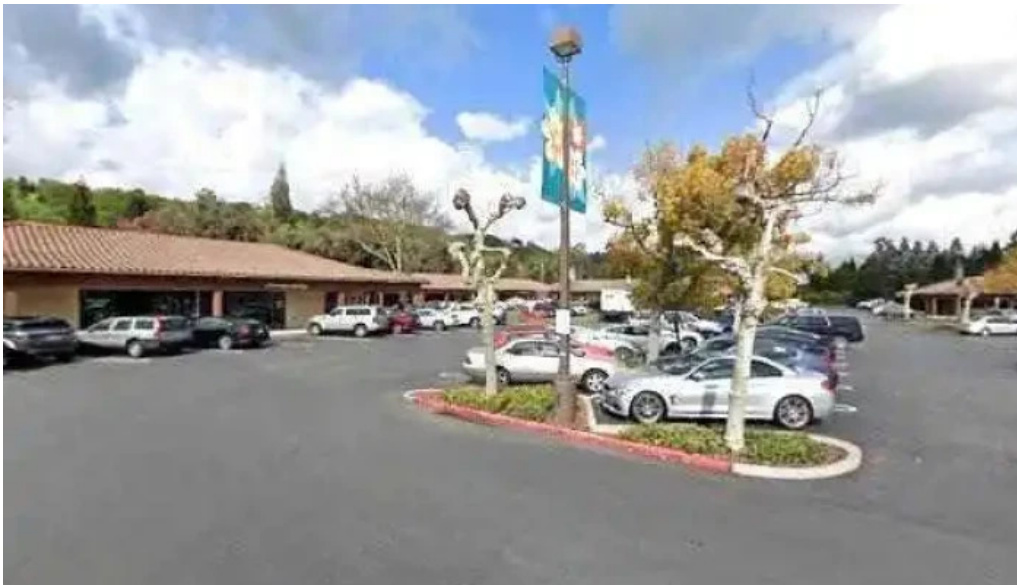
The iron house street view 360deg