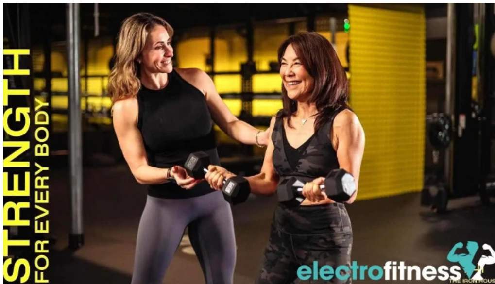
The iron house alamo