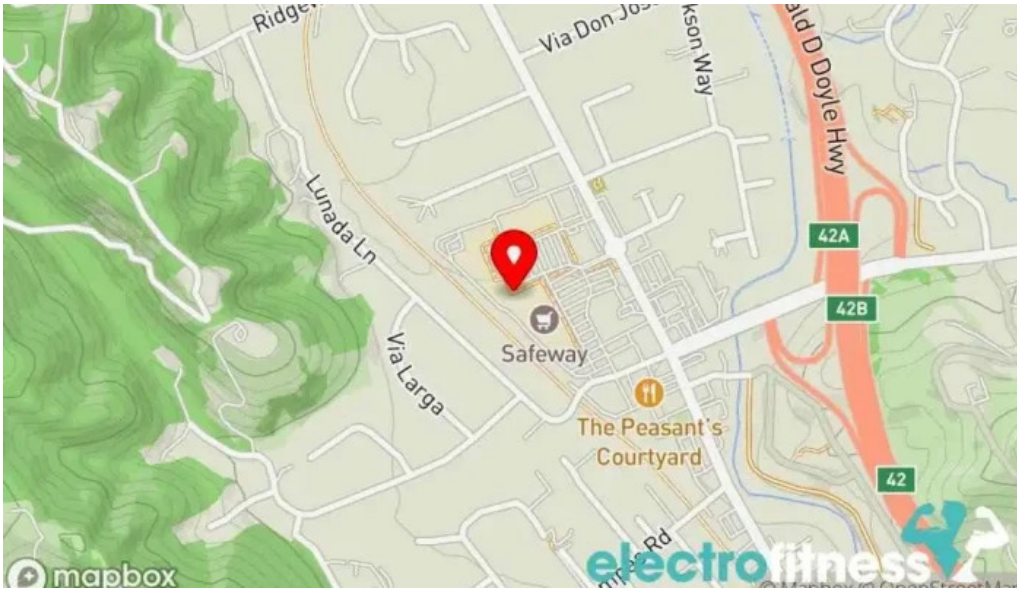
The iron house map