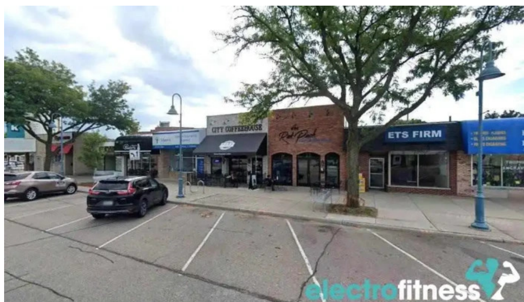
Jazzercise allen park