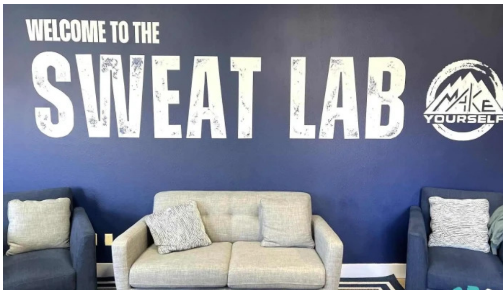
The sweat lab make yourself latest