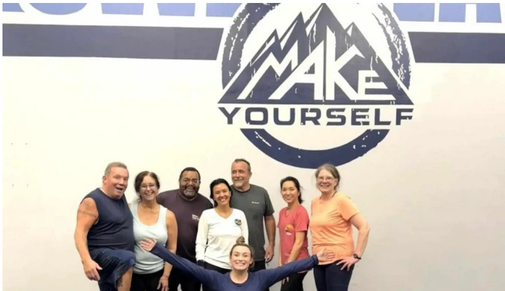
The sweat lab make yourself gym