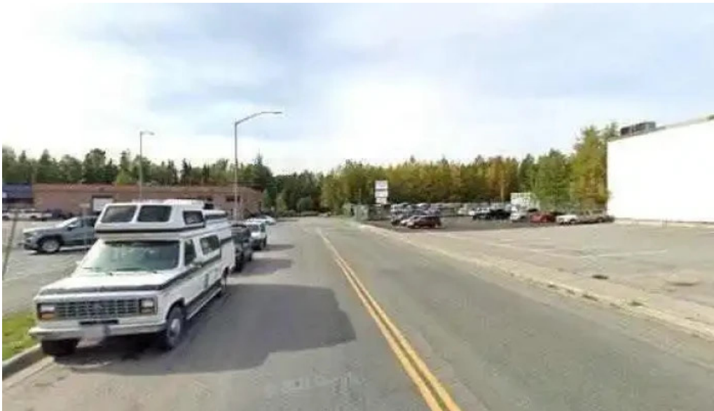
The sweat lab make yourself street view 360deg