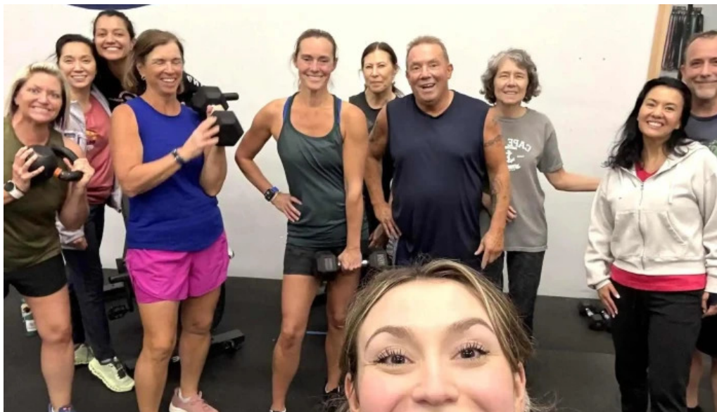
The sweat lab make yourself address