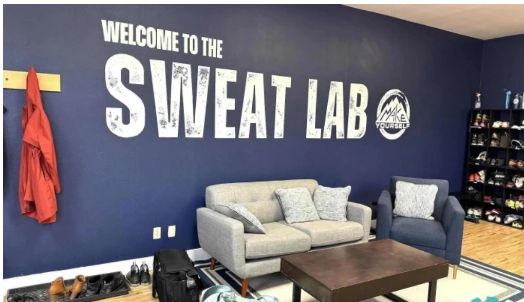
The sweat lab make yourself by owner