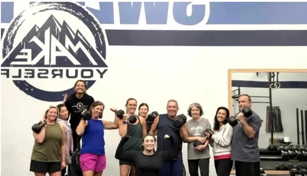
The sweat lab make yourself phone