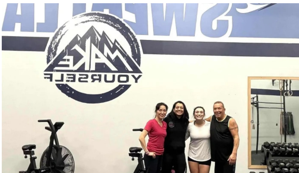
The sweat lab make yourself anchorage