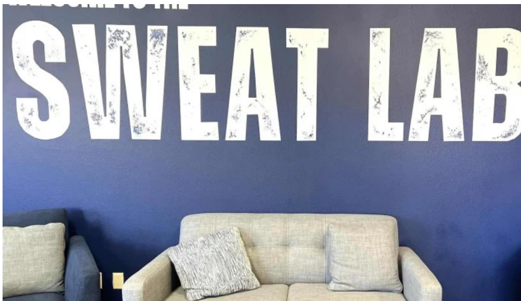
The sweat lab make yourself catalog