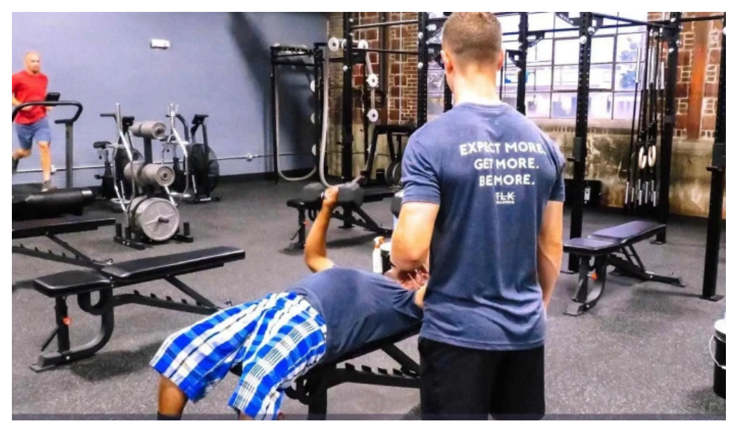
Tlk training by owner