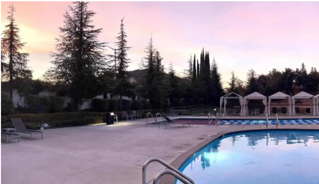
In shape fitness discounts