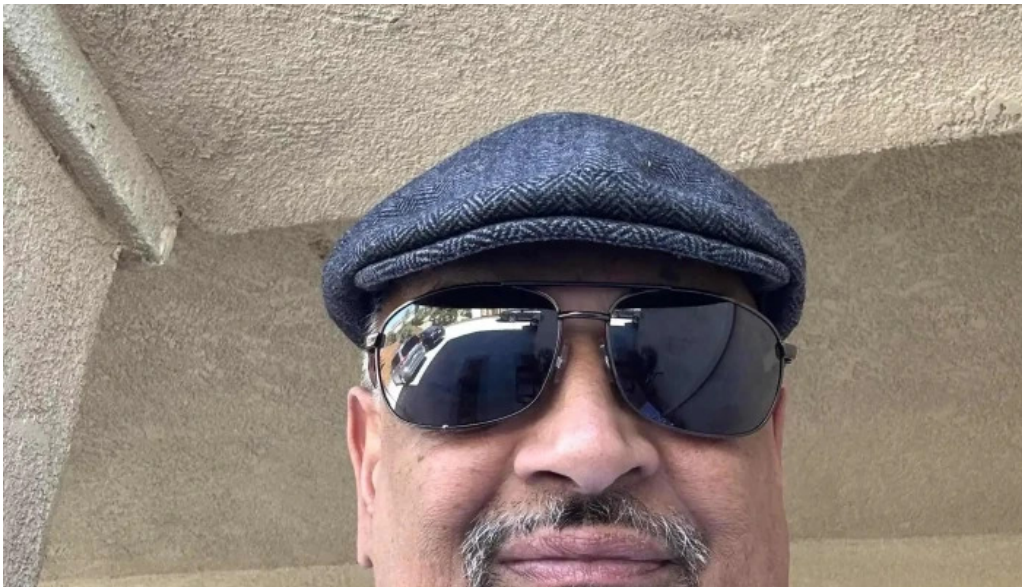
In shape fitness website