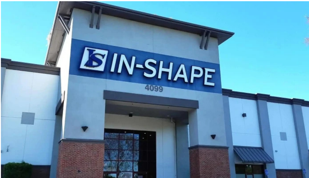
In shape fitness gym