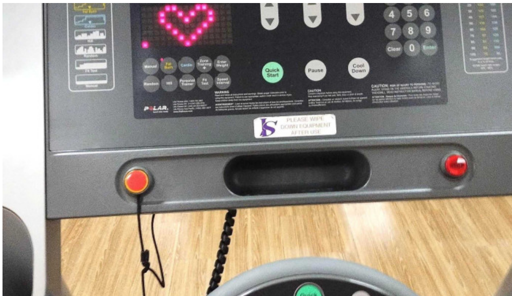
In shape fitness address