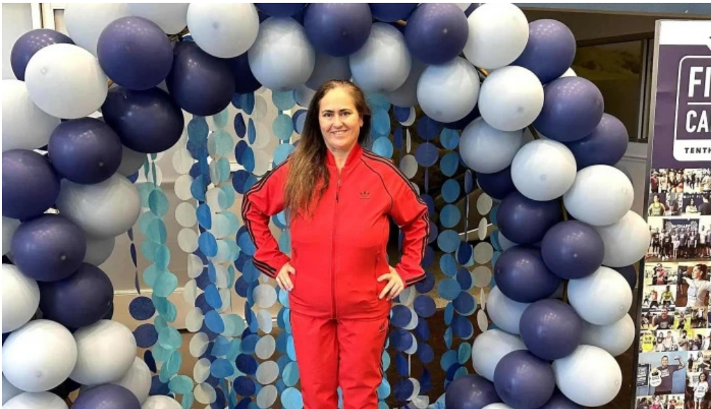
In shape fitness number