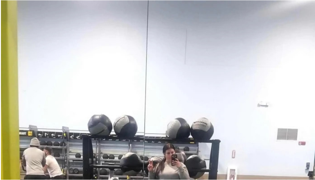
In shape fitness where