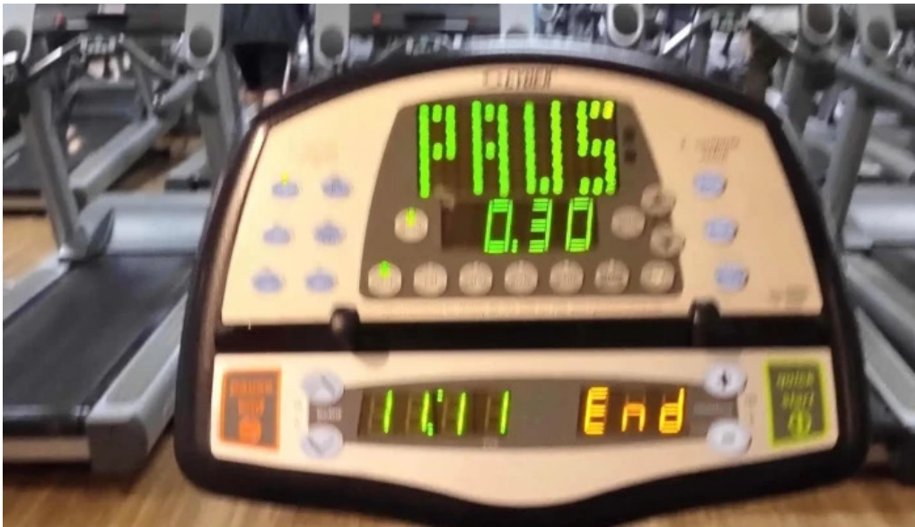
In shape fitness score