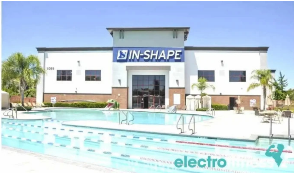
In shape fitness all