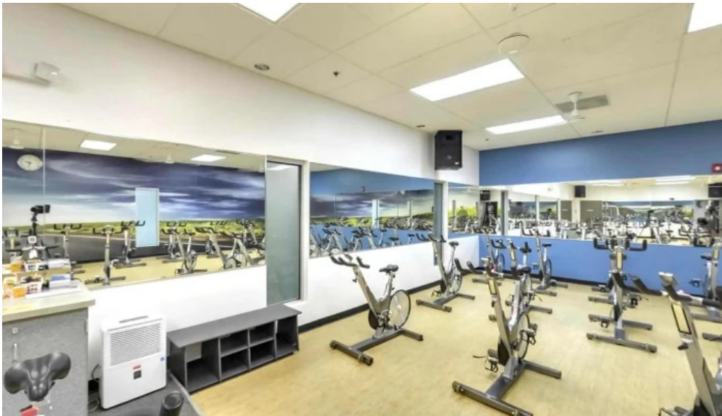
In shape fitness street view 360deg