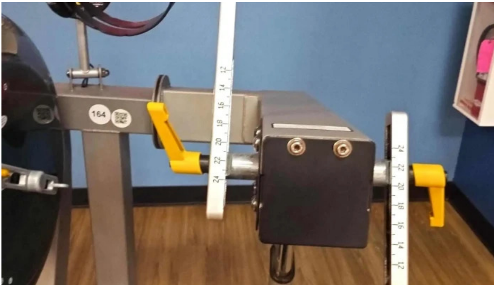
In shape fitness antioch