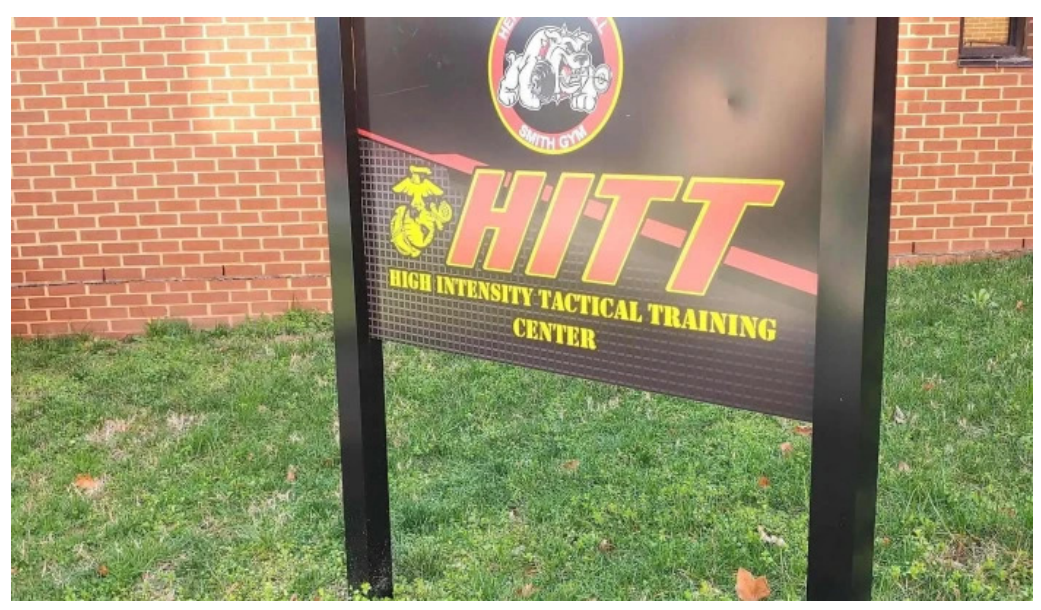
Henderson hall smith gym arlington