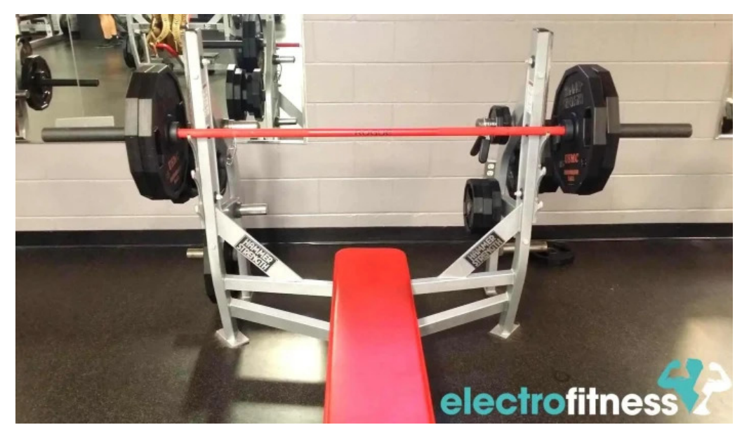
Henderson hall smith gym exercise machine