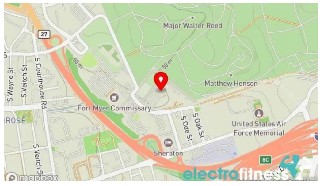
Henderson hall smith gym map