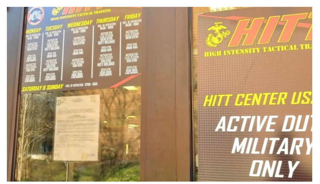
Henderson hall smith gym number