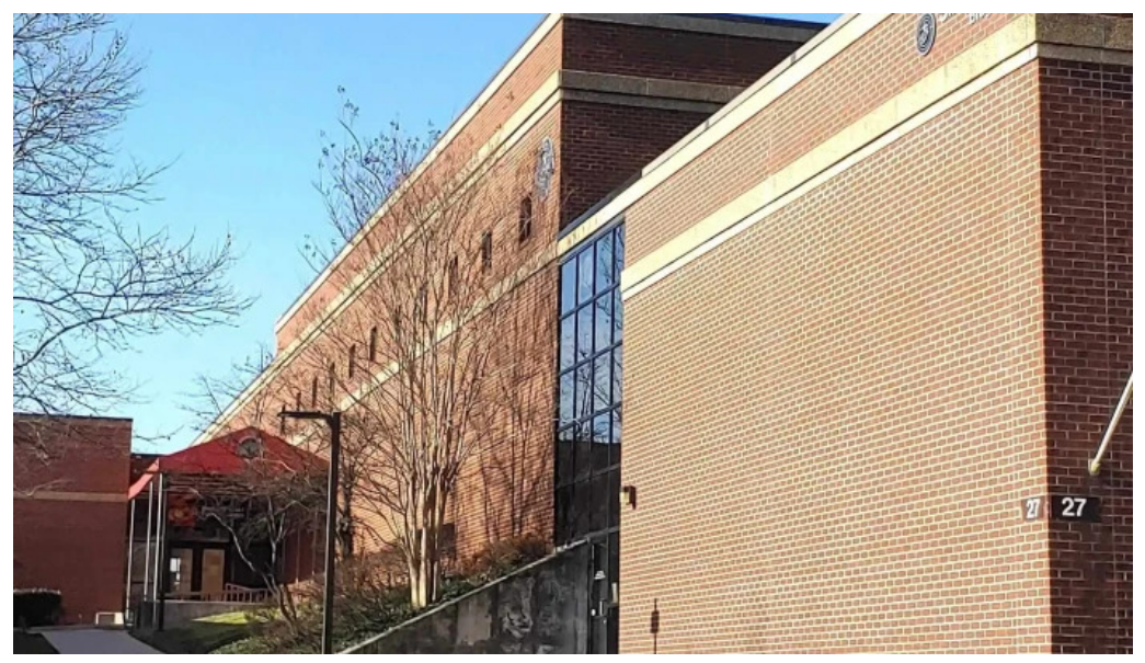
Henderson hall smith gym gym