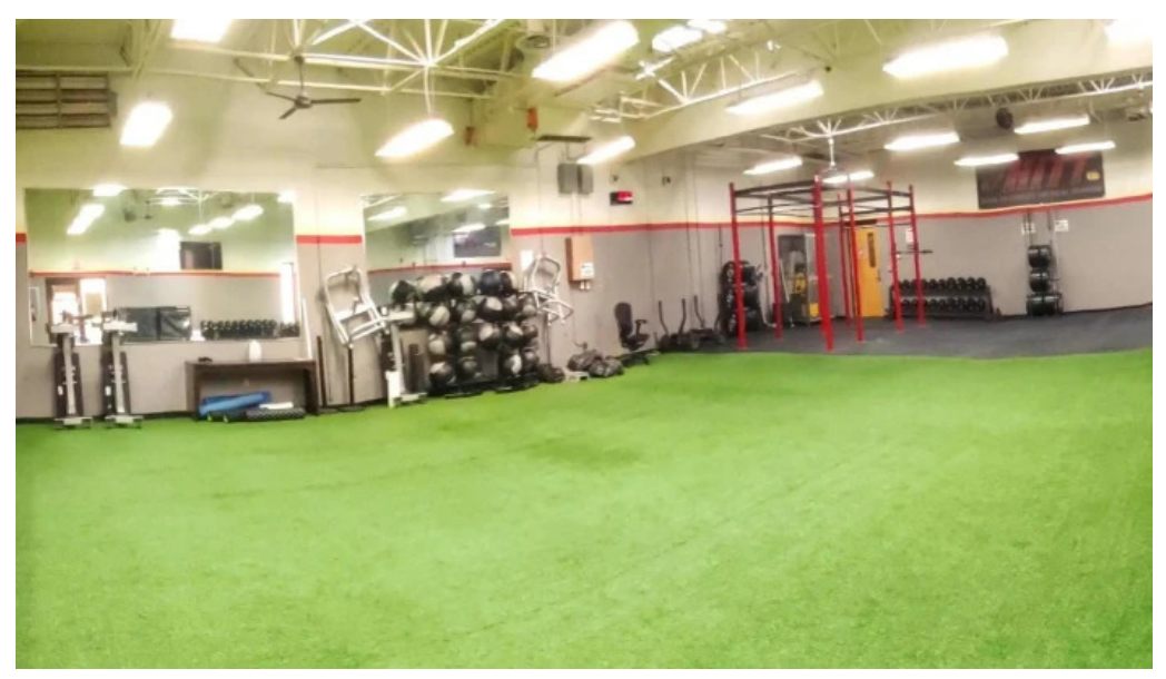
Henderson hall smith gym promotion