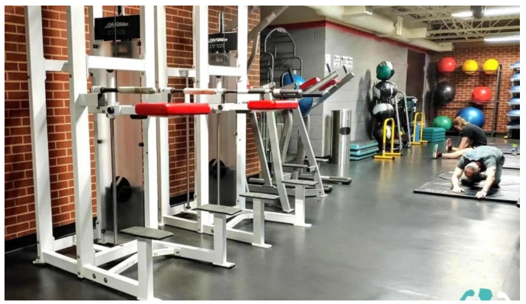
Henderson hall smith gym all