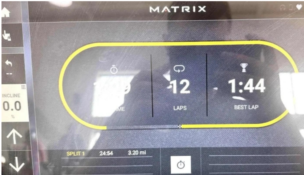
The edge fitness clubs comments