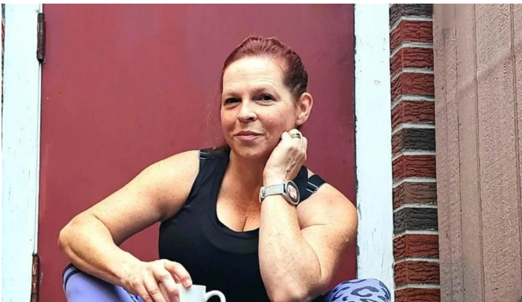
The edge fitness clubs score