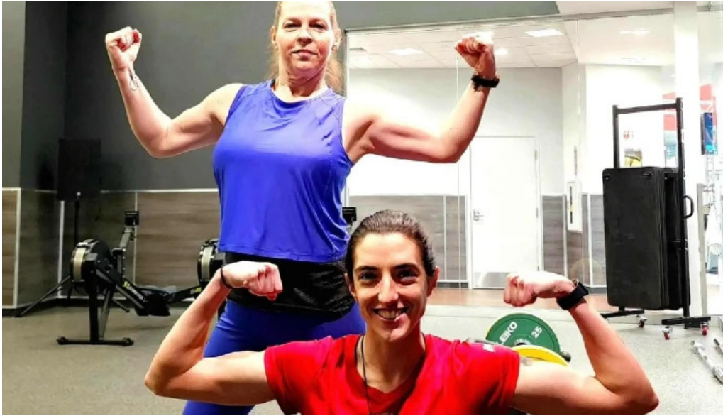
The edge fitness clubs how to get there