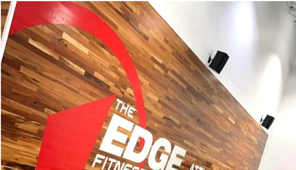
The edge fitness clubs gym