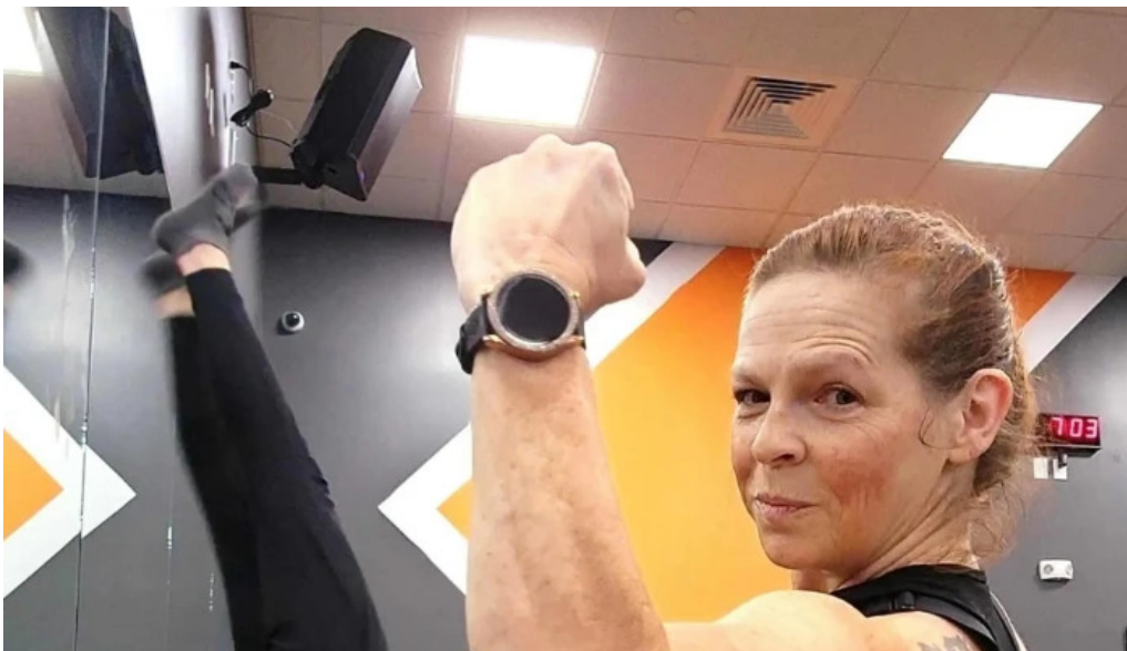
The edge fitness clubs attleboro