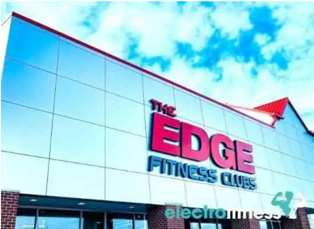
The edge fitness clubs by owner