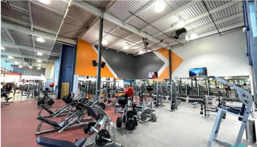
The edge fitness clubs all