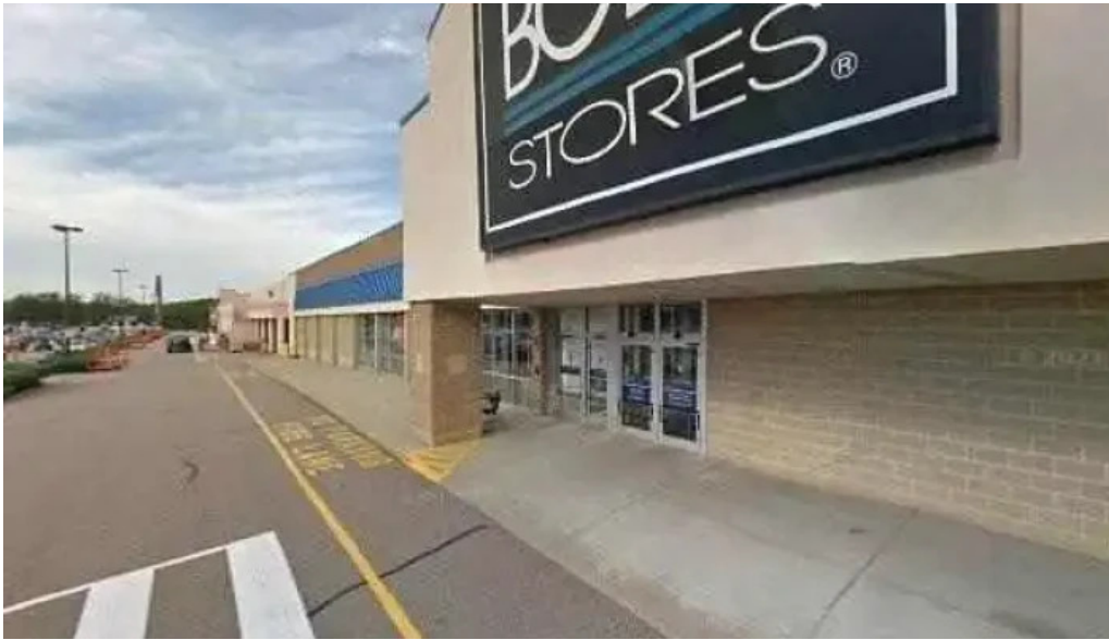
The edge fitness clubs street view 360deg