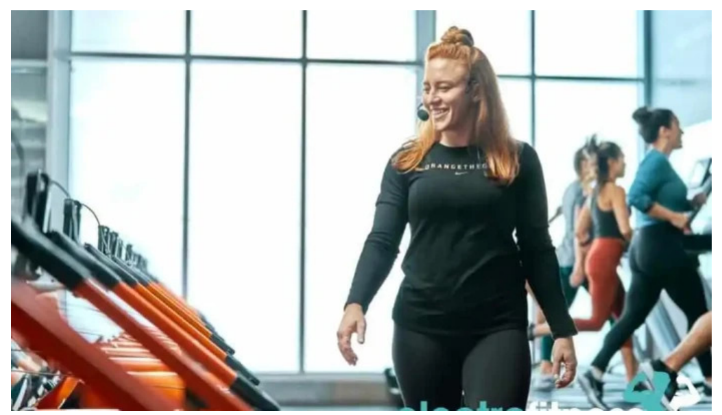
Orangetheory fitness by owner