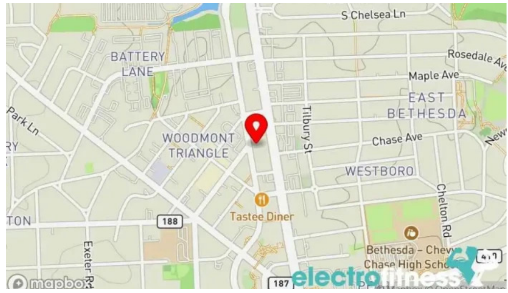
Orangetheory fitness map