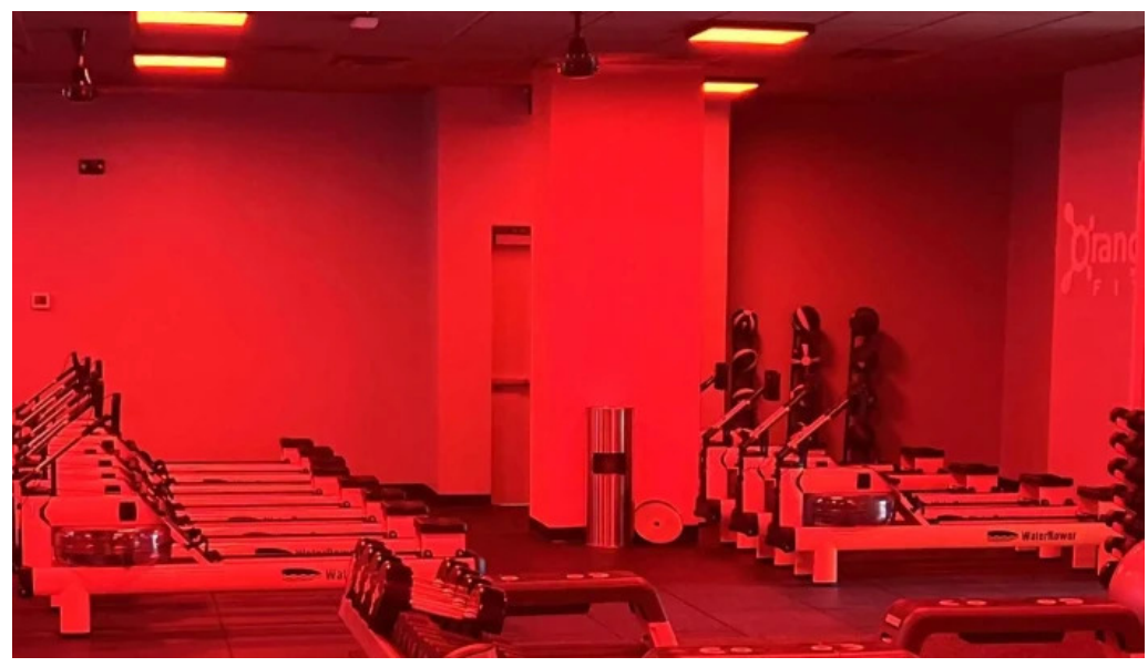
Orangetheory fitness bethesda