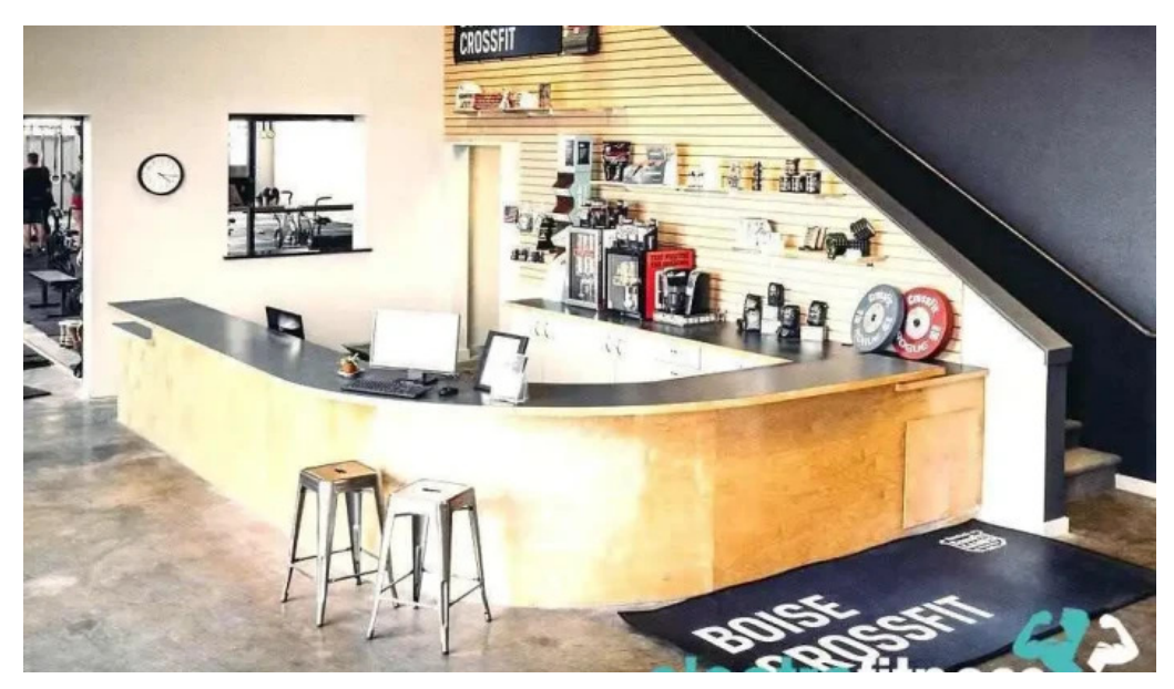
Boise crossfit by owner