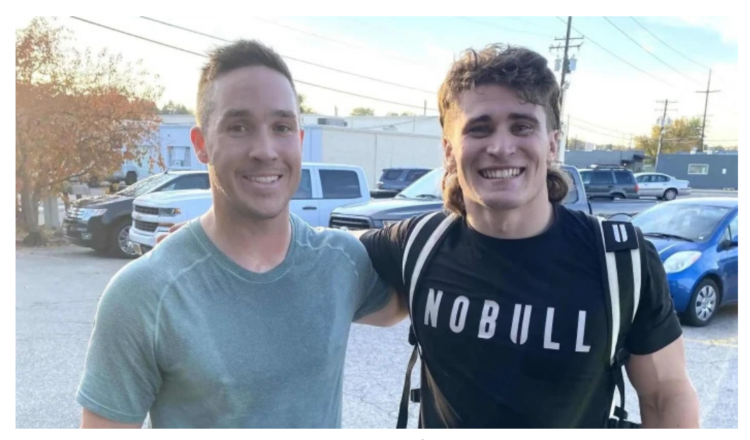
Boise crossfit gym