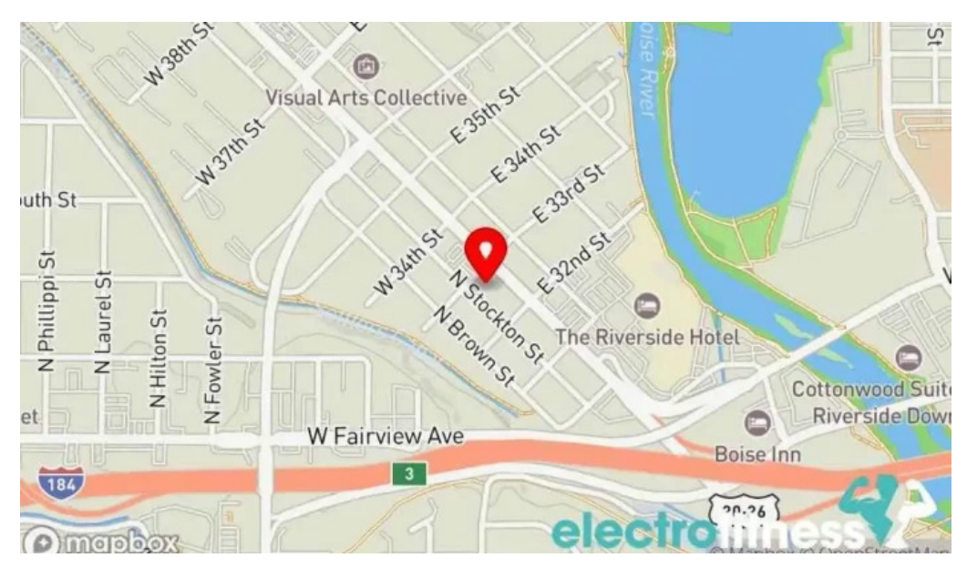
Boise crossfit map