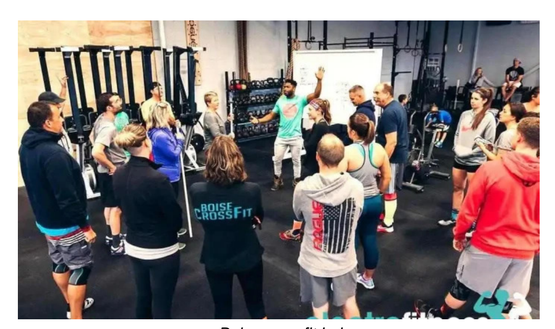
Boise crossfit boise