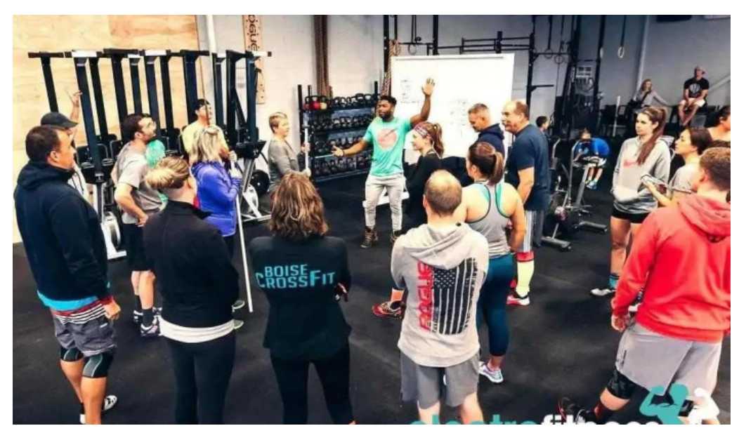
Boise crossfit all