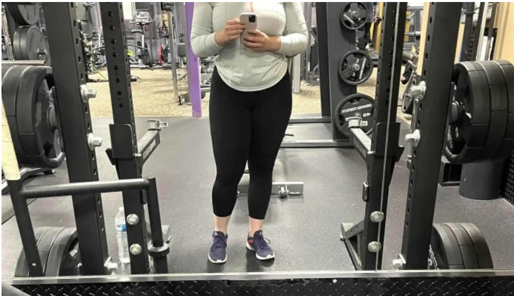
Anytime fitness phone