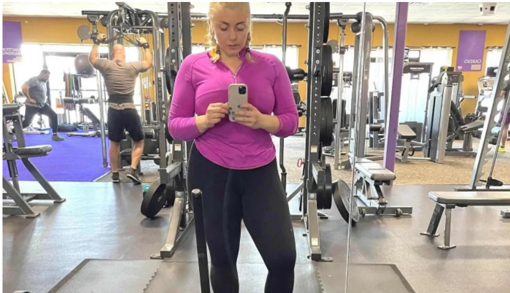
Anytime fitness catalog