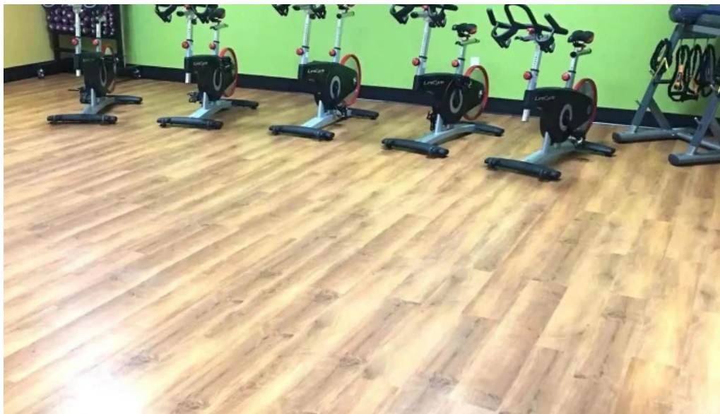
Anytime fitness by owner