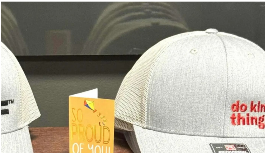
Anytime fitness gym