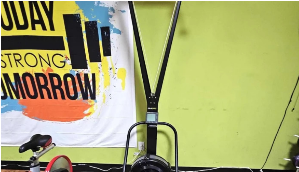
Anytime fitness photos