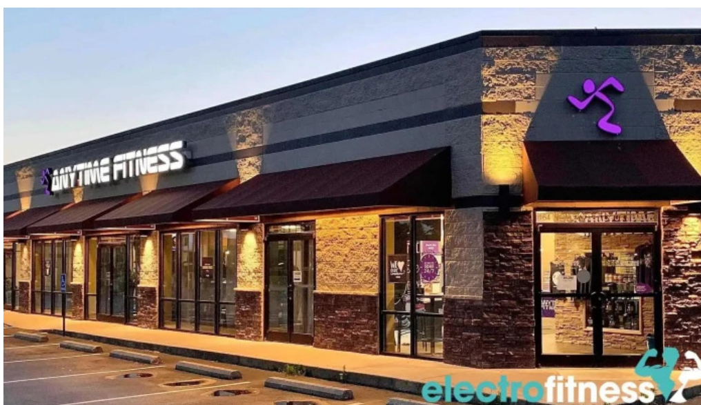
Anytime fitness all