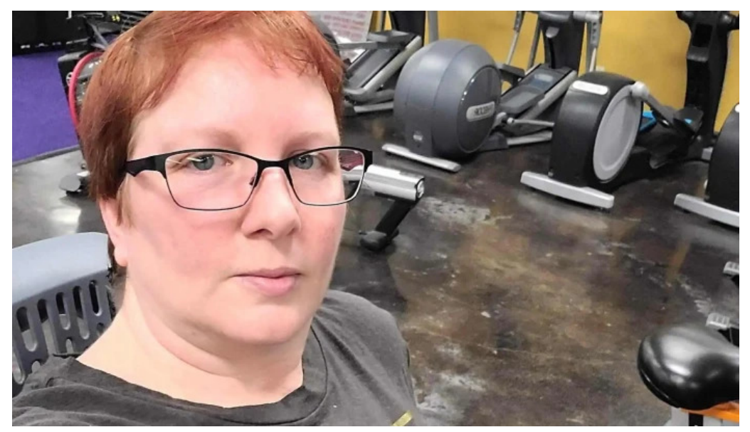
Anytime fitness gym