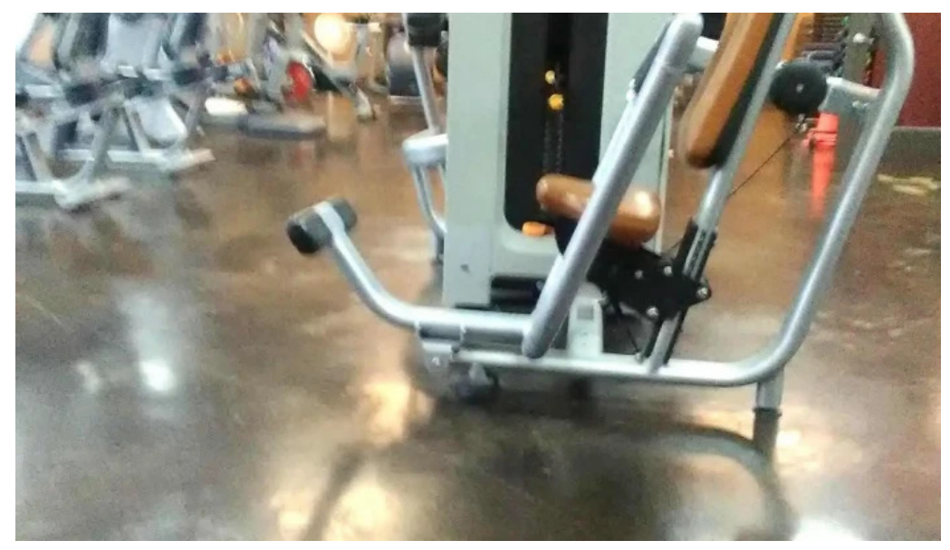
Anytime fitness exercise machine