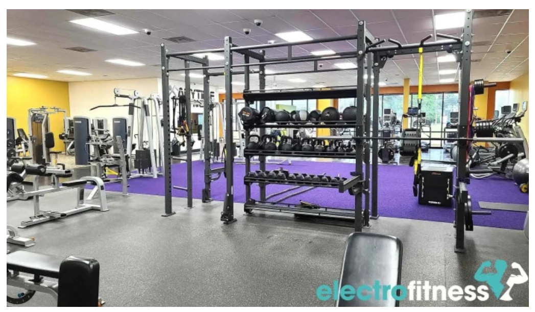
Anytime fitness all