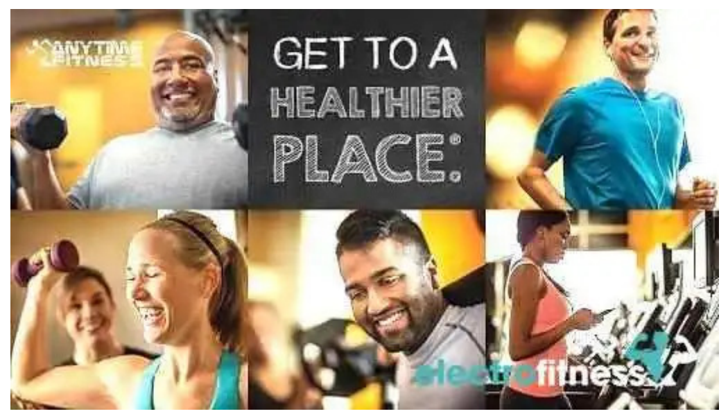
Anytime fitness by owner