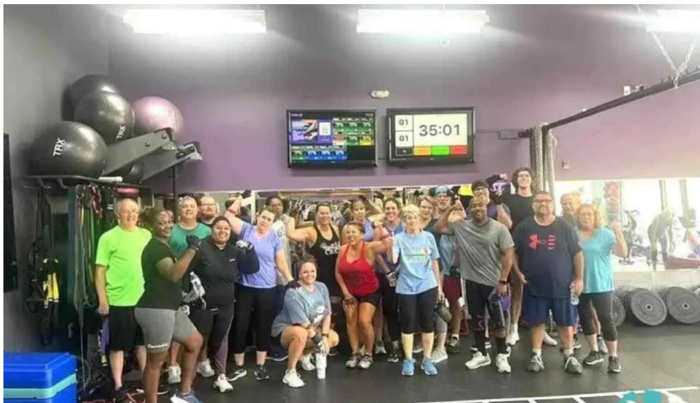
Anytime fitness by owner