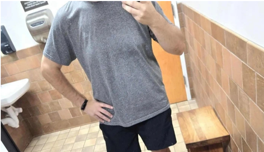
Anytime fitness gym