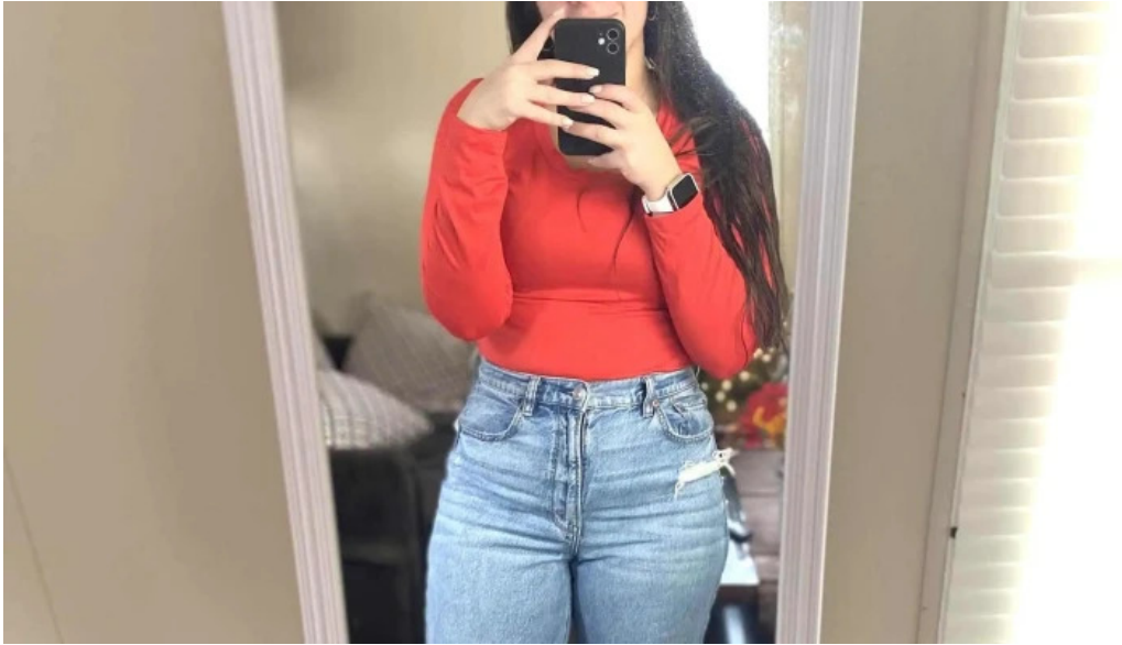
Anytime fitness instagram