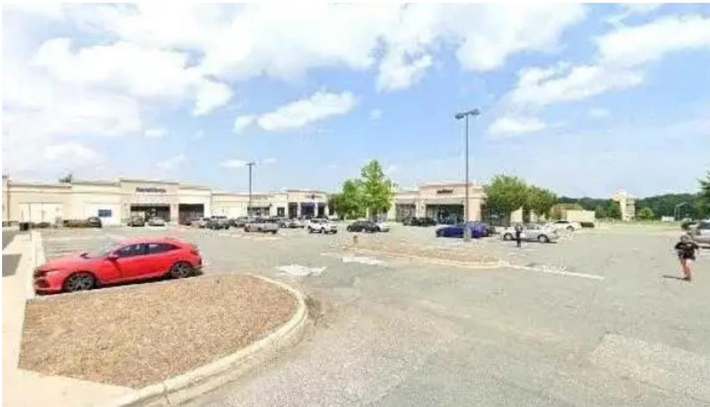
Anytime fitness street view 360deg