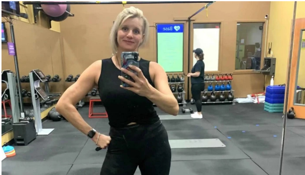
Anytime fitness photos