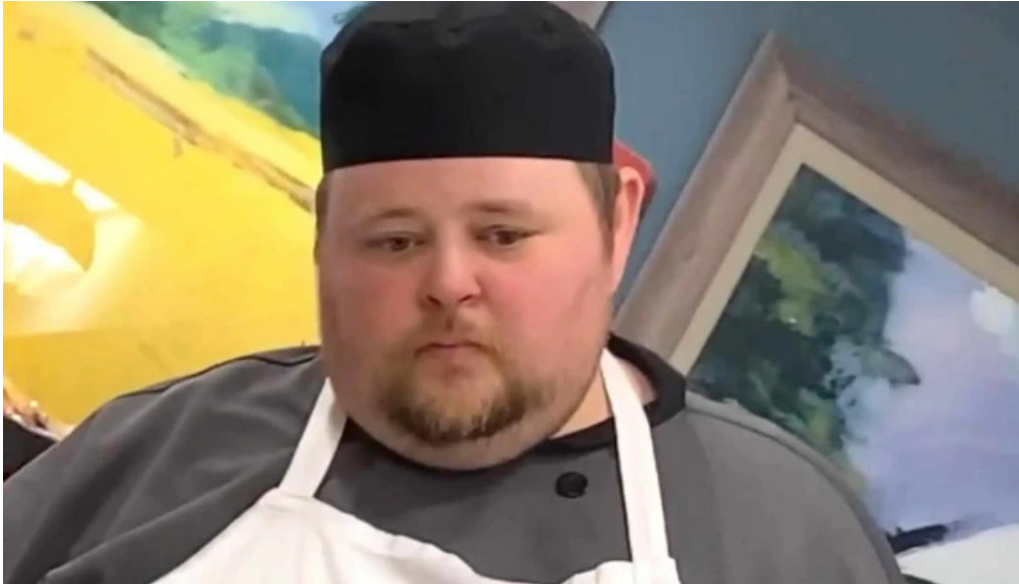
Anytime fitness videos