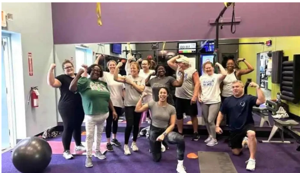
Anytime fitness all