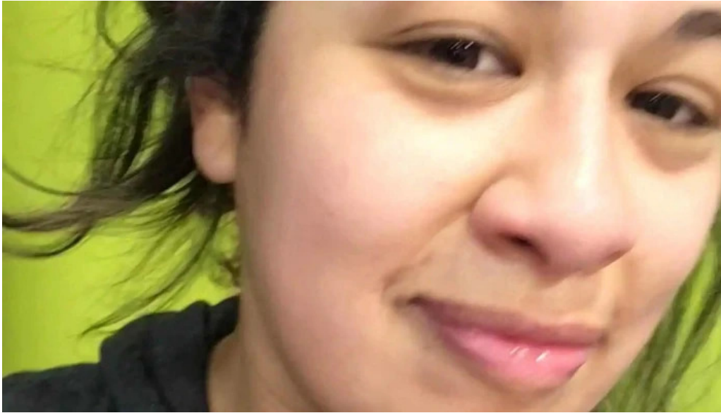
Anytime fitness schedule