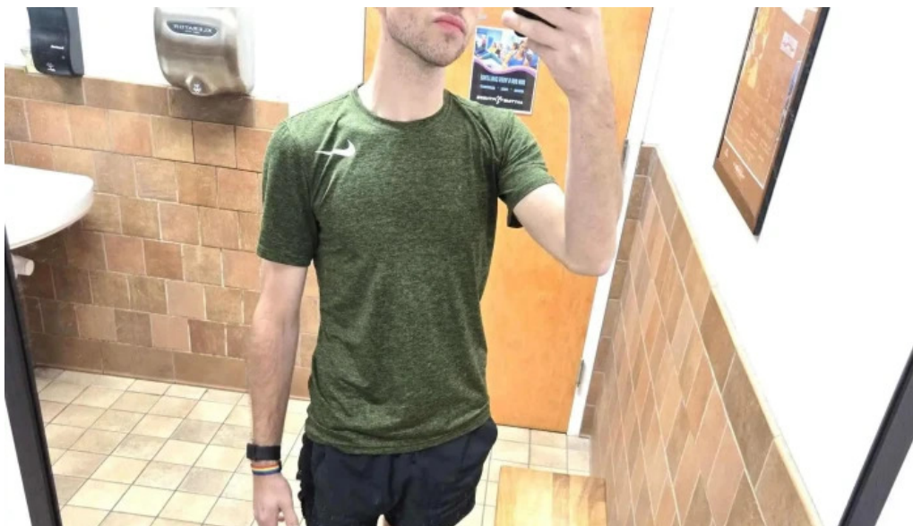
Anytime fitness burlington