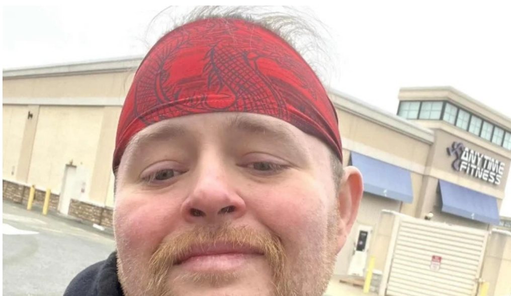
Anytime fitness address