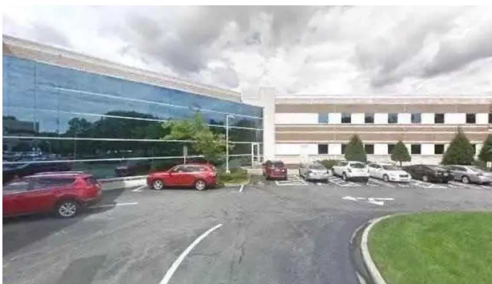
Cone health wellzone at alamance regional all