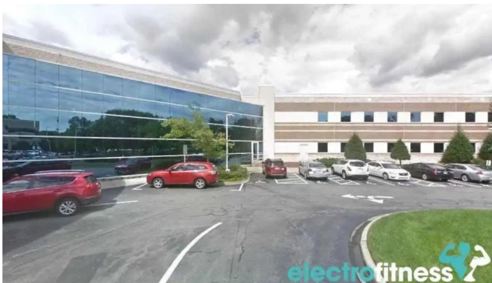
Cone health wellzone at alamance regional burlington