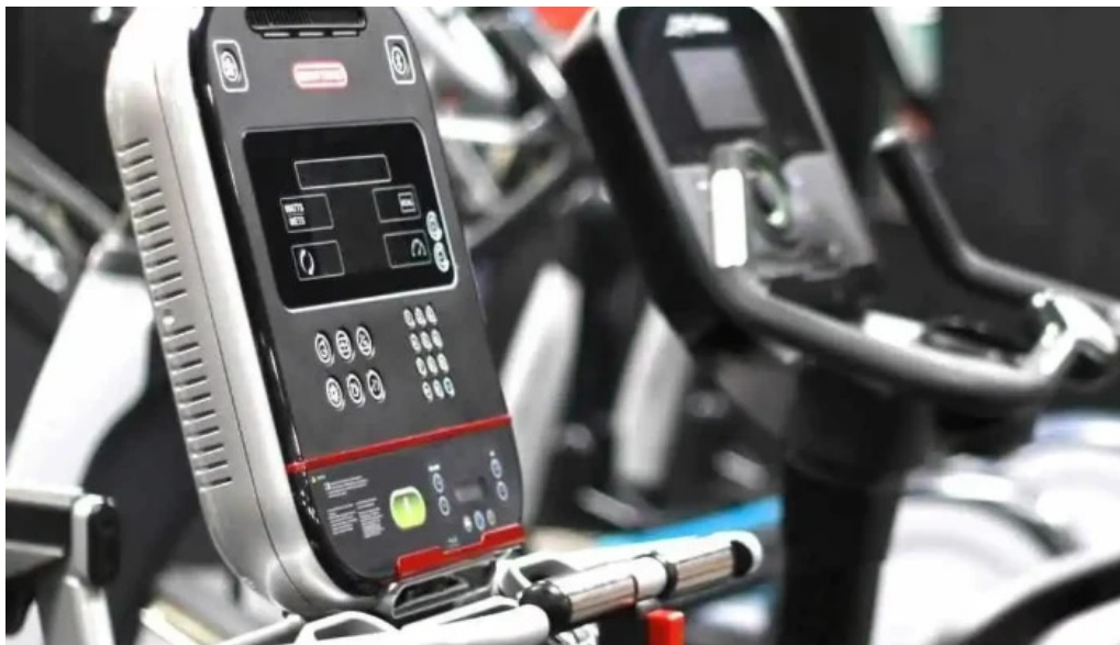
Superfitness by owner