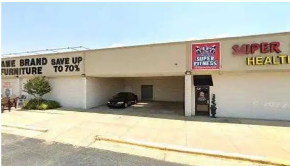
Superfitness street view 360deg