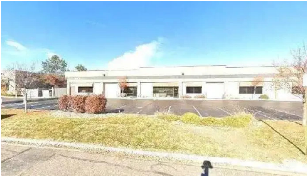
Method crossfit method fitness street view 360deg