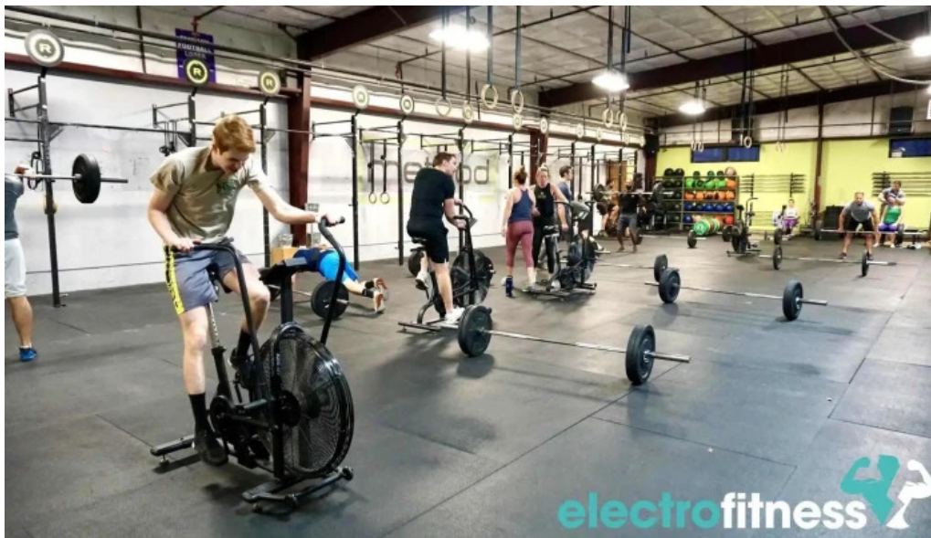
Method crossfit method fitness exercise machine