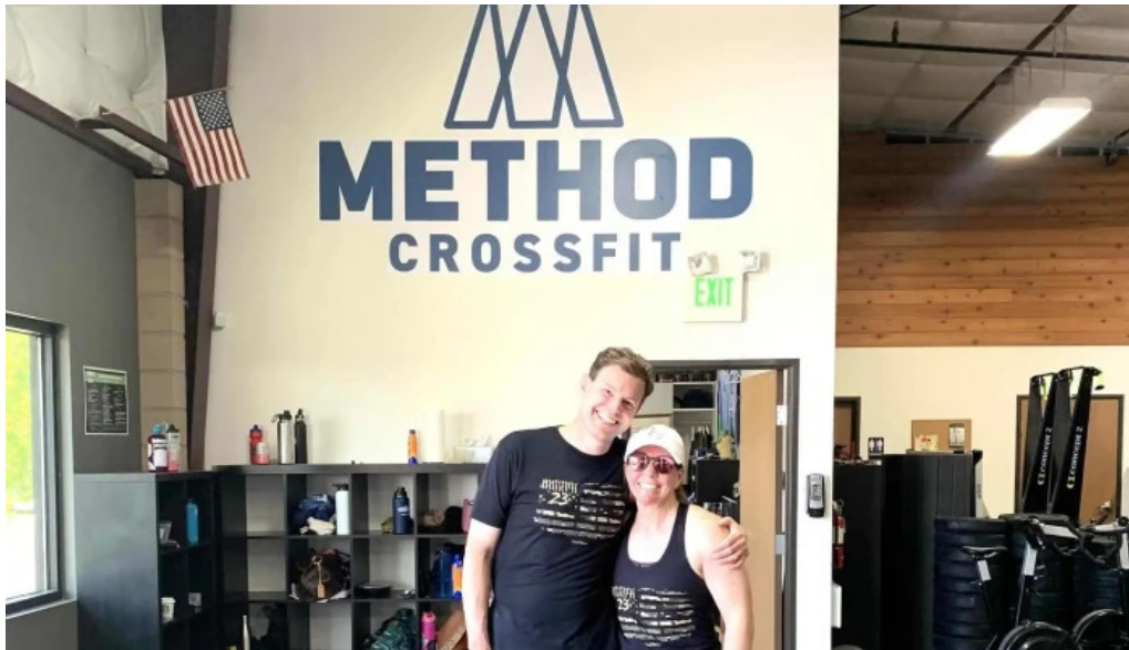
Method crossfit method fitness gym