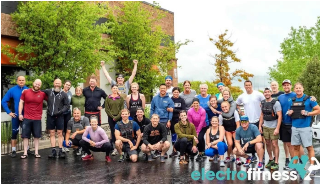
Method crossfit method fitness centennial