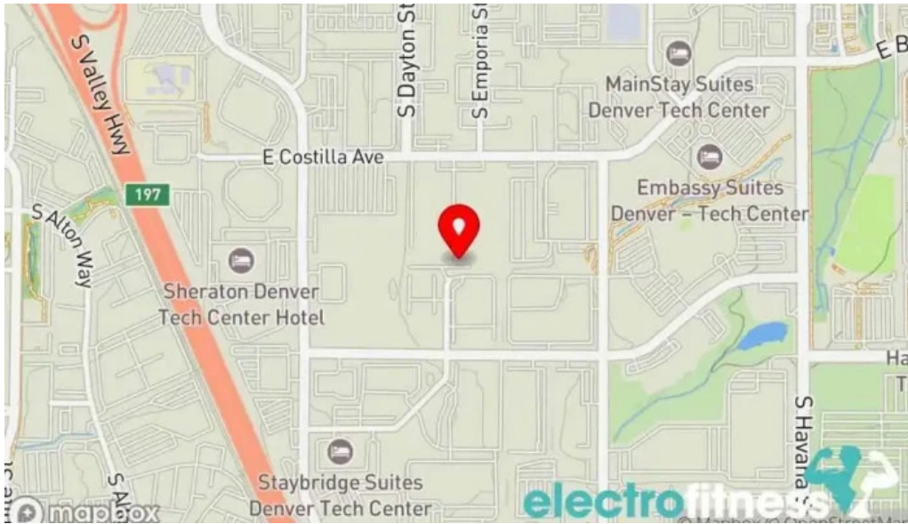
Method crossfit method fitness map