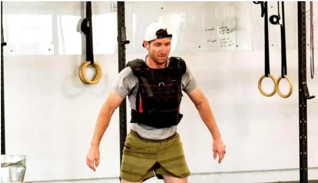
Method crossfit method fitness by owner