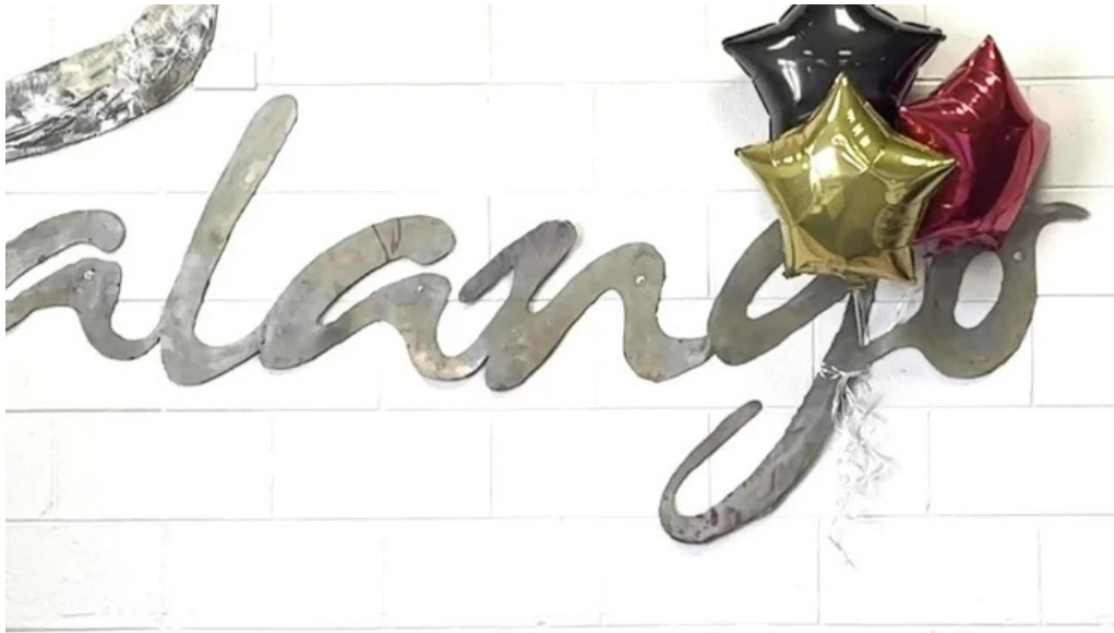
Palango fitness address