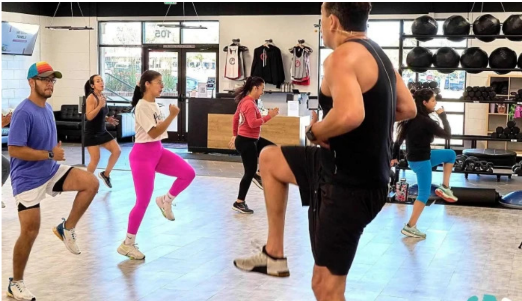
Palango fitness by owner