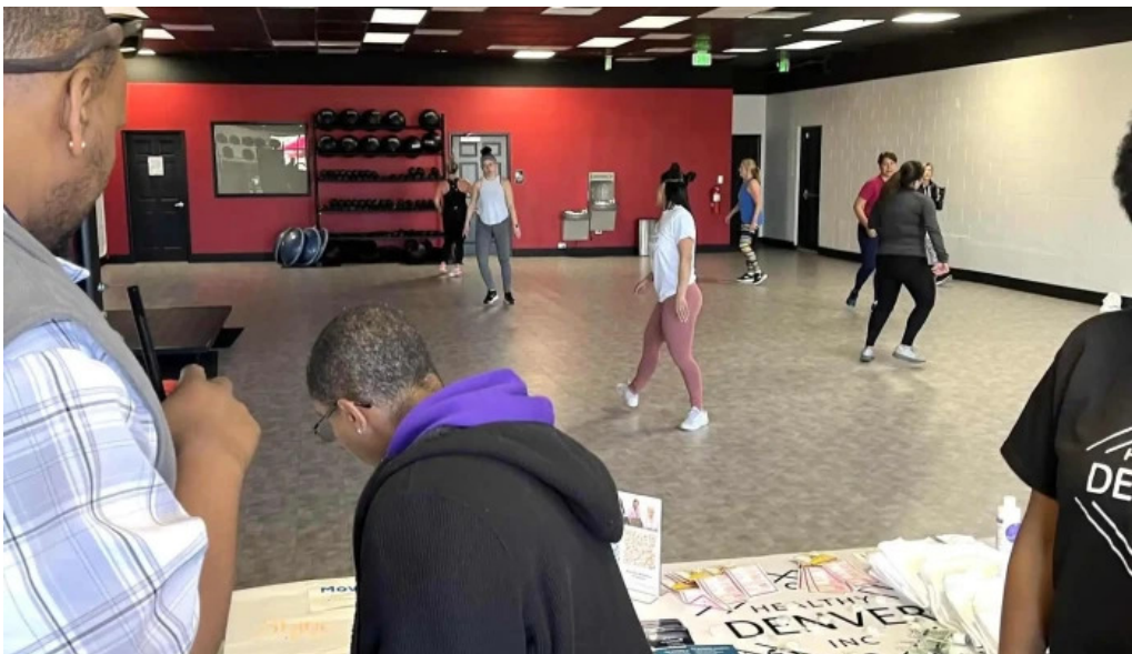
Palango fitness catalog