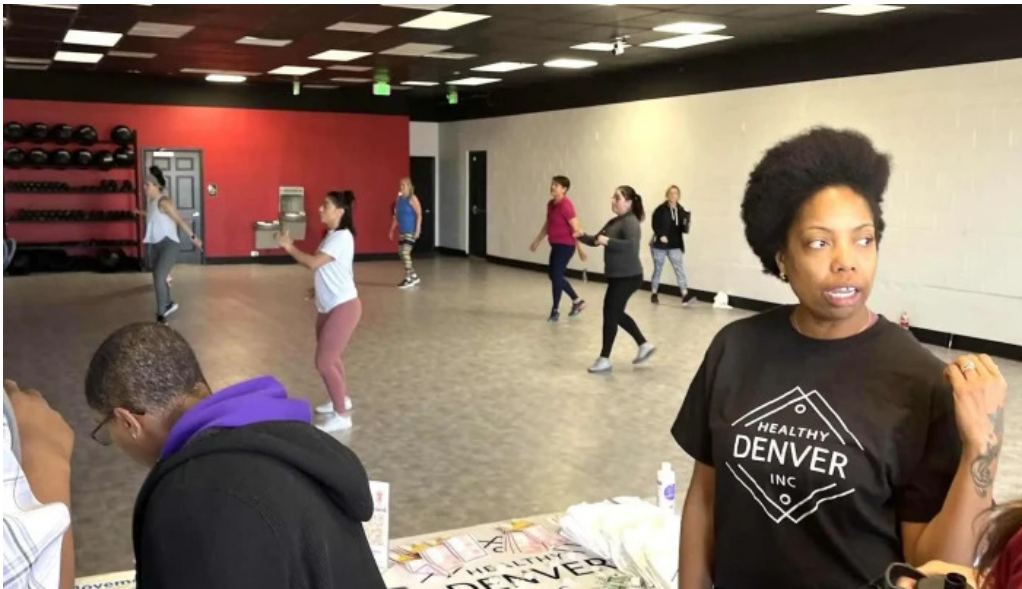
Palango fitness schedule