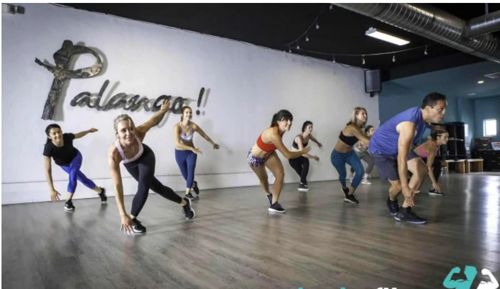
Palango fitness all