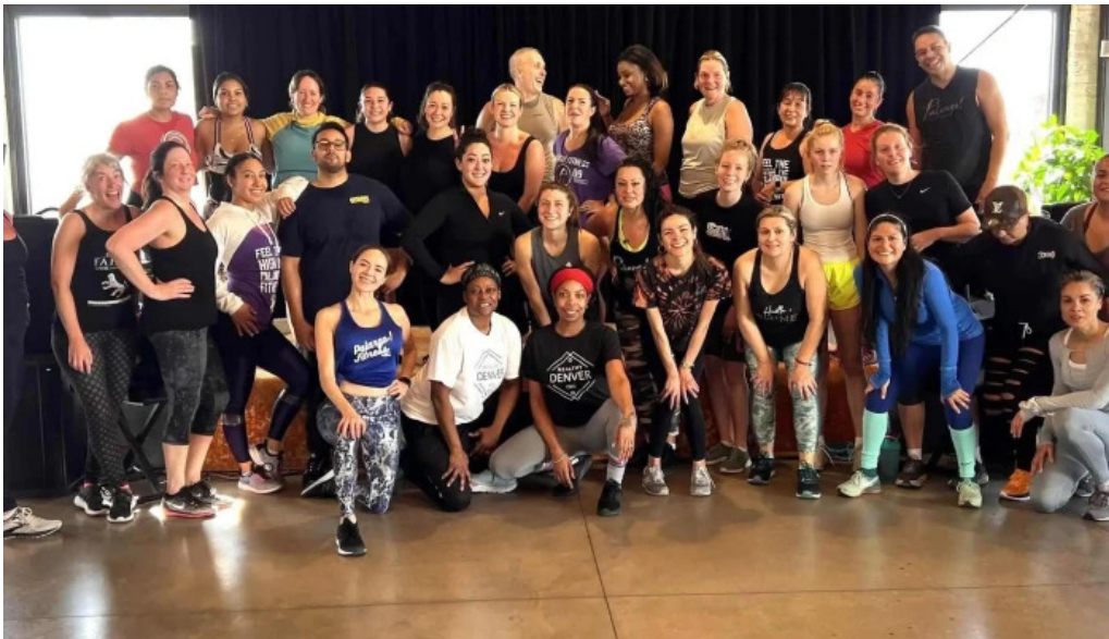
Palango fitness gym