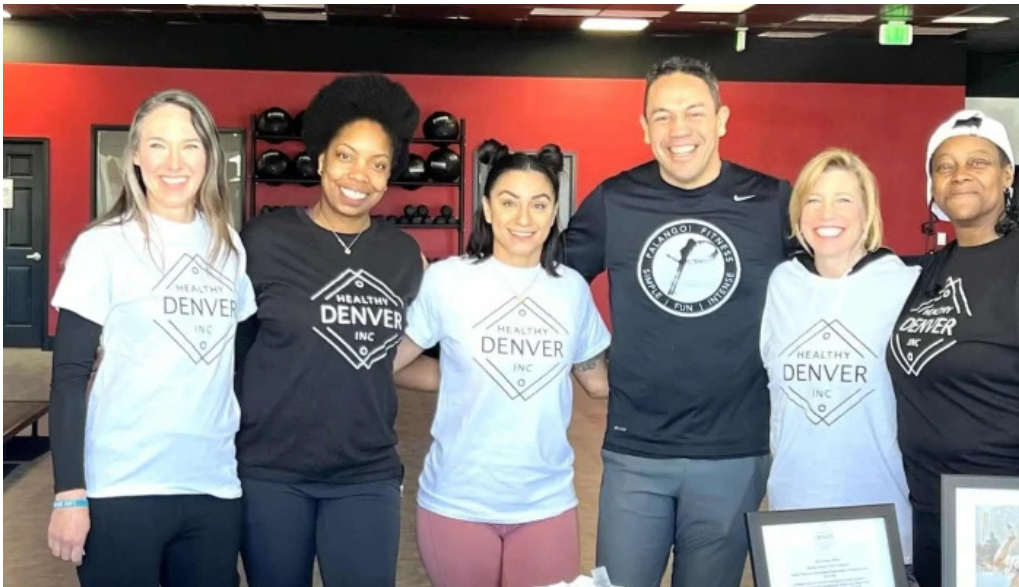
Palango fitness centennial