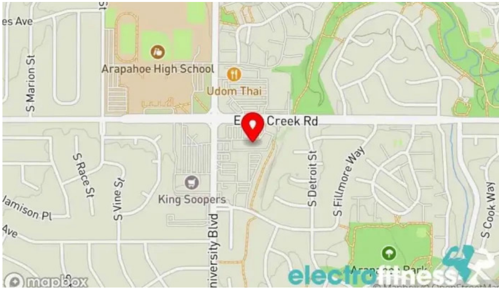
Palango fitness map