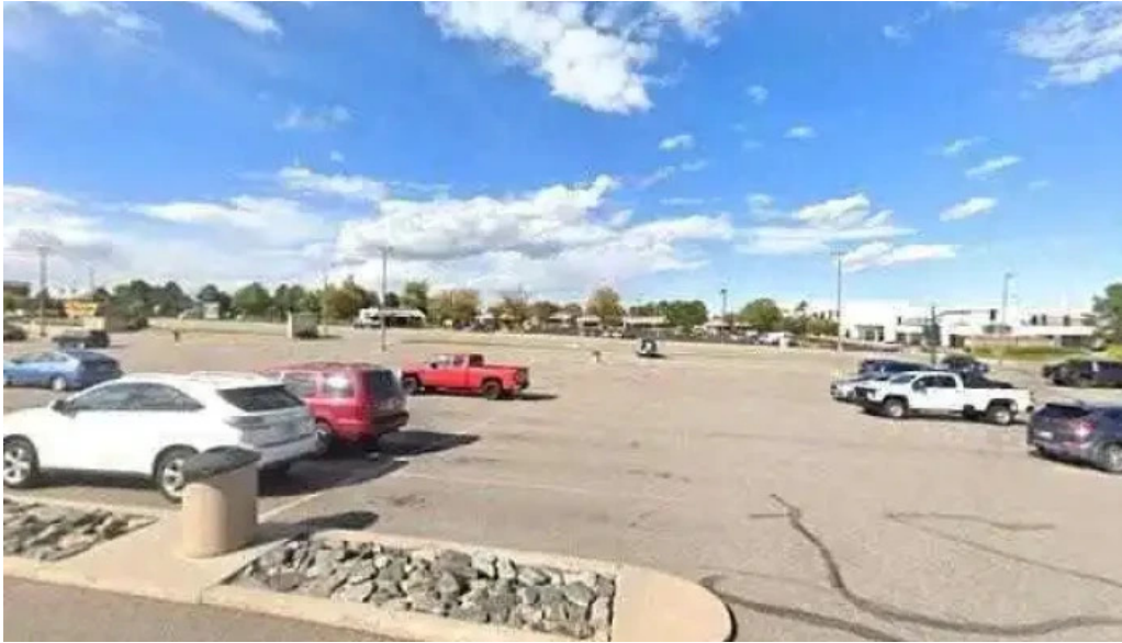
Palango fitness street view 360deg