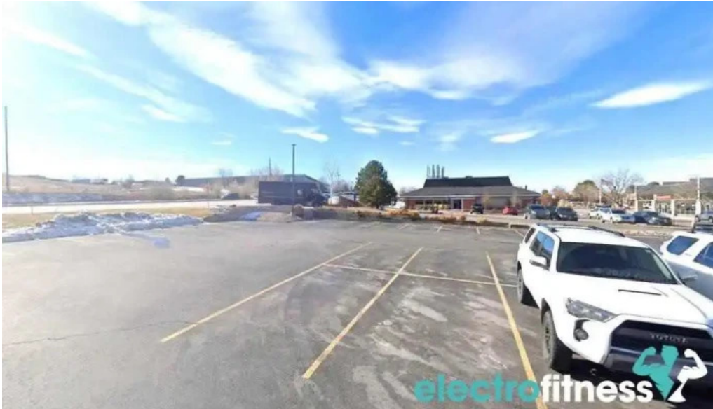
Thryve strength fitness centennial