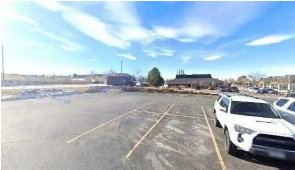
Thryve strength fitness all