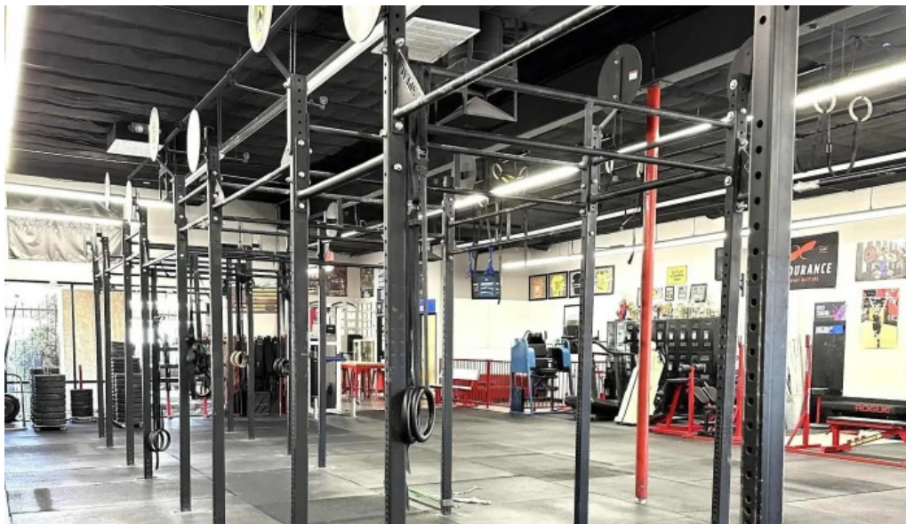
East valley strength and conditioning videos