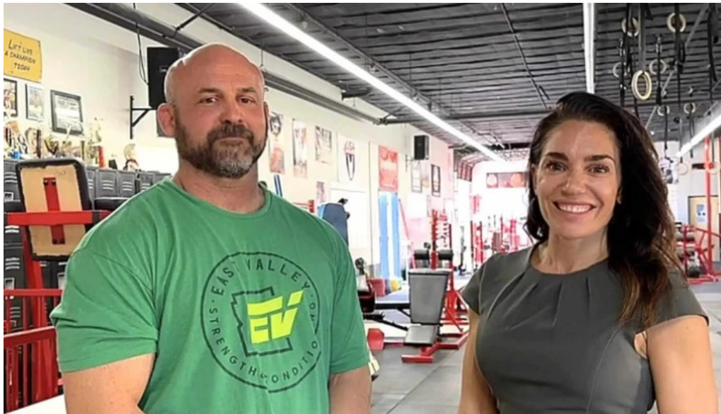
East valley strength and conditioning how to get there