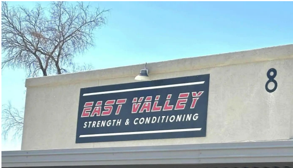
East valley strength and conditioning near me