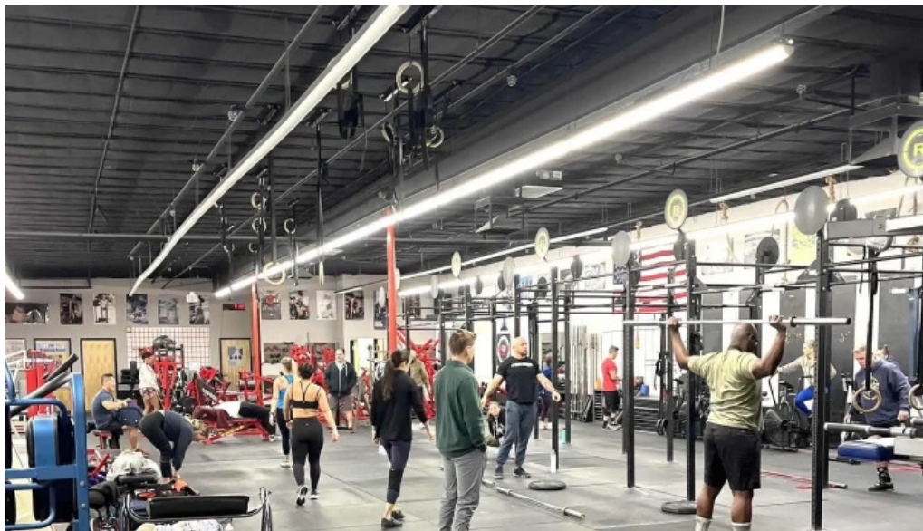
East valley strength and conditioning gym