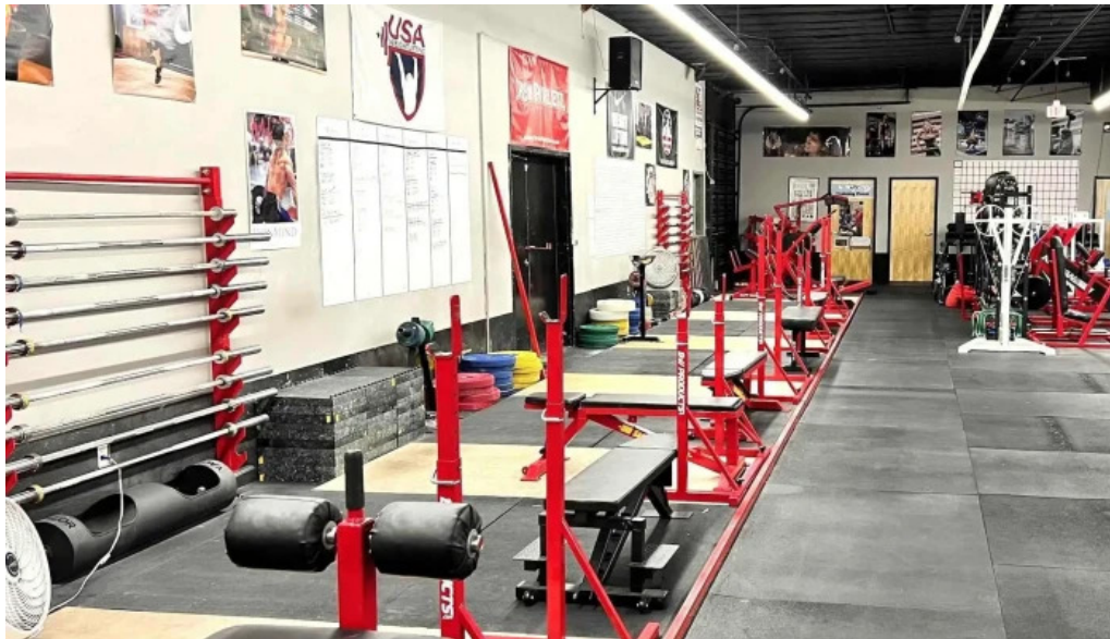
East valley strength and conditioning website