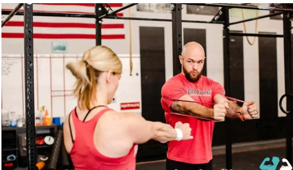
East valley strength and conditioning by owner