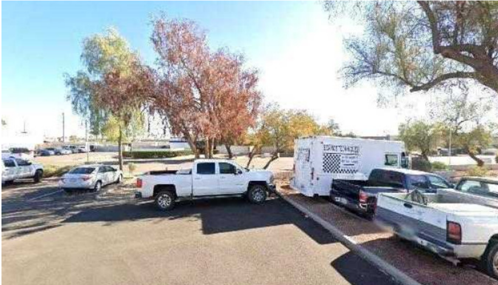
East valley strength and conditioning street view 360deg