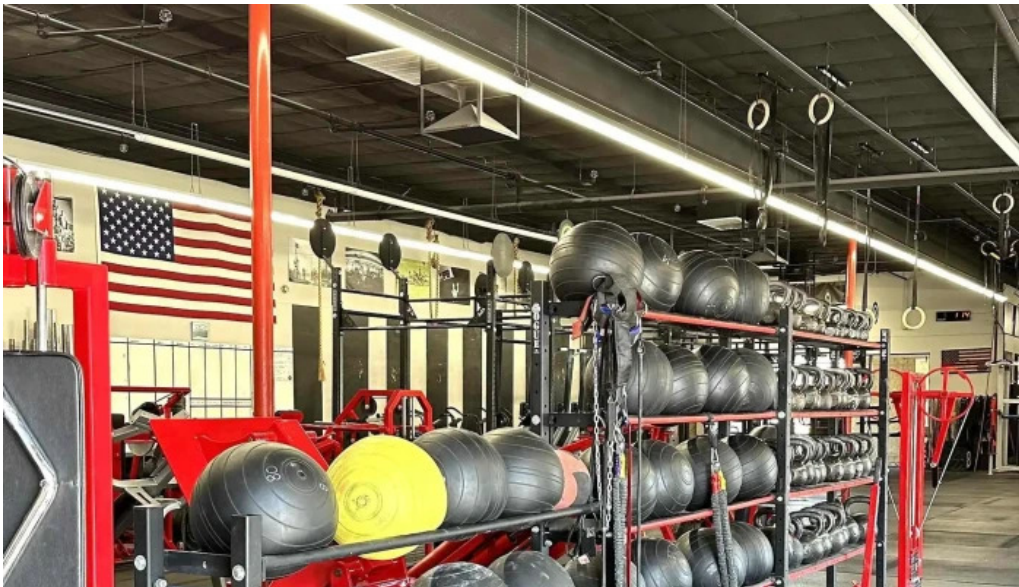
East valley strength and conditioning reviews