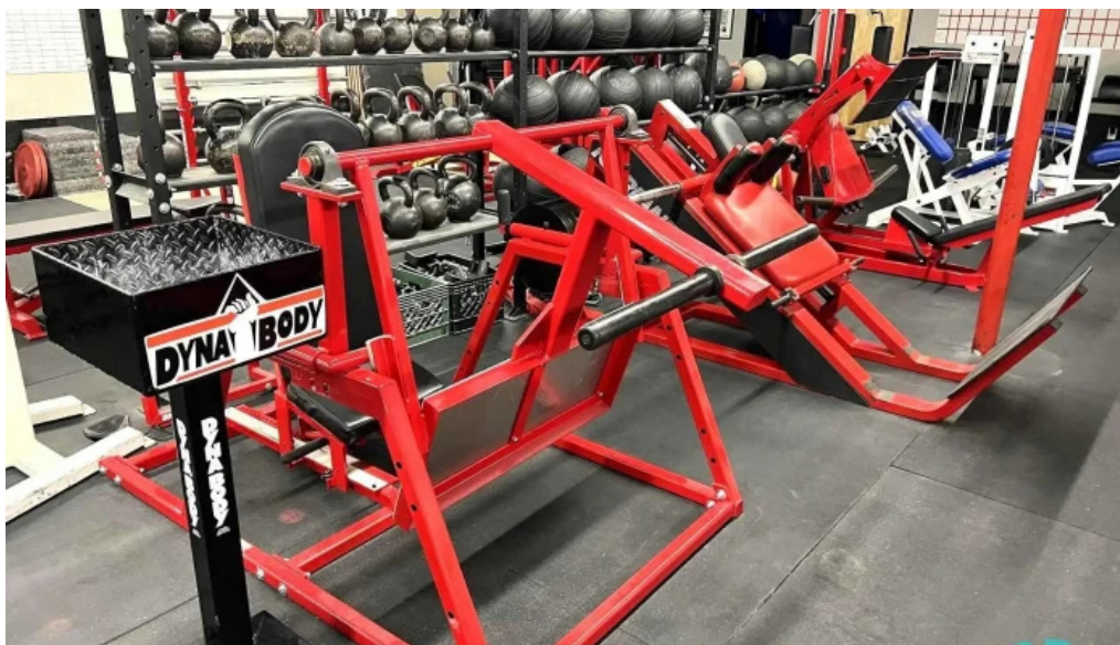
East valley strength and conditioning all