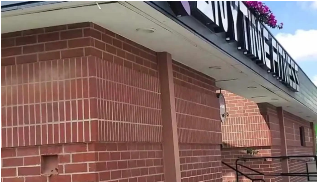
Anytime fitness videos