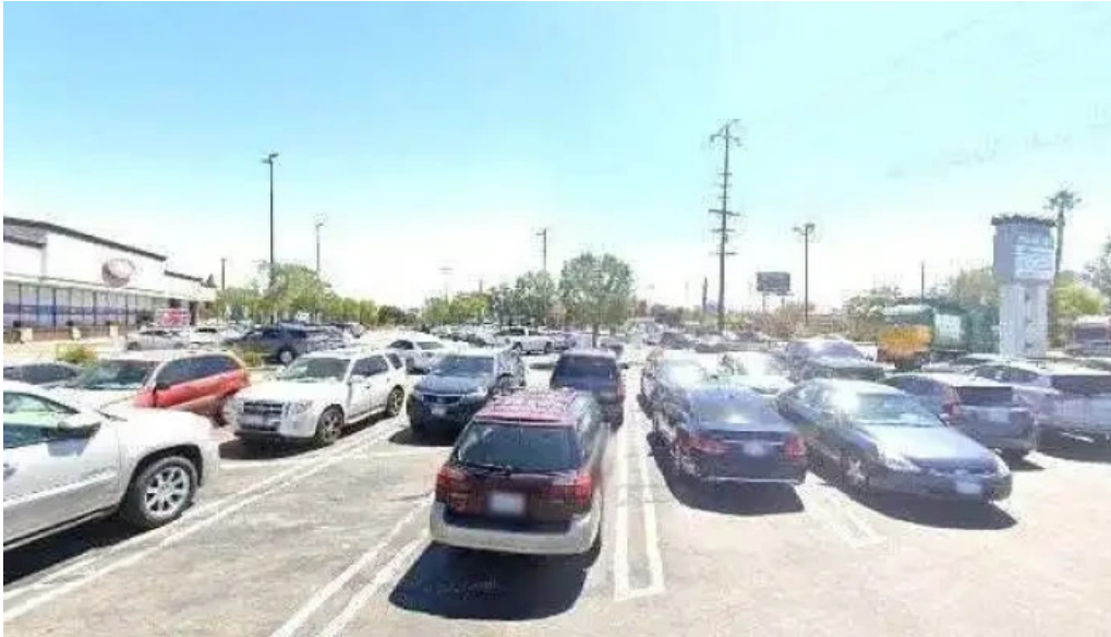
Anytime fitness street view 360deg