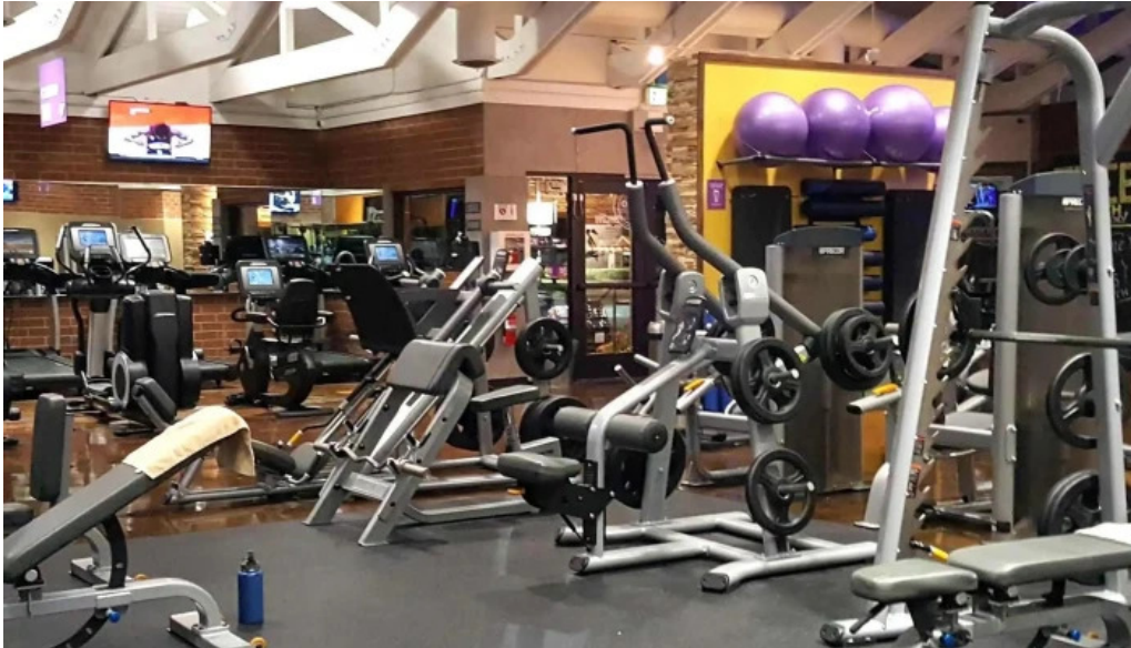
Anytime fitness gym