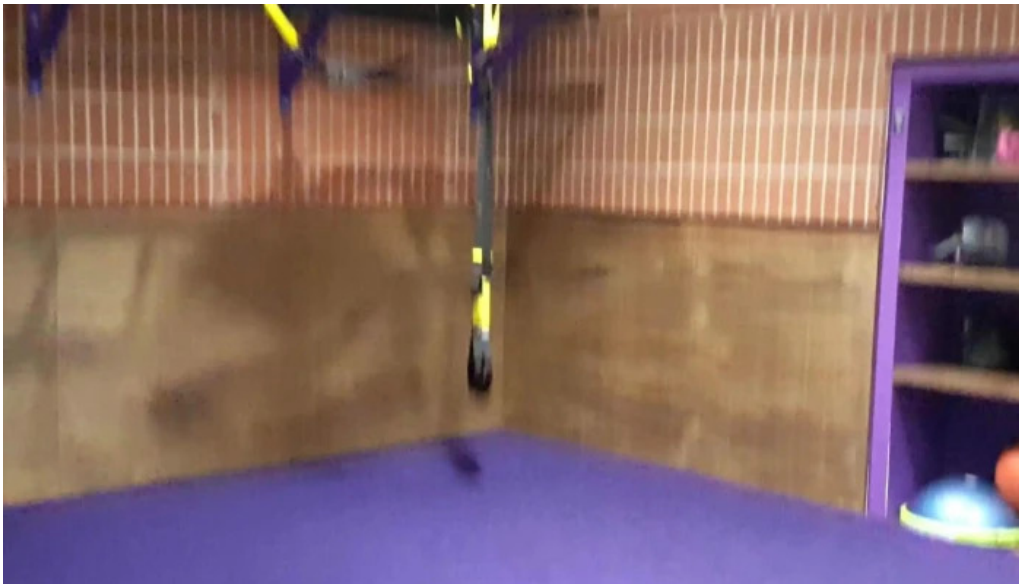
Anytime fitness chatsworth