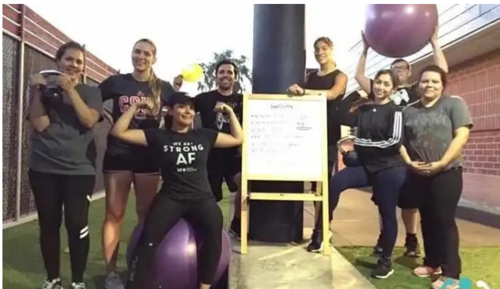
Anytime fitness by owner