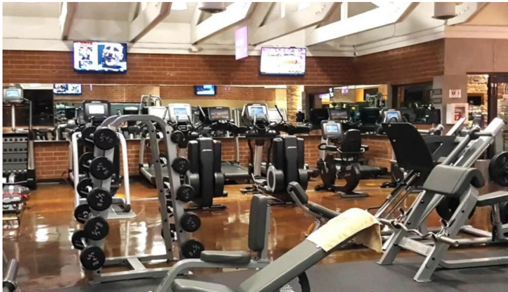
Anytime fitness phone