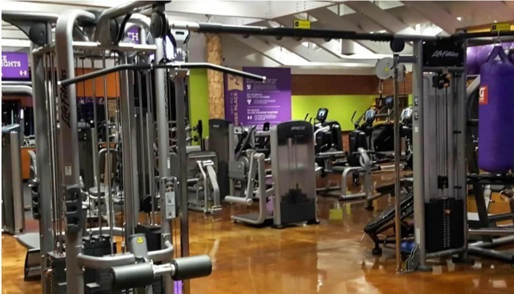
Anytime fitness where