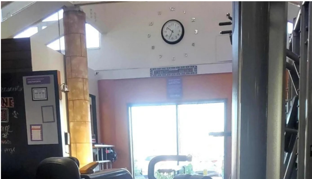
Anytime fitness photos