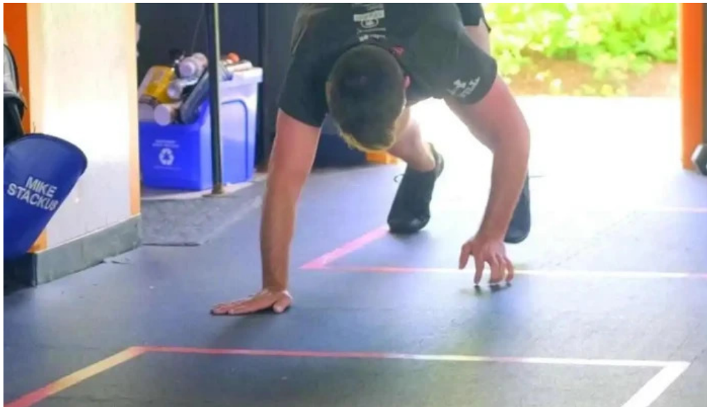
Recharge modern health and fitness videos