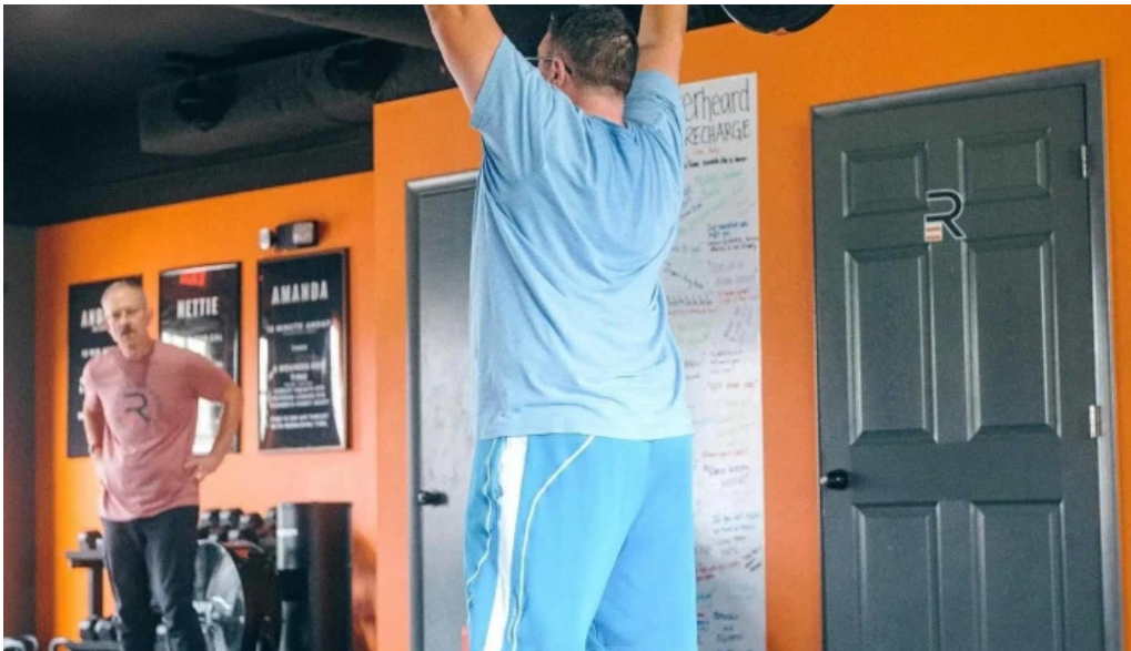
Recharge modern health and fitness gym