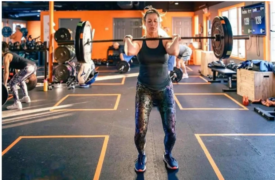
Recharge modern health and fitness by owner