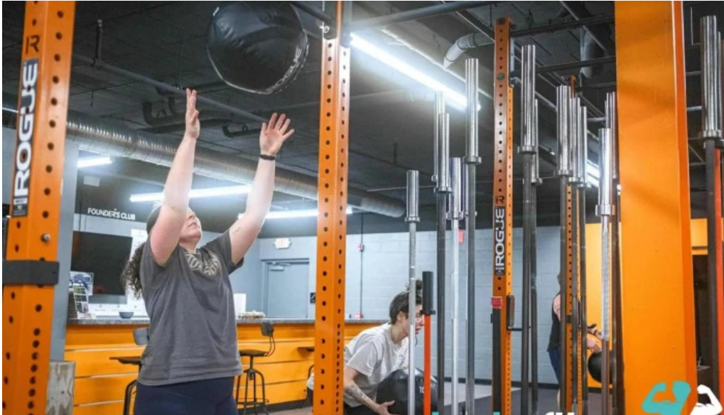
Recharge modern health and fitness latest