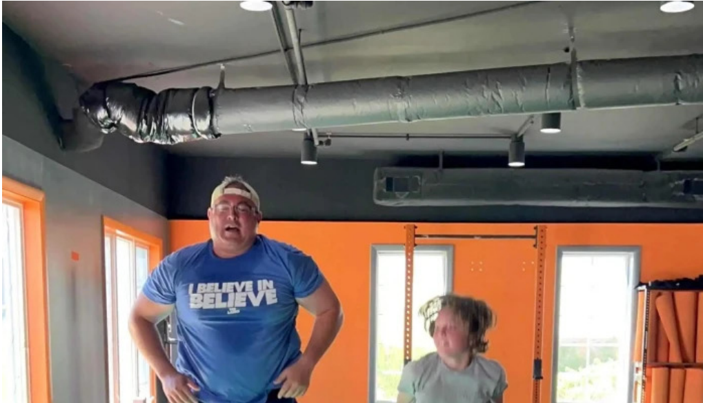
Recharge modern health and fitness columbia