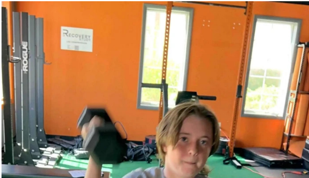
Recharge modern health and fitness schedule