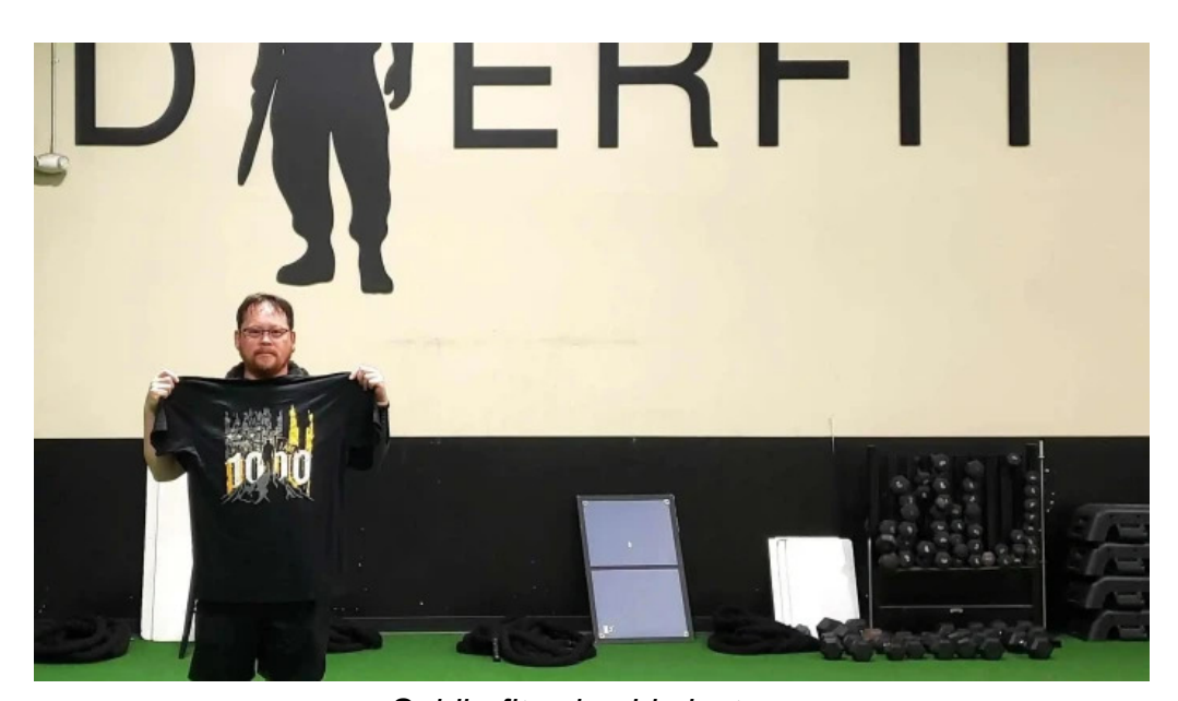
Soldierfit columbia instagram