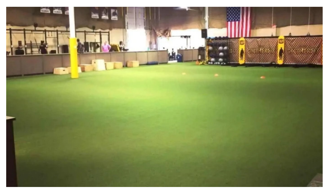
Soldierfit columbia by owner