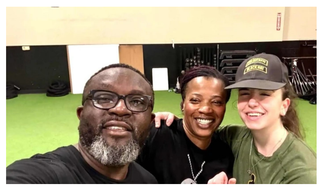
Soldierfit columbia photos