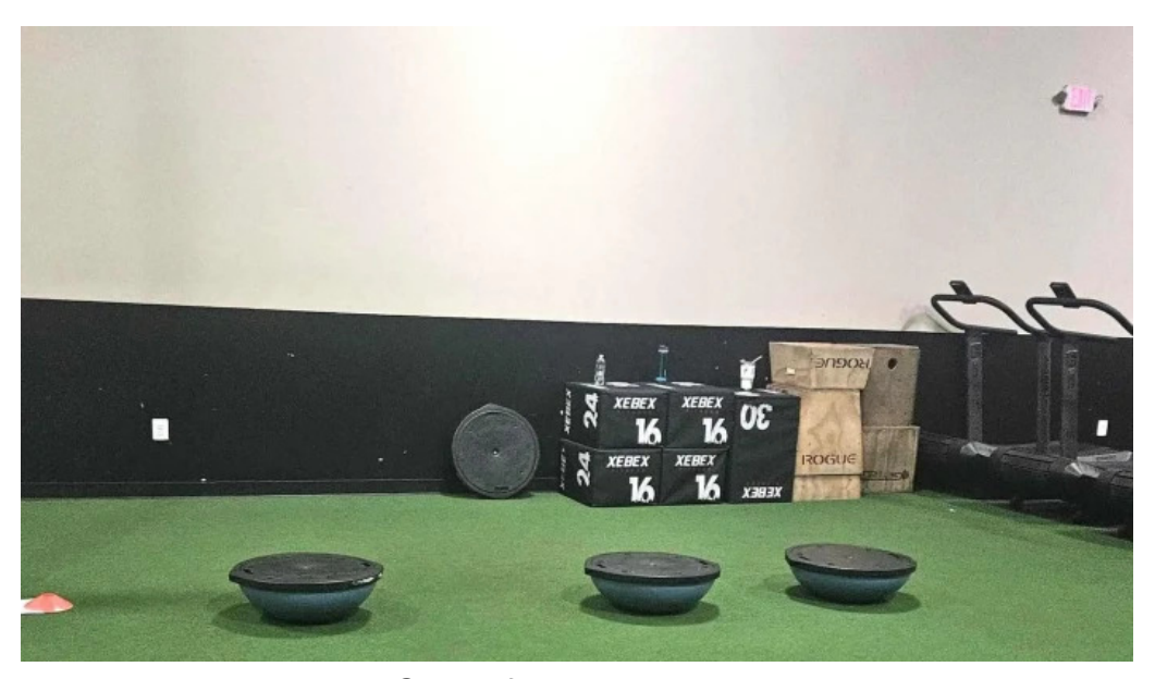
Soldierfit columbia website