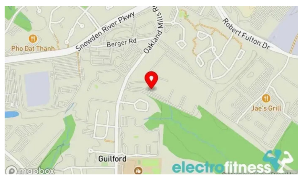
Soldierfit columbia map