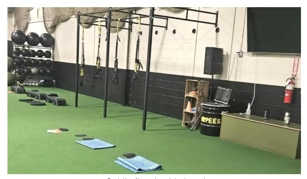
Soldierfit columbia location