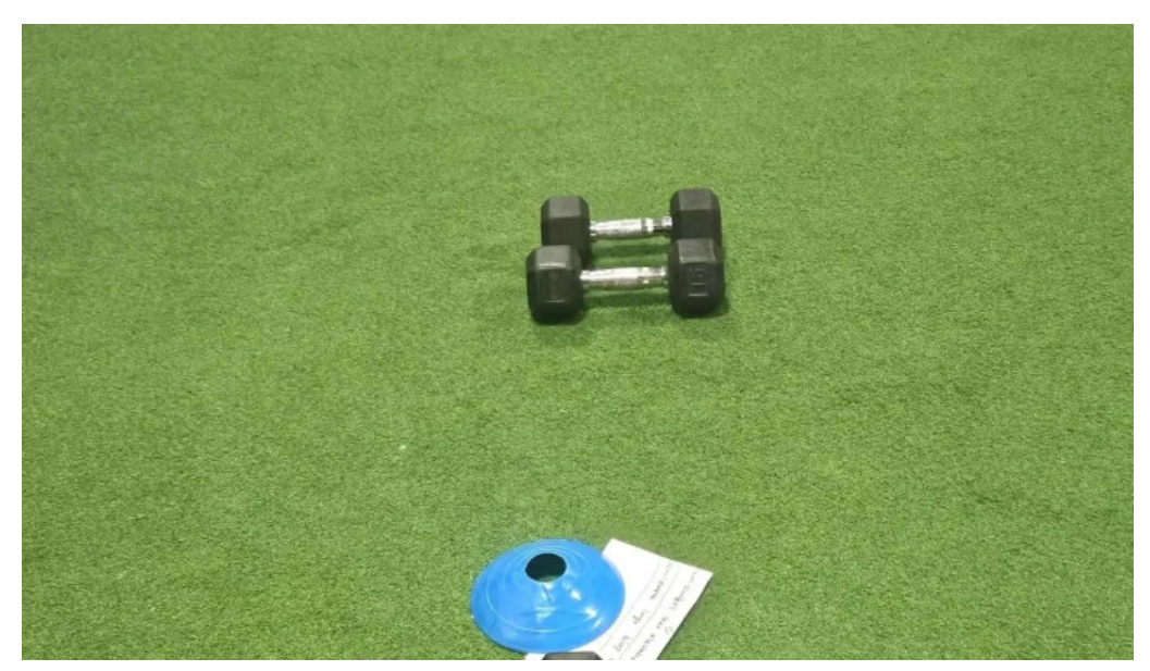
Soldierfit columbia columbia