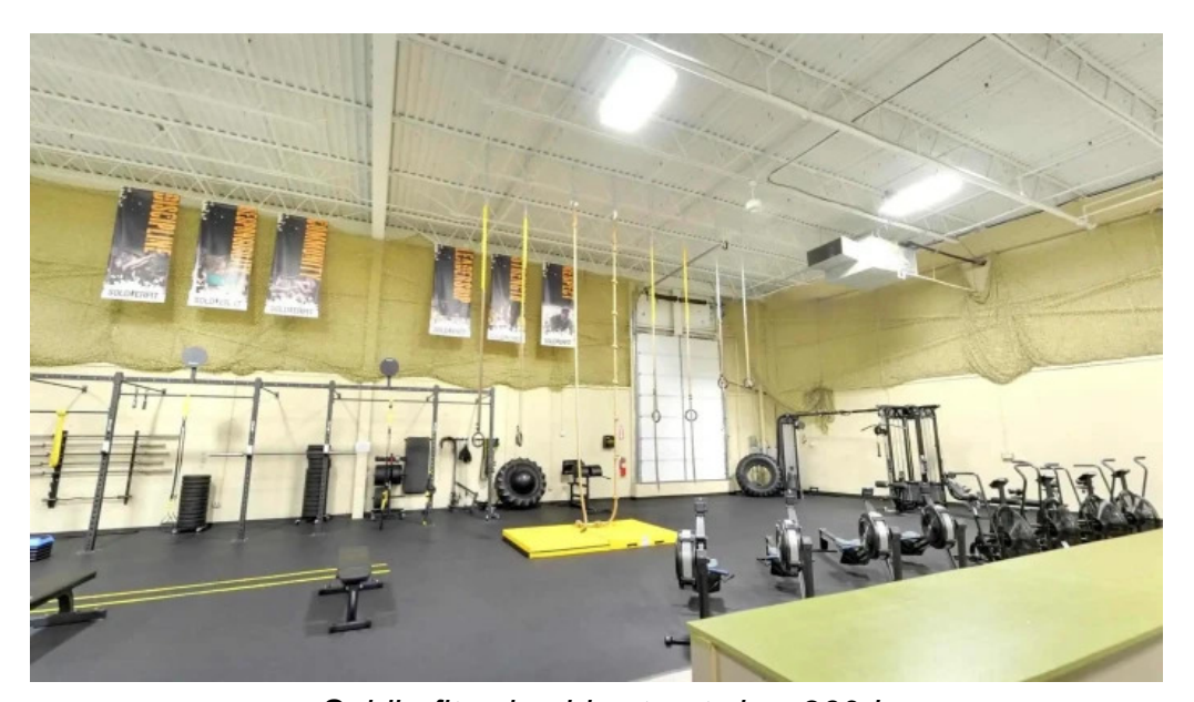
Soldierfit columbia street view 360deg