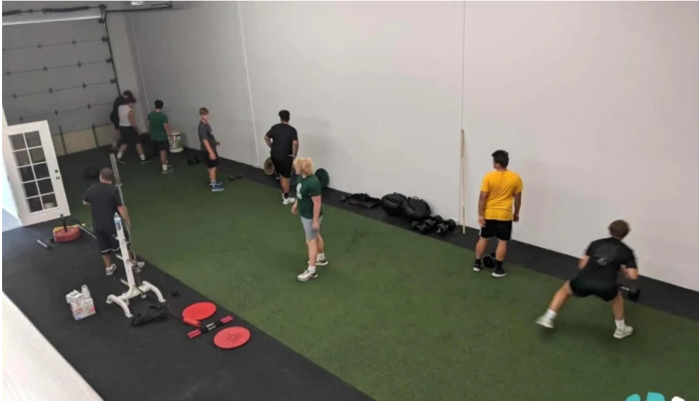
2g sports fitness by owner