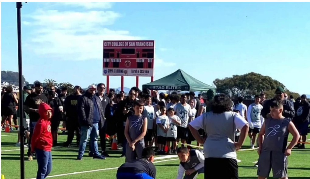
2g sports fitness concord