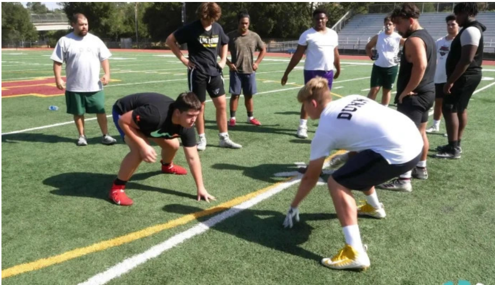
2g sports fitness all