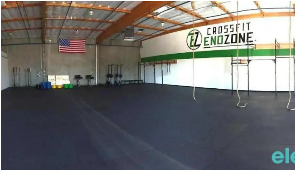
Crossfit endzone concord