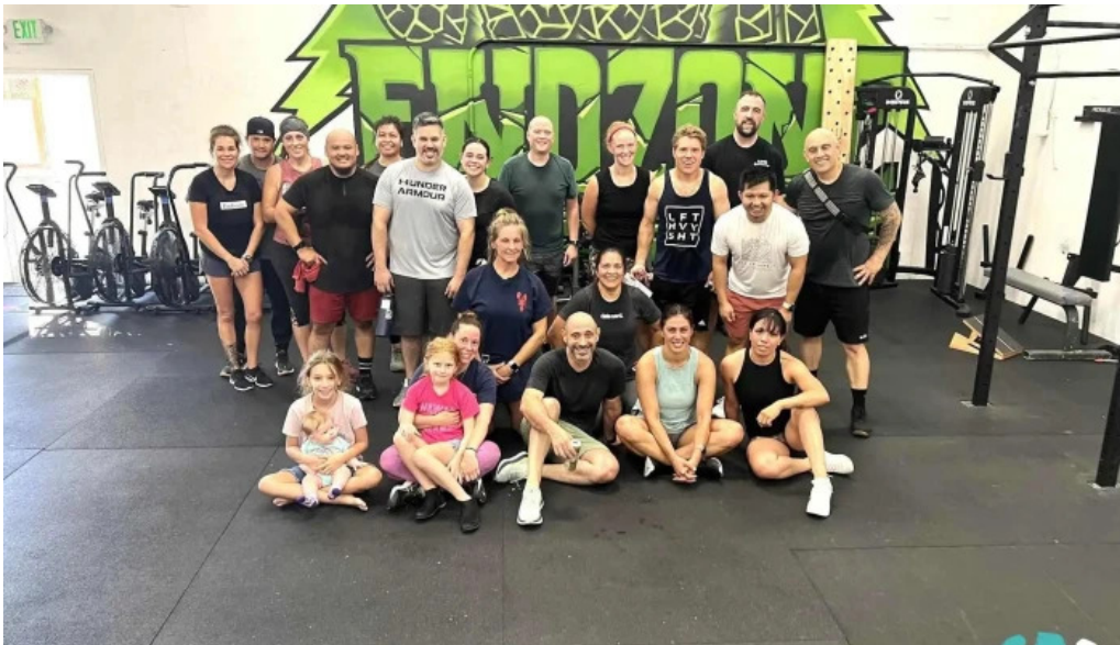
Crossfit endzone by owner