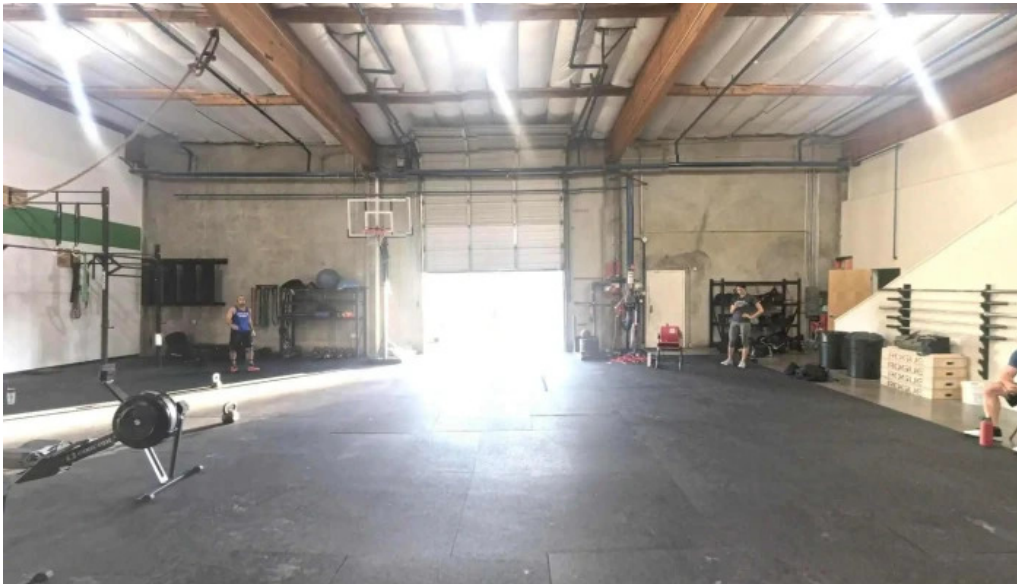
Crossfit endzone street view 360deg