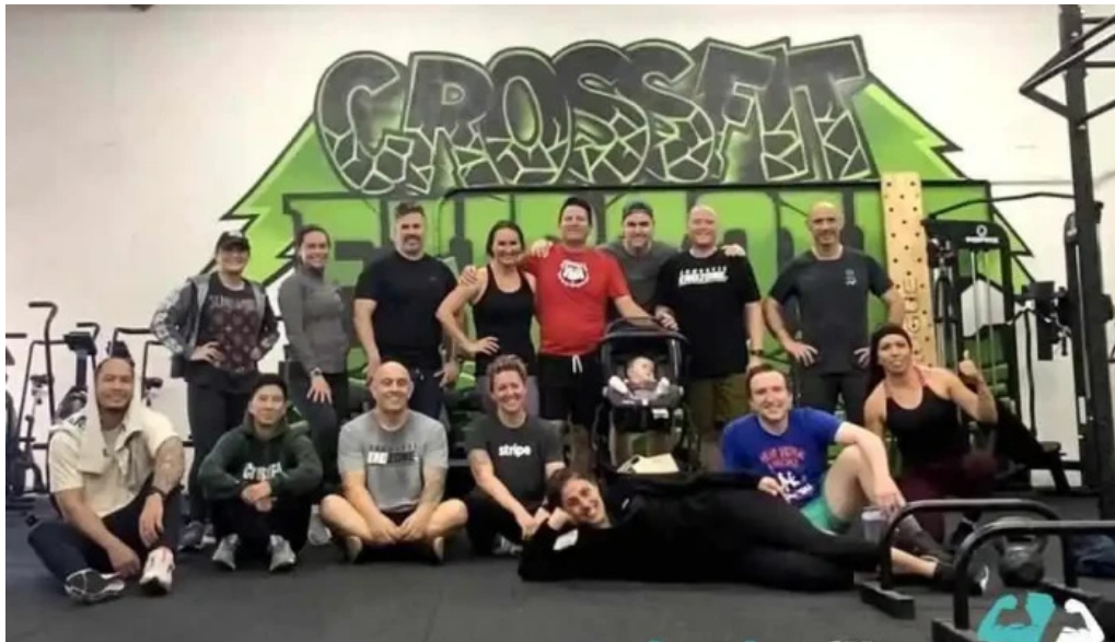
Crossfit endzone gym