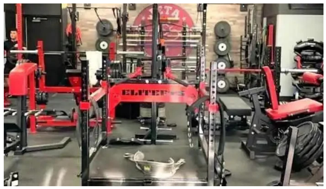
Jeta strength conditioning crown point