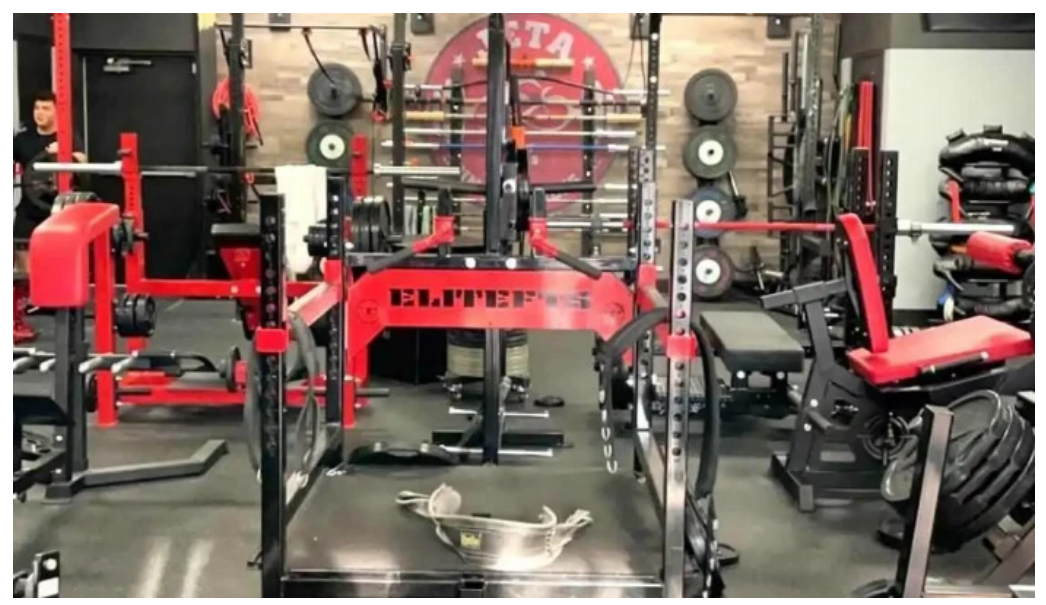
Jeta strength conditioning all