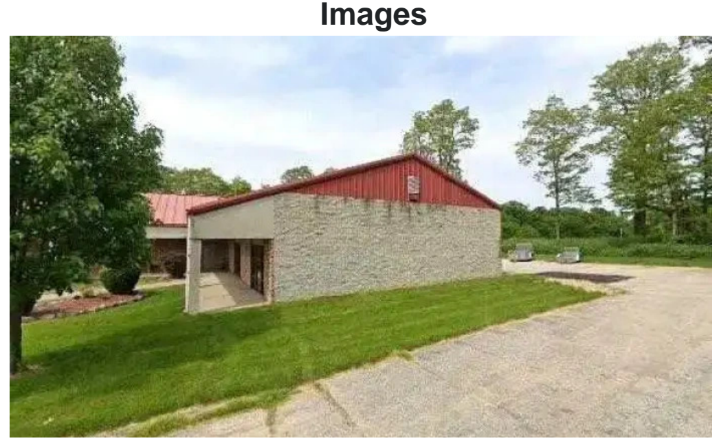
Jeta strength conditioning street view 360

If you require to adjust any detail that you believe is incorrect about this site, we urge you to send a message so that we will fix it at the earliest convenience. Thanks beforehand thank you very much.