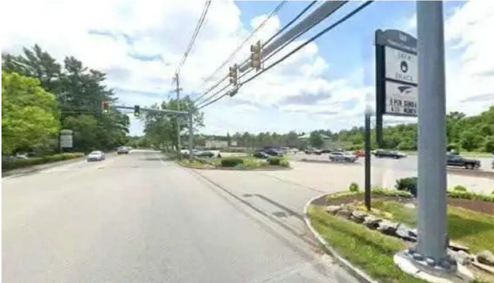
Dartmouth total fitness all