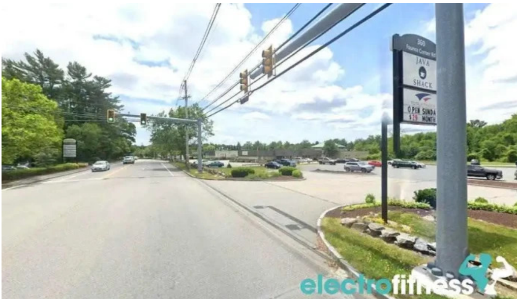
Dartmouth total fitness dartmouth