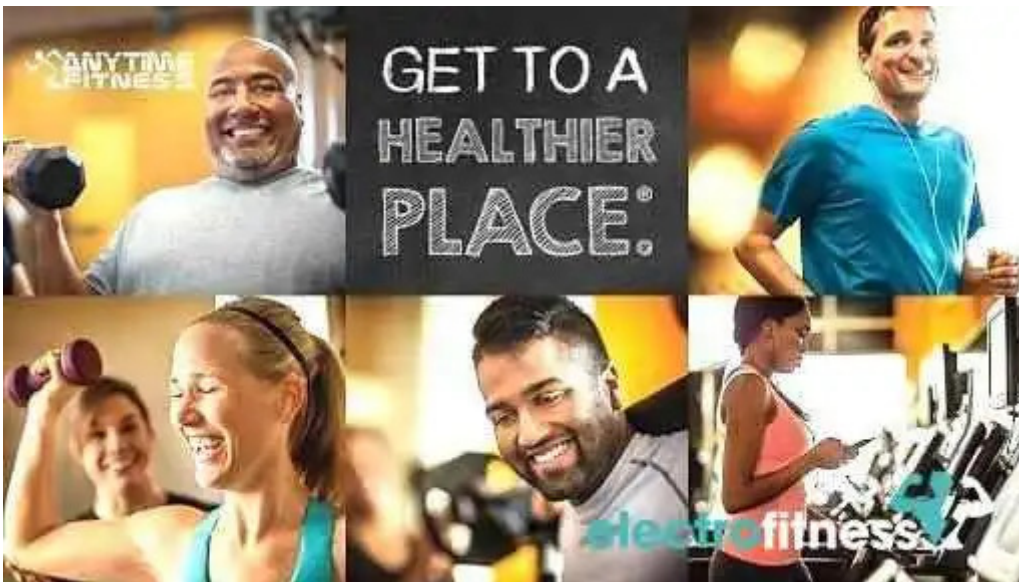
Anytime fitness by owner