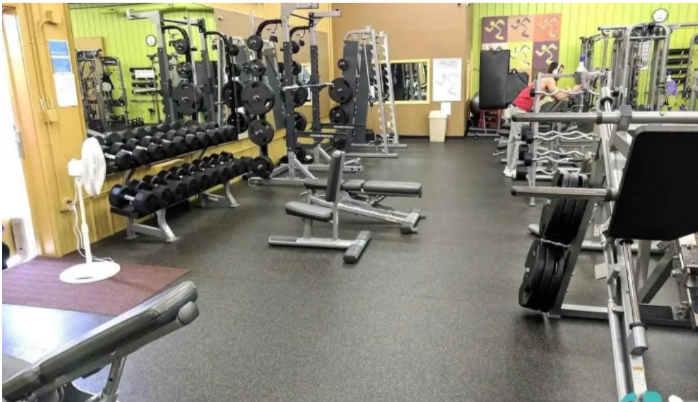
Anytime fitness de motte