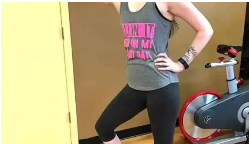
Anytime fitness gym