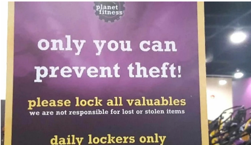
Planet fitness discounts