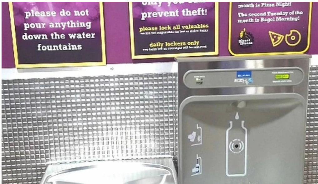
Planet fitness phone