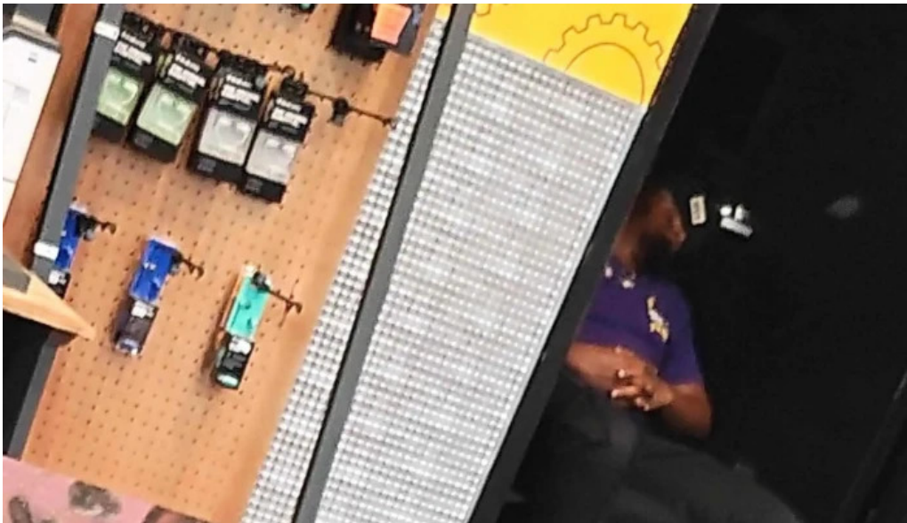
Planet fitness district heights