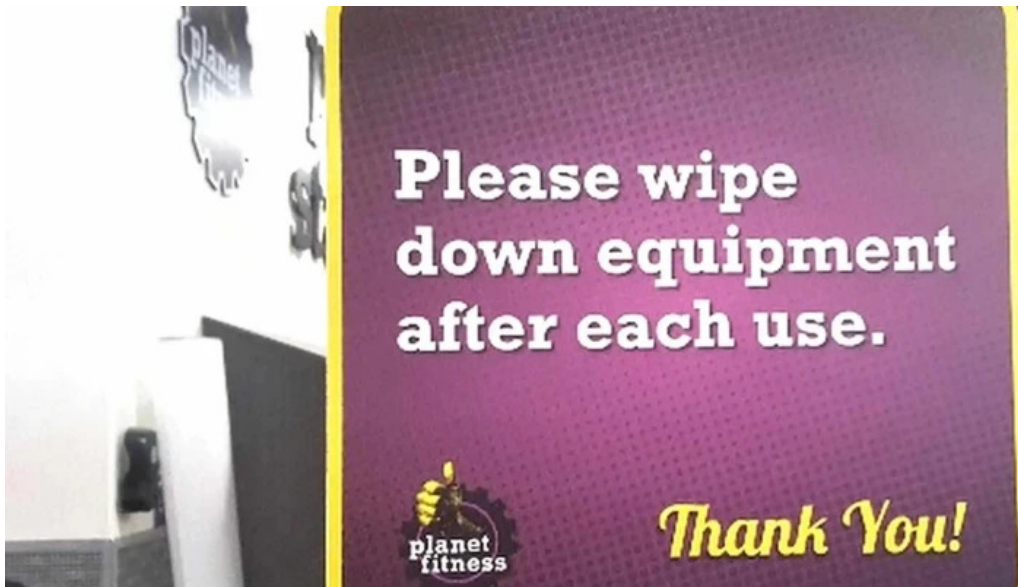
Planet fitness website