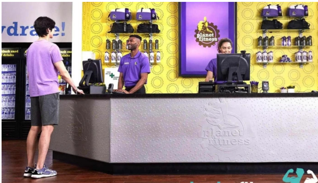
Planet fitness by owner