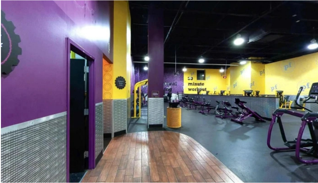
Planet fitness street view 360deg