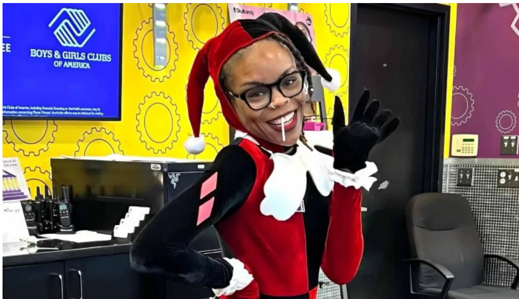
Planet fitness gym