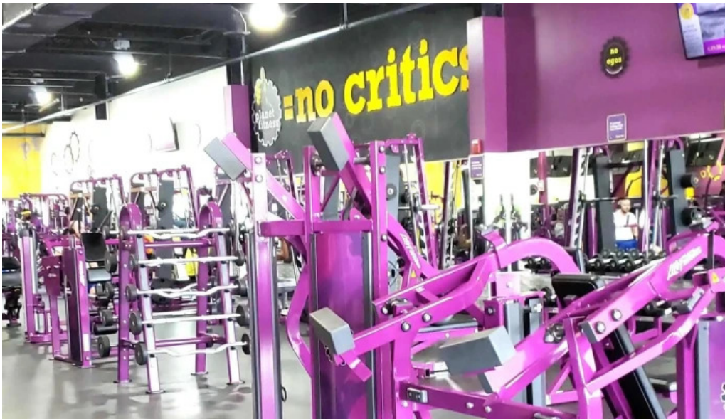
Planet fitness score