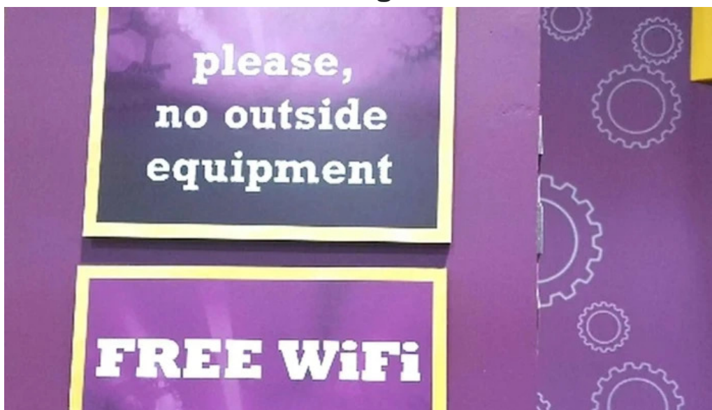
Planet fitness where