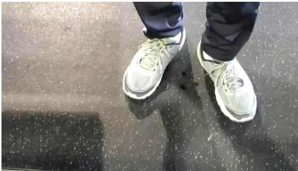
Planet fitness videos