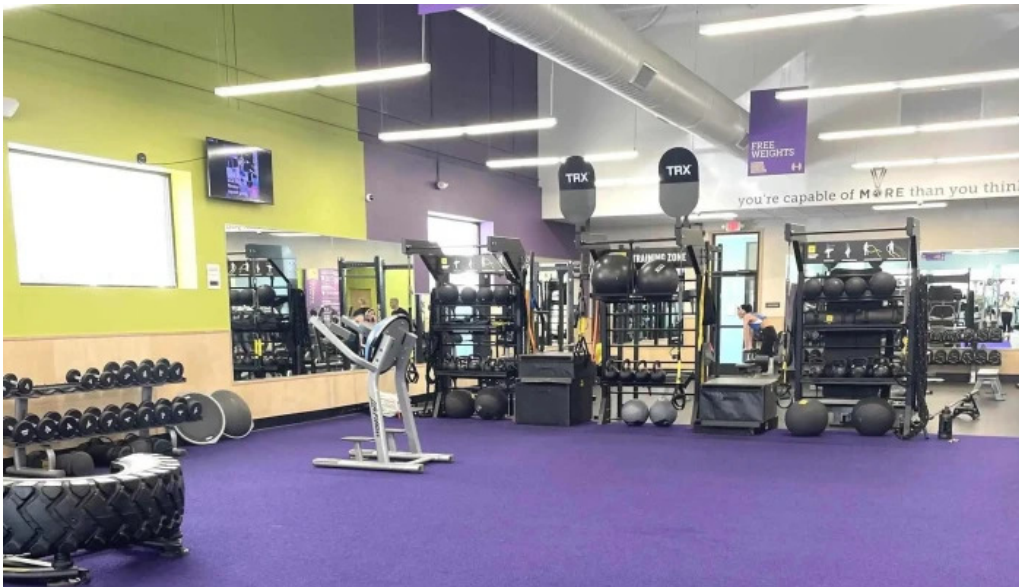
Anytime fitness reviews