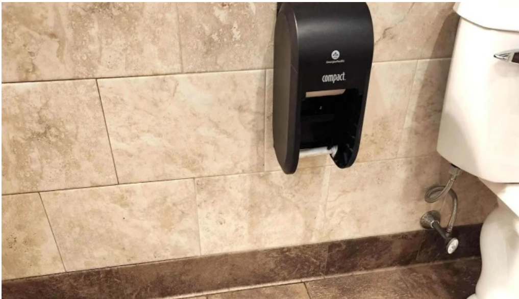
Anytime fitness address