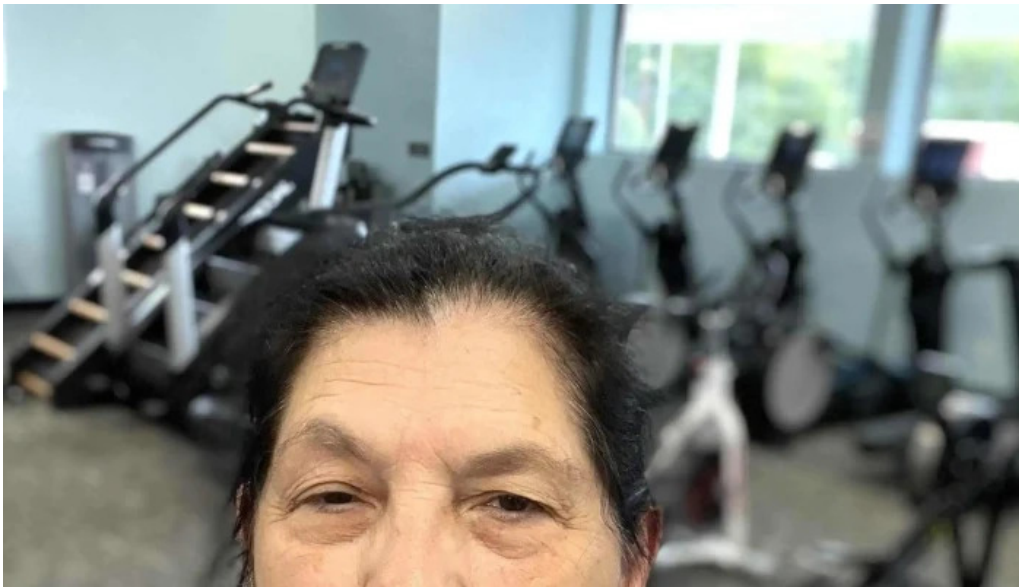
Anytime fitness east bridgewater