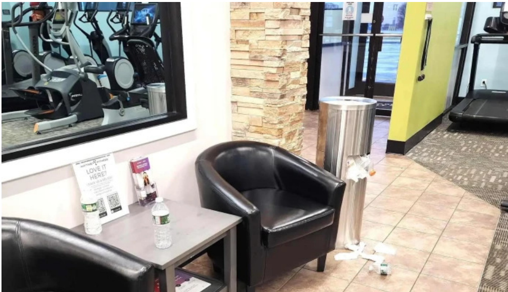
Anytime fitness catalog