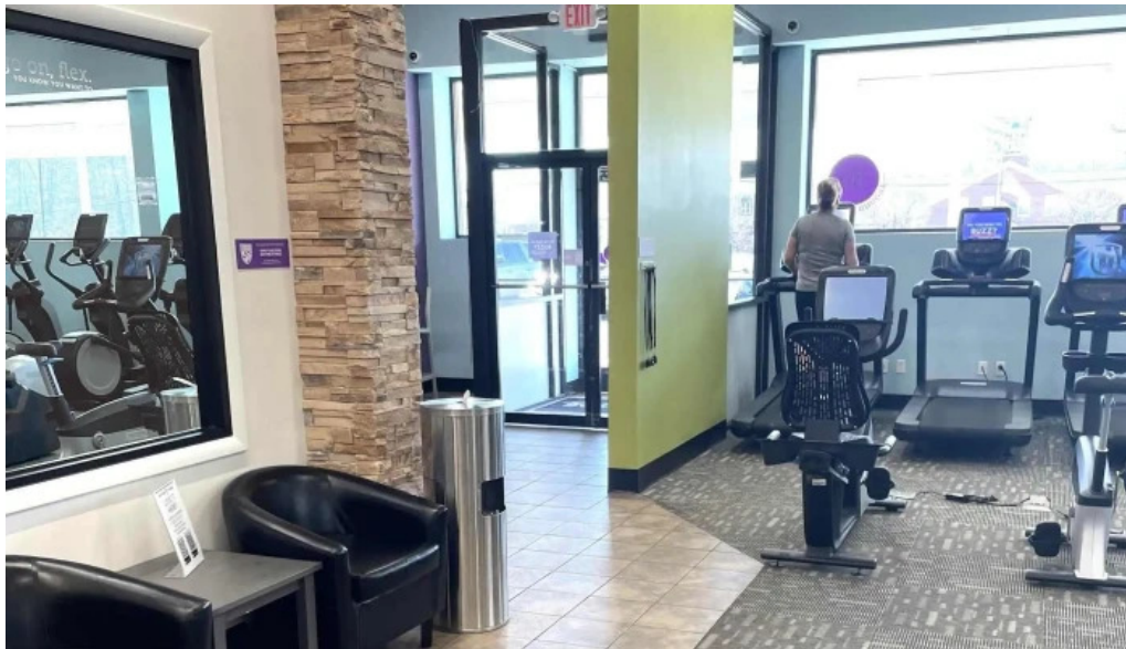
Anytime fitness location