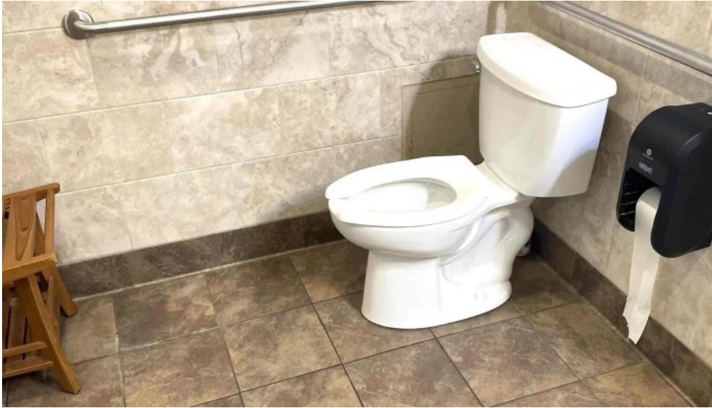
Anytime fitness website