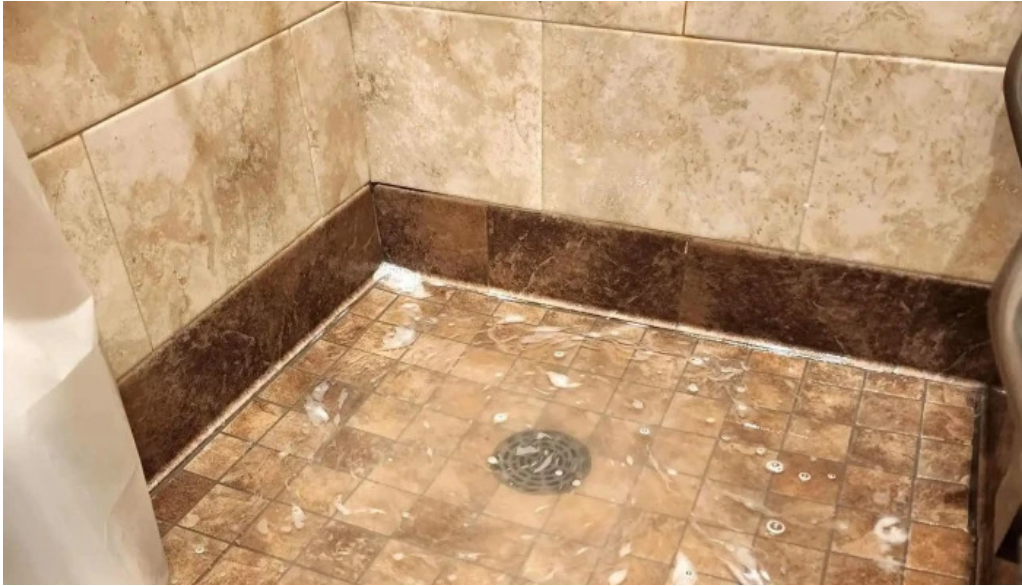
Anytime fitness score