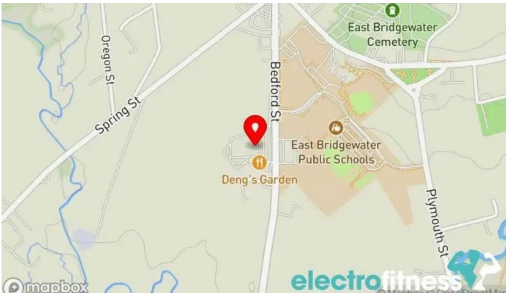
Anytime fitness map