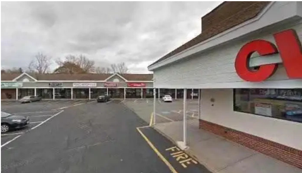
Anytime fitness street view 360deg