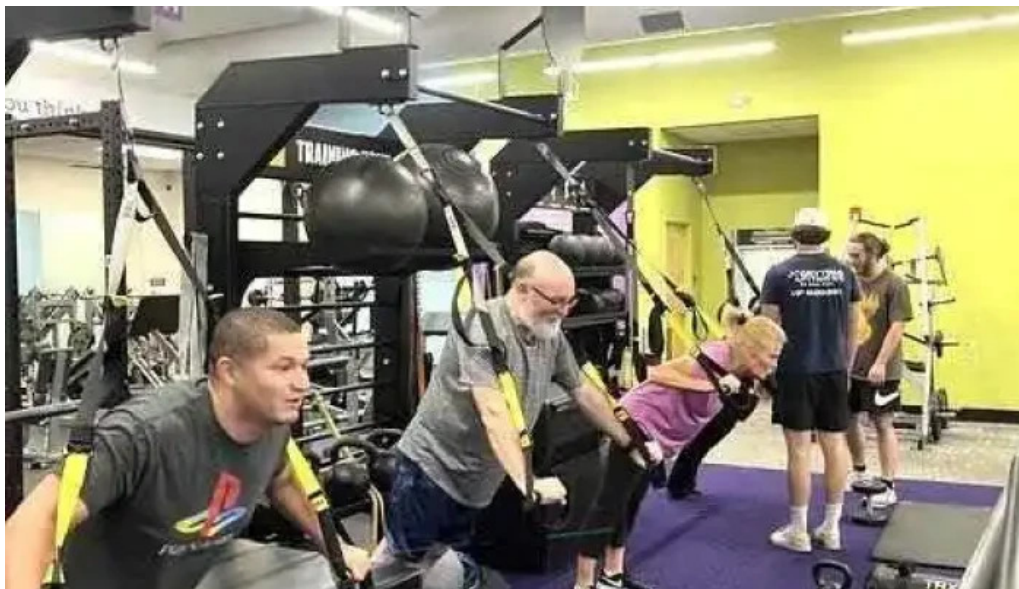
Anytime fitness all