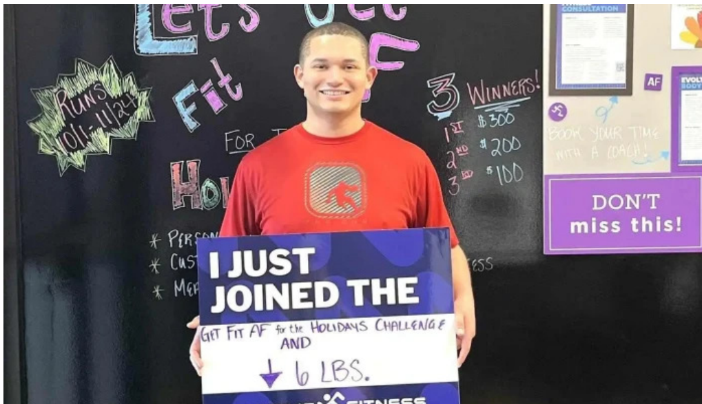
Anytime fitness by owner