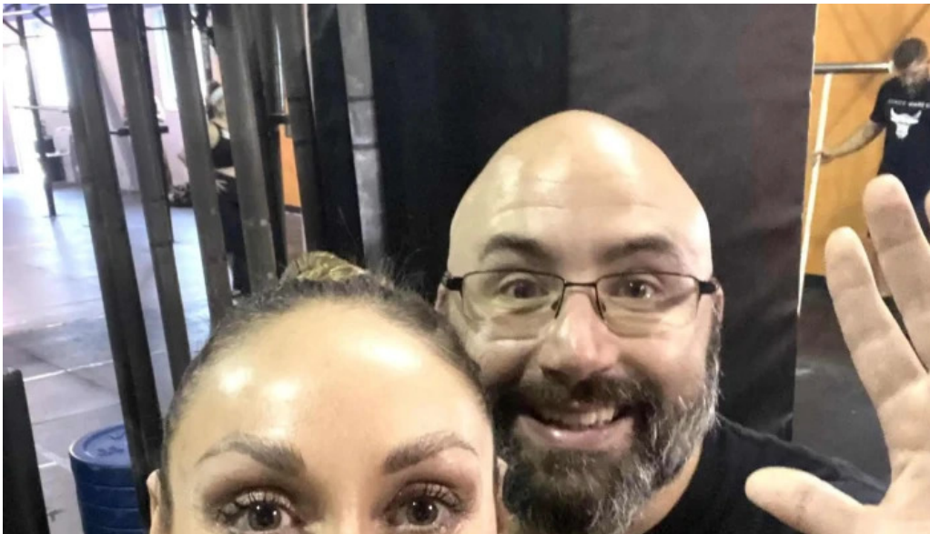
Crossfit east providence phone