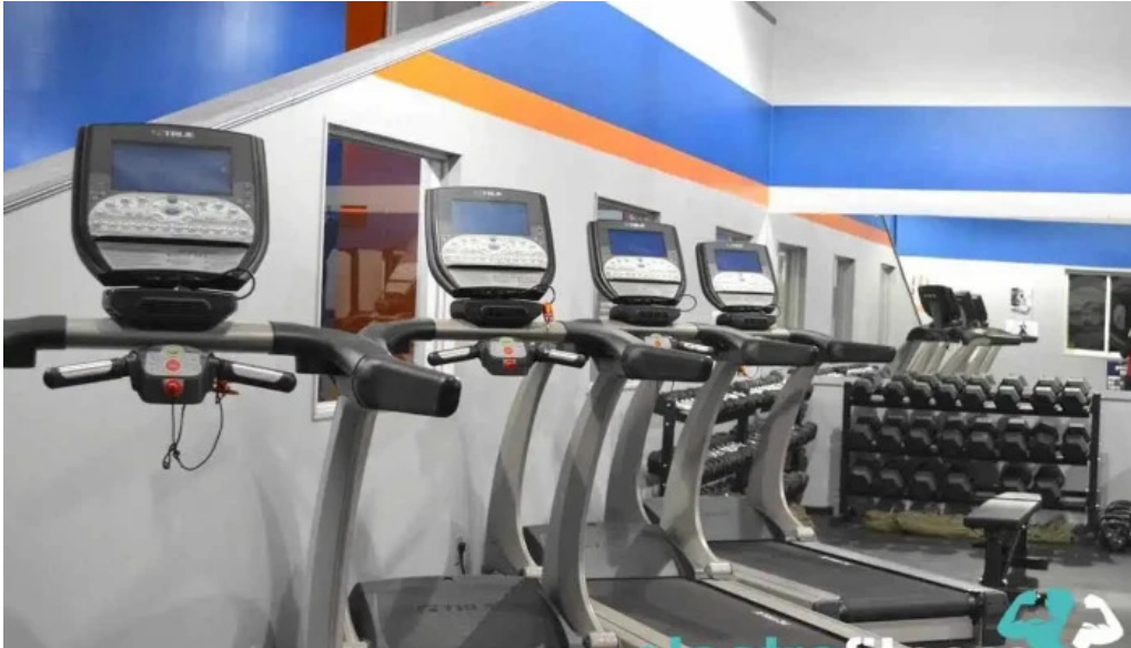
Crossfit east providence by owner