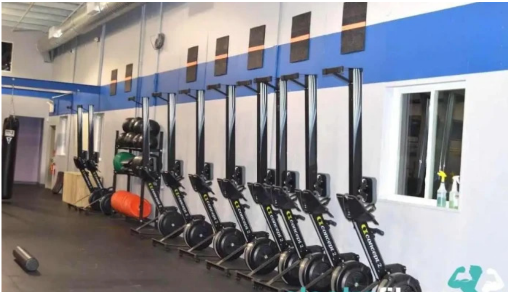
Crossfit east providence all