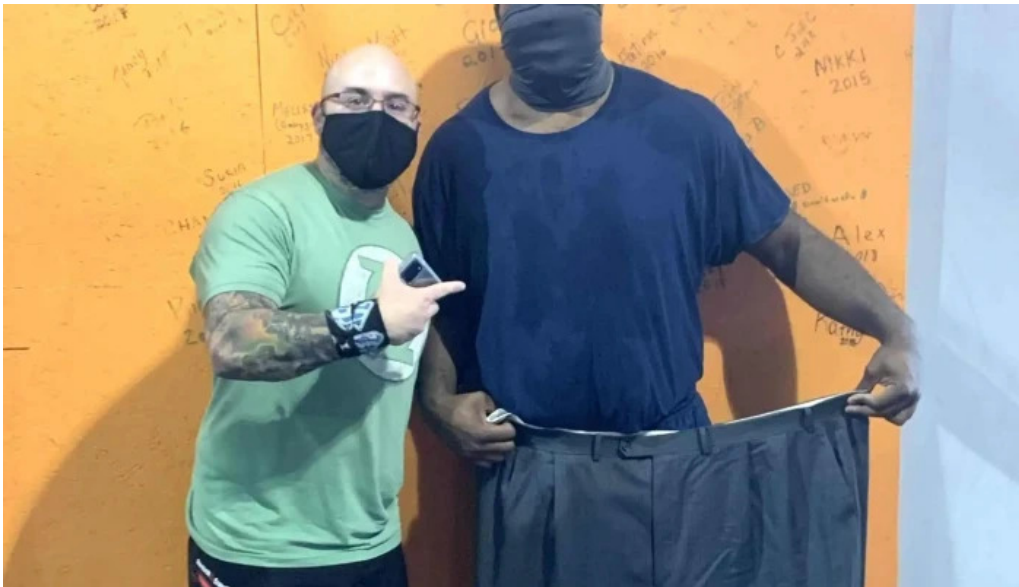
Crossfit east providence gym