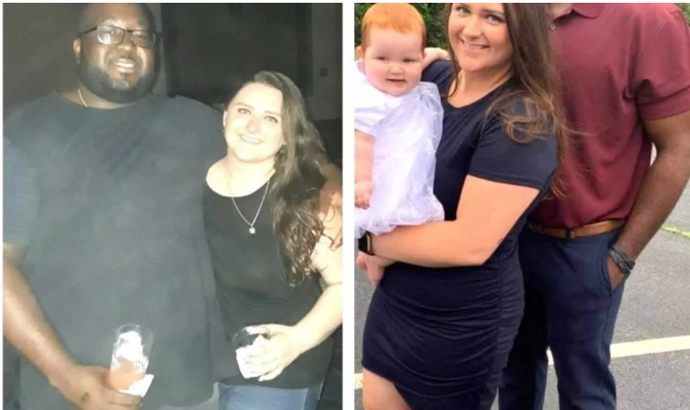
Crossfit east providence east providence