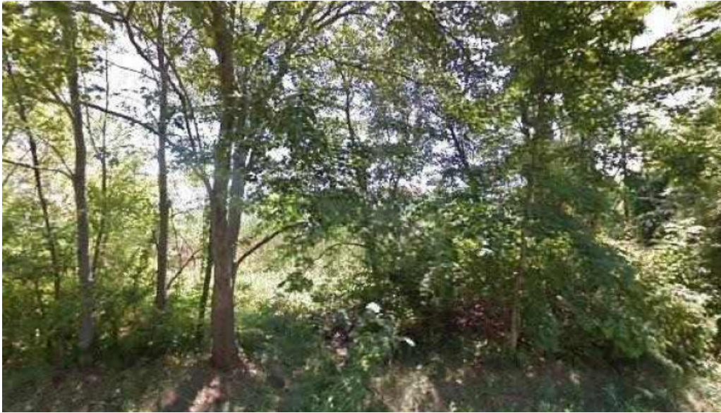
Crossfit east providence street view 360deg