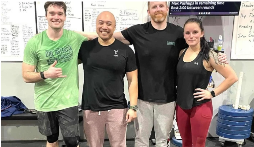
Crossfit east providence how to get there