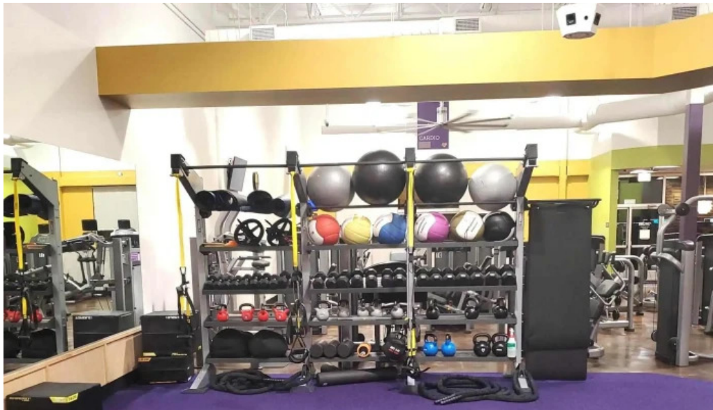
Anytime fitness number