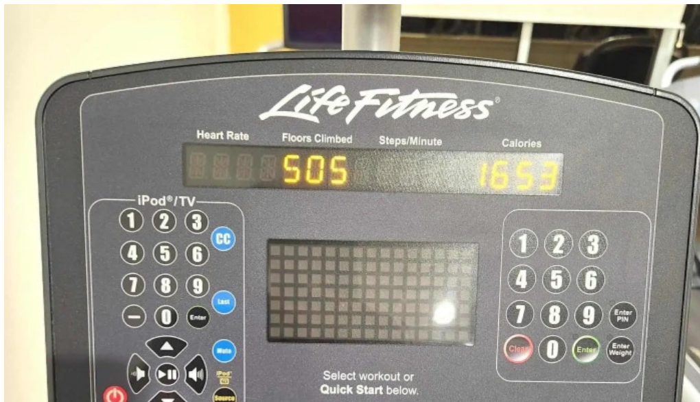
Anytime fitness schedule