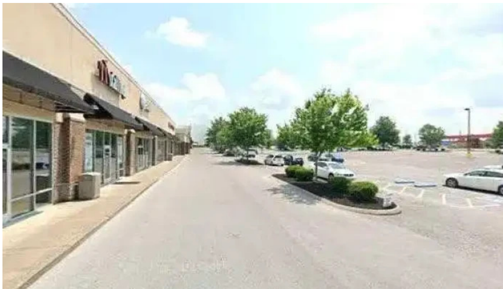
Anytime fitness street view 360deg