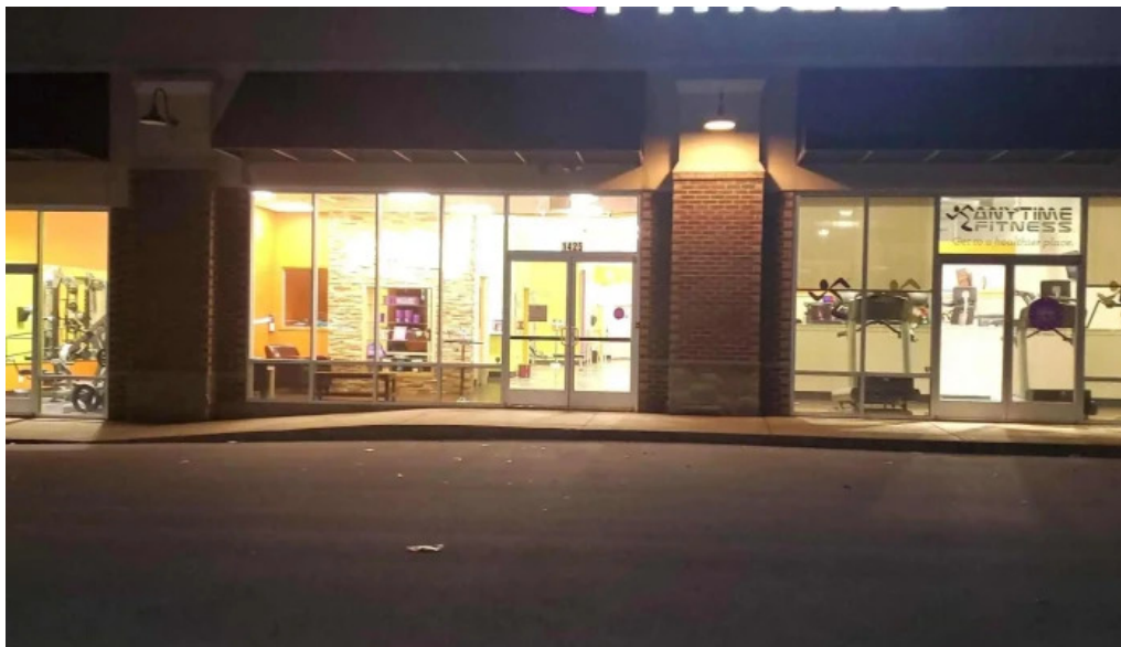
Anytime fitness gym