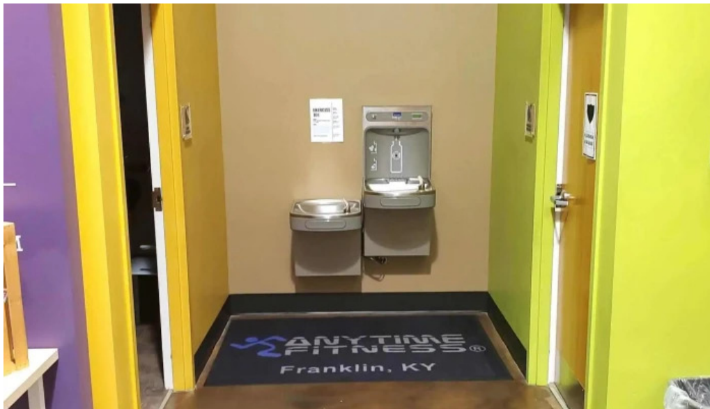
Anytime fitness website