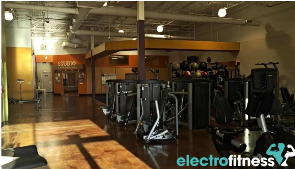
Anytime fitness videos