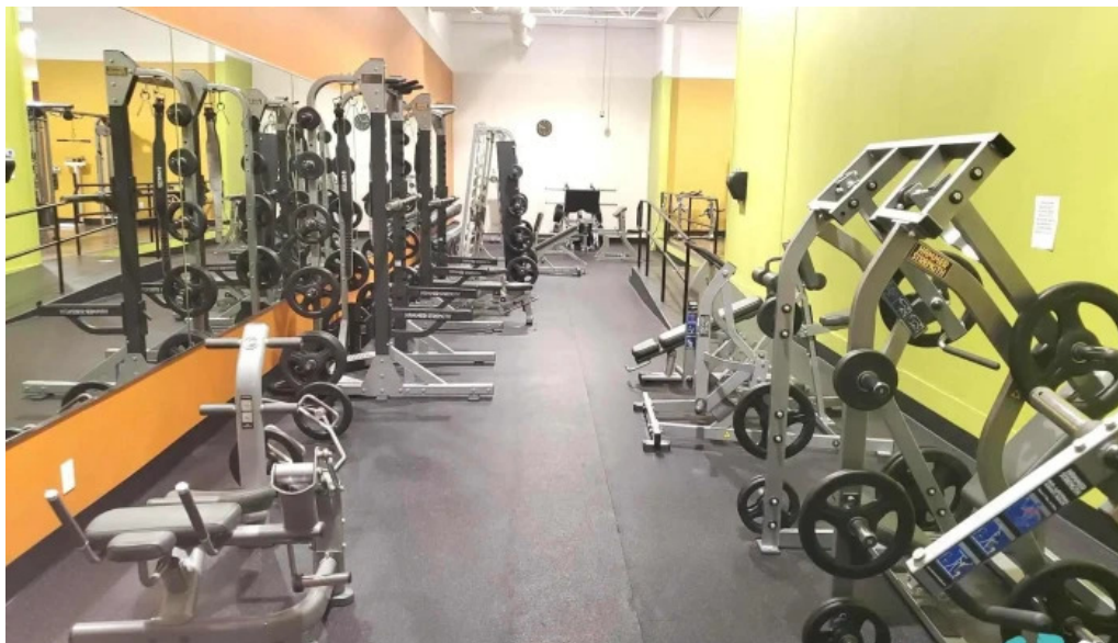
Anytime fitness all