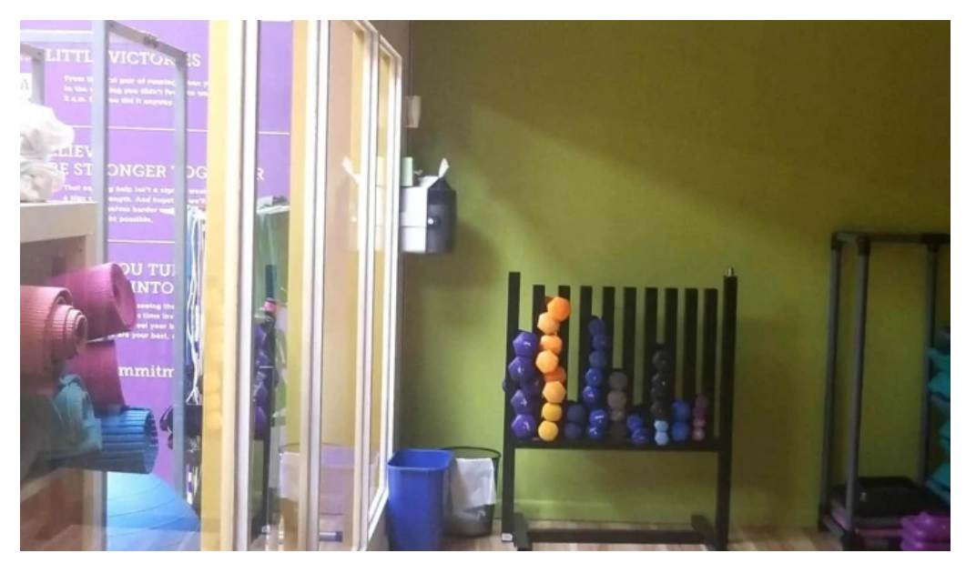
Anytime fitness schedule