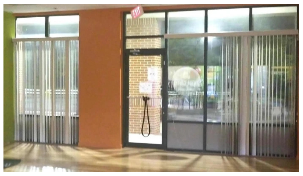
Anytime fitness photos