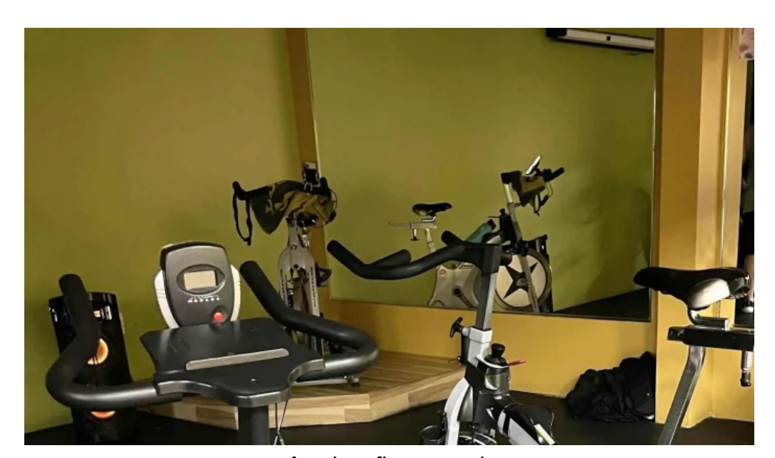
Anytime fitness reviews