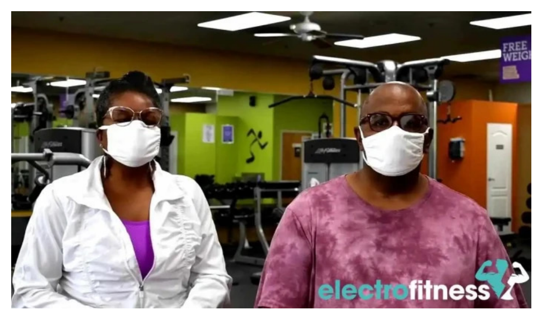
Anytime fitness videos