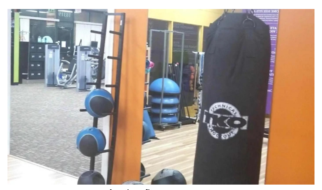
Anytime fitness germantown