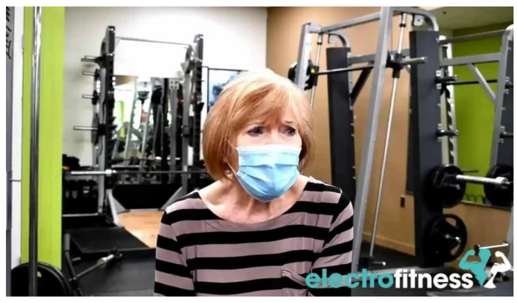
Anytime fitness by owner