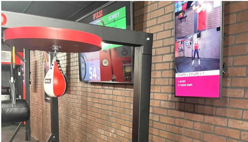
Ground kickboxing fitness gym