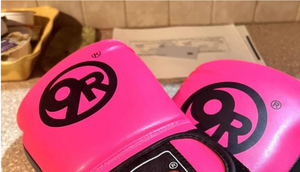
Ground kickboxing fitness greenwood village