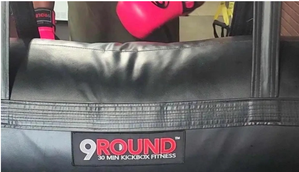
9round kickboxing fitness videos