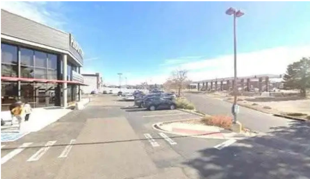
9round kickboxing fitness street view 360deg