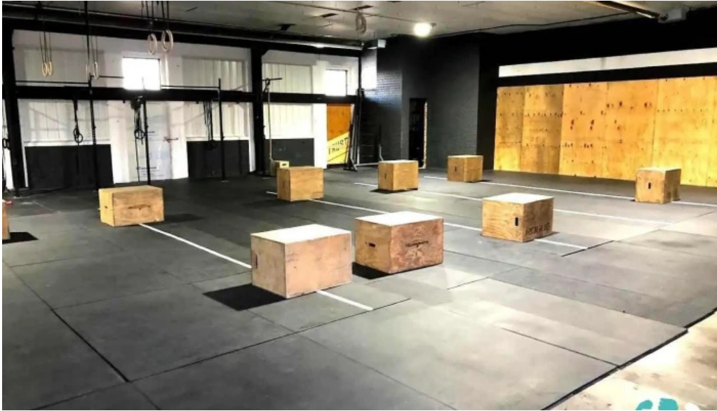
Crossfit resound hastings