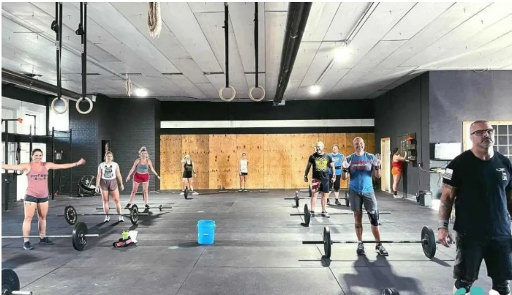
Crossfit resound gym