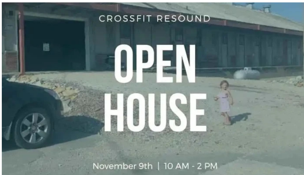
Crossfit resound by owner