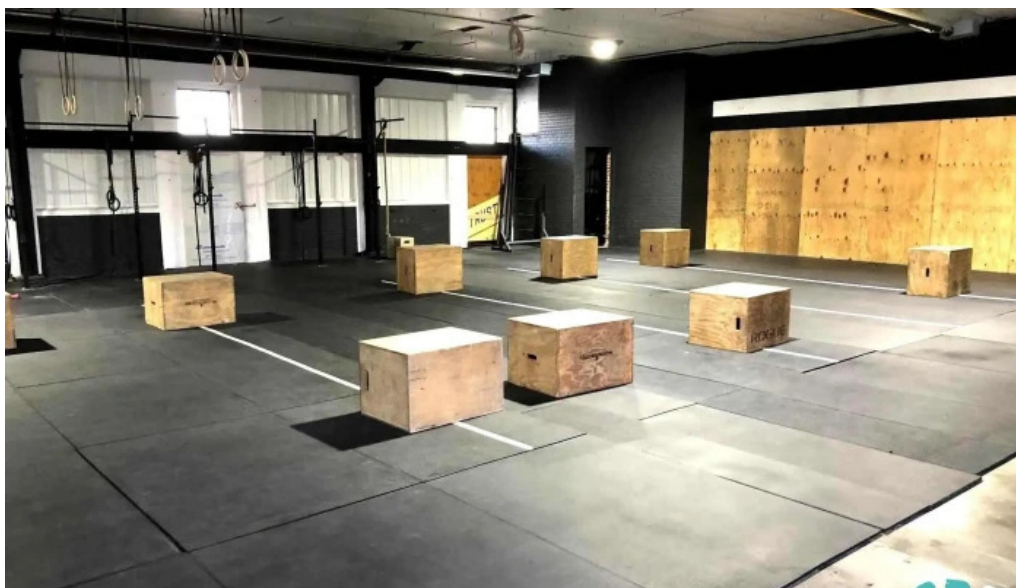
Crossfit resound all