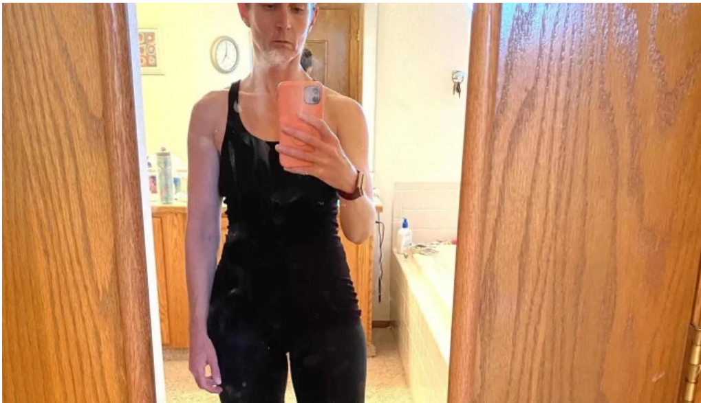
Beyond fitness and performance gym