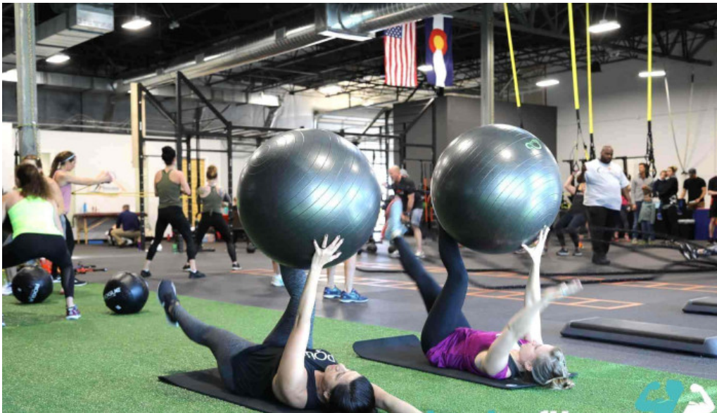
Beyond fitness and performance all