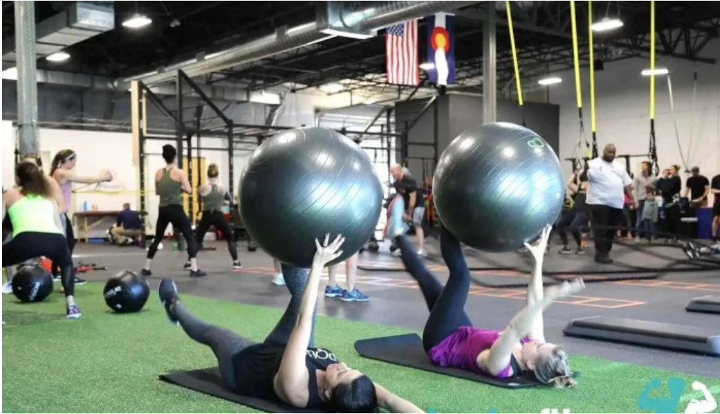
Beyond fitness and performance highlands ranch