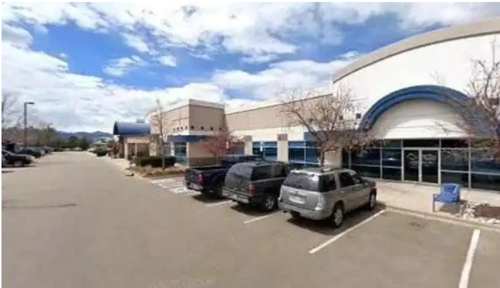
Beyond fitness and performance street view 360deg