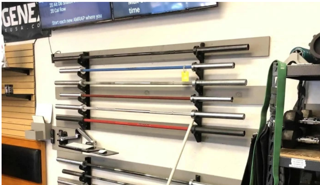
Crossfit modig catalog