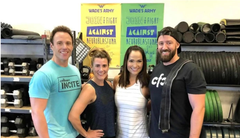
Crossfit modig gym