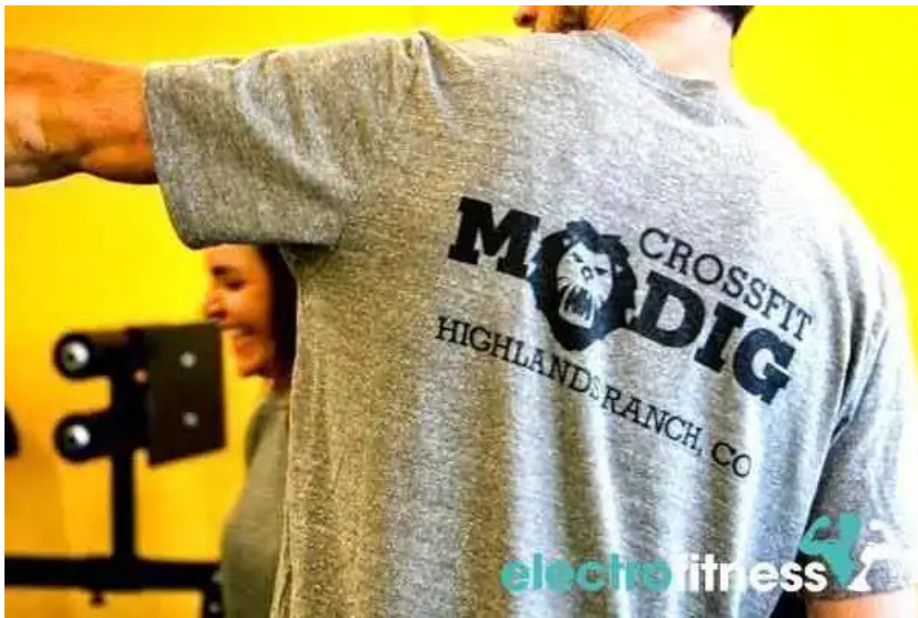
Crossfit modig by owner