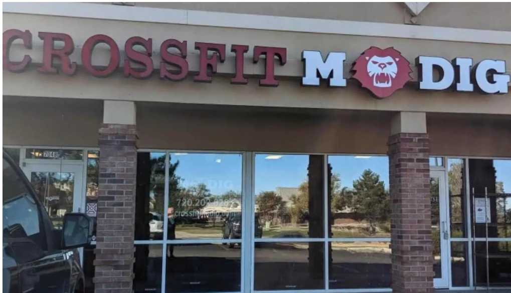
Crossfit modig all