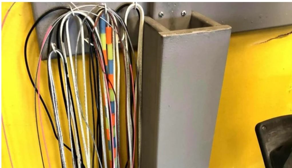
Crossfit modig highlands ranch