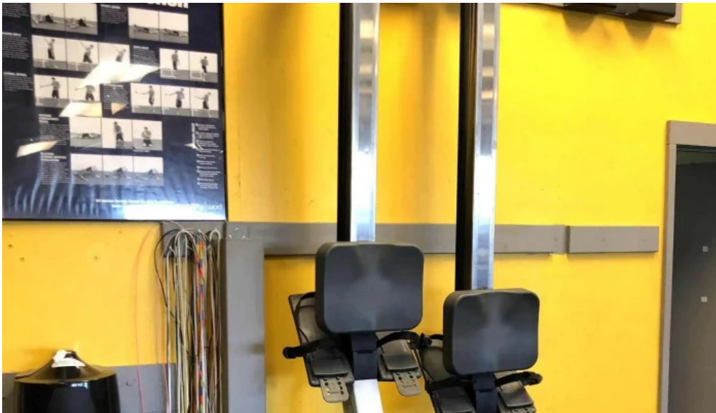
Crossfit modig comments