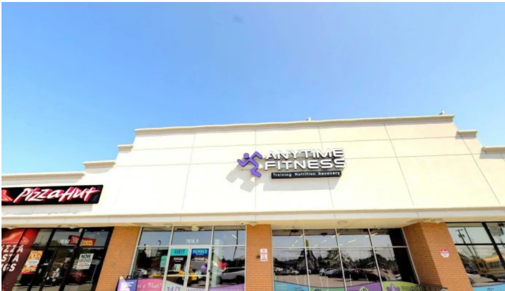
Anytime fitness street view 360