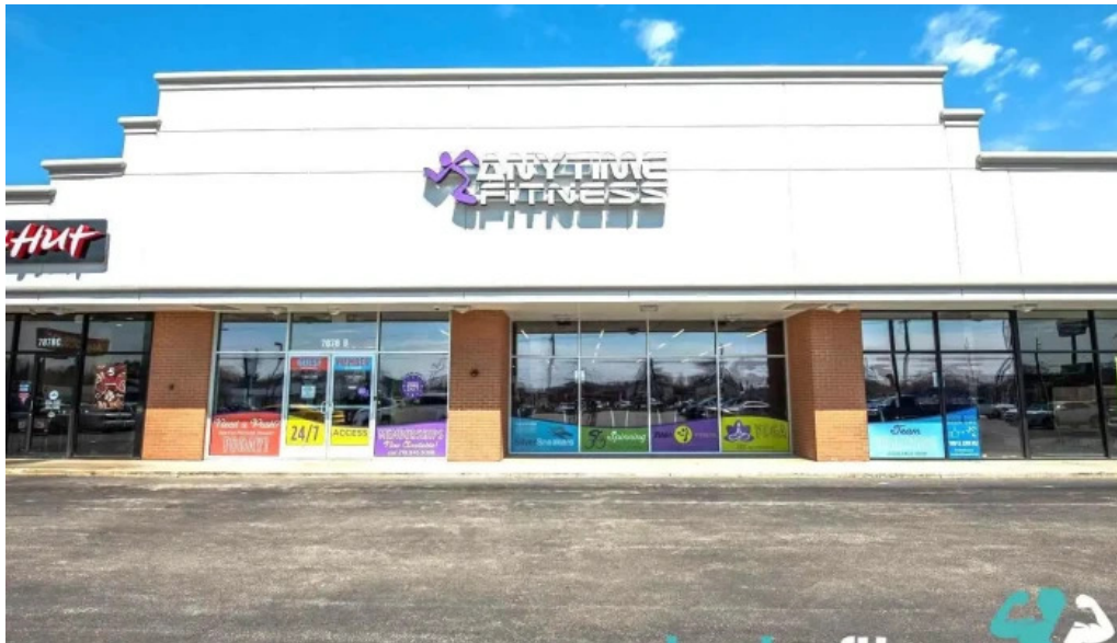
Anytime fitness hobart