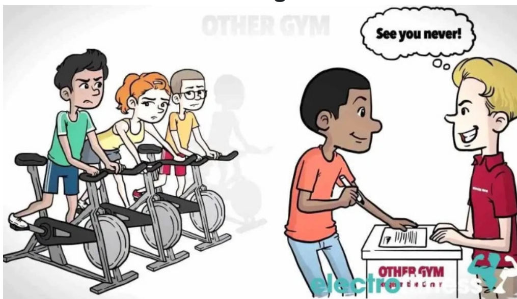
Anytime fitness videos