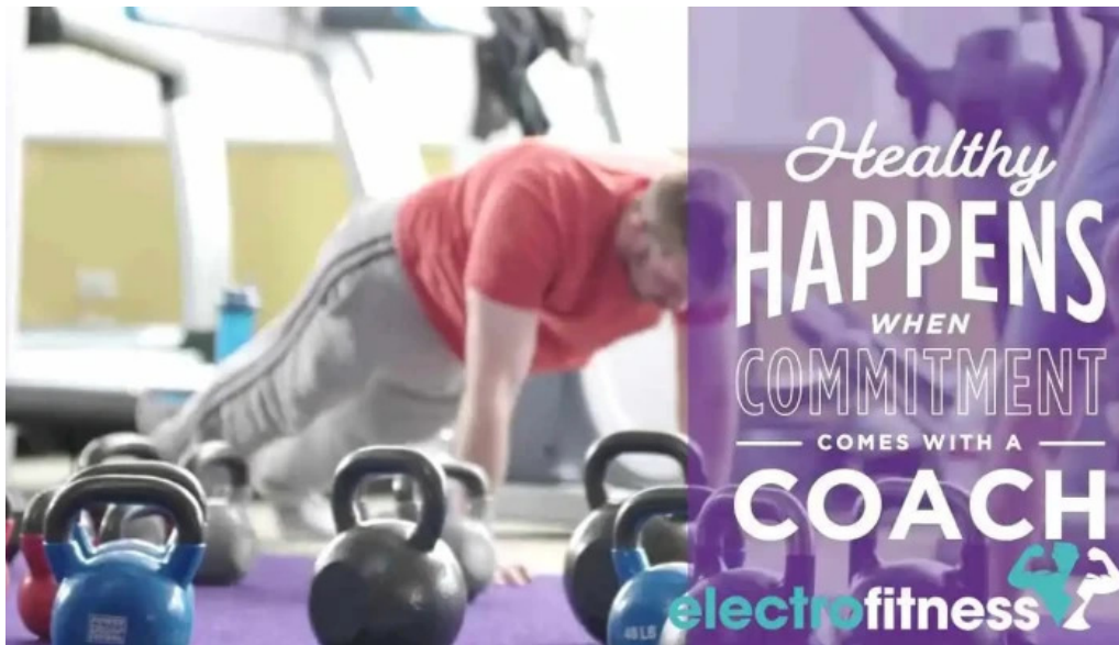
Anytime fitness by owner