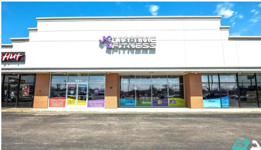
Anytime fitness all