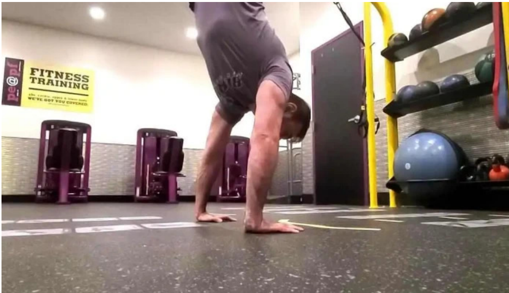
Planet fitness gym