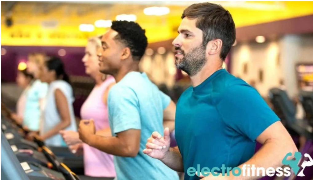
Planet fitness hobart