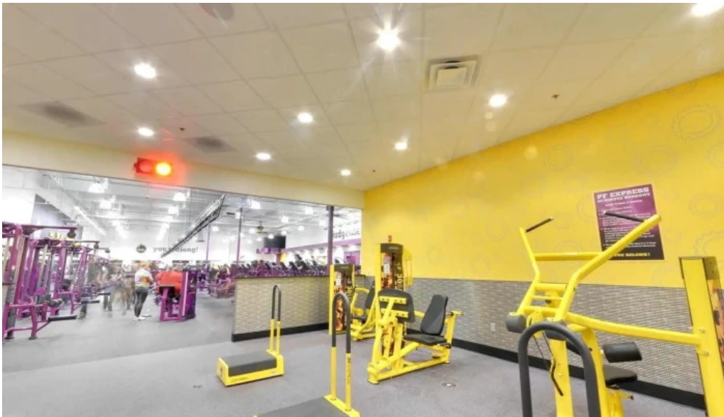
Planet fitness street view 360