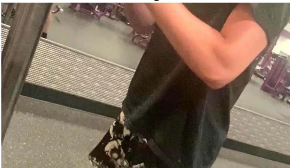
Planet fitness videos