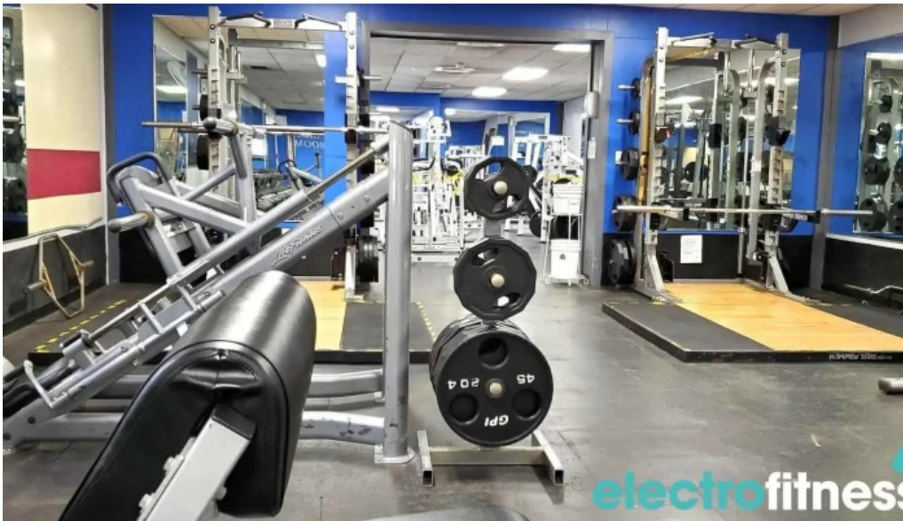
Indian head weight house fitness center exercise machine