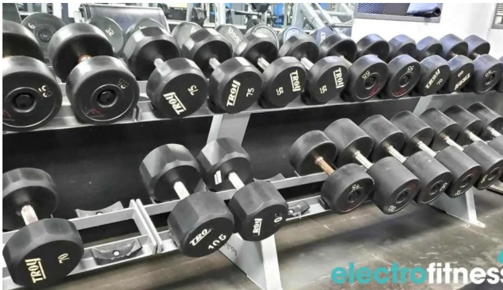
Indian head weight house fitness center indian head