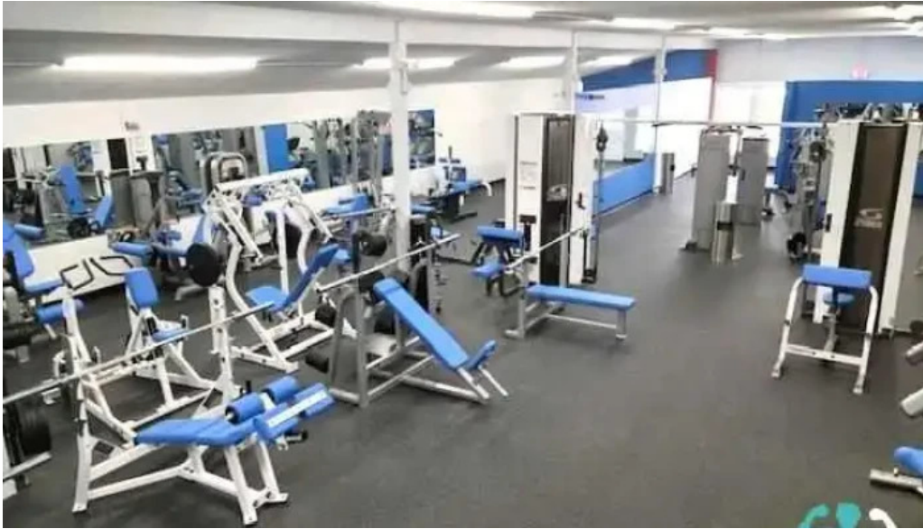
Muscle house and fitness indian head