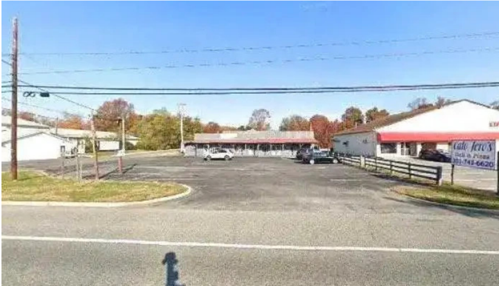
Muscle house and fitness street view 360deg