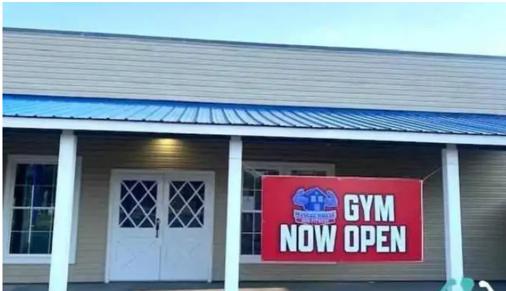
Muscle house and fitness by owner