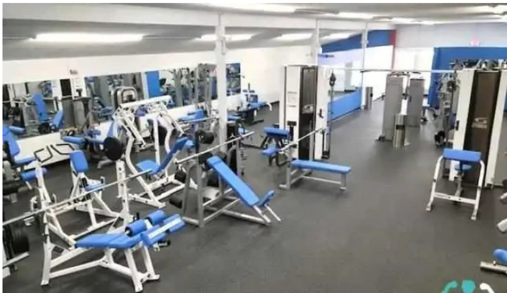
Muscle house and fitness all