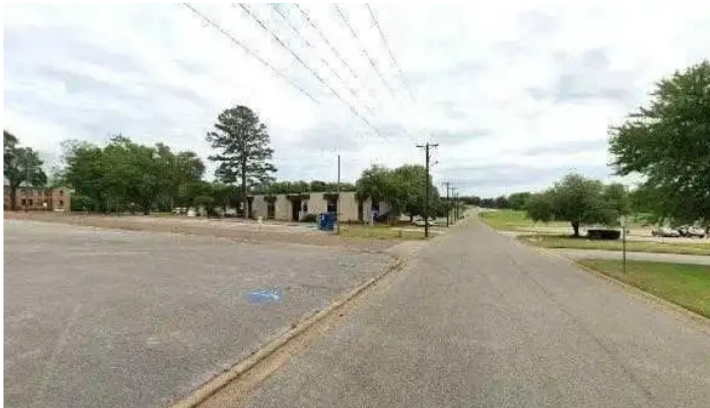
Jacksonville isd john alexander gym street view 360deg