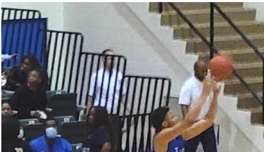
Jacksonville isd john alexander gym gym