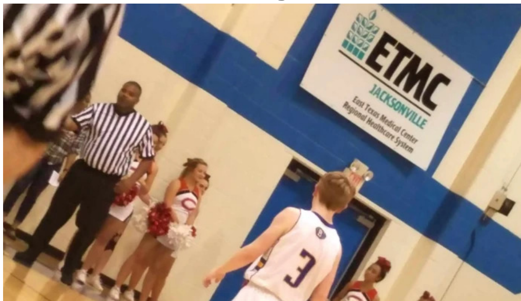
Jacksonville isd john alexander gym website