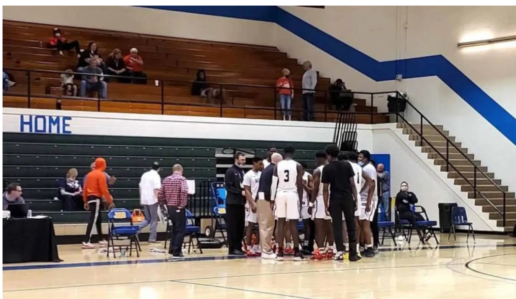
Jacksonville isd john alexander gym all