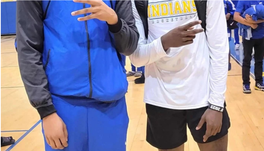
Jacksonville isd john alexander gym jacksonville