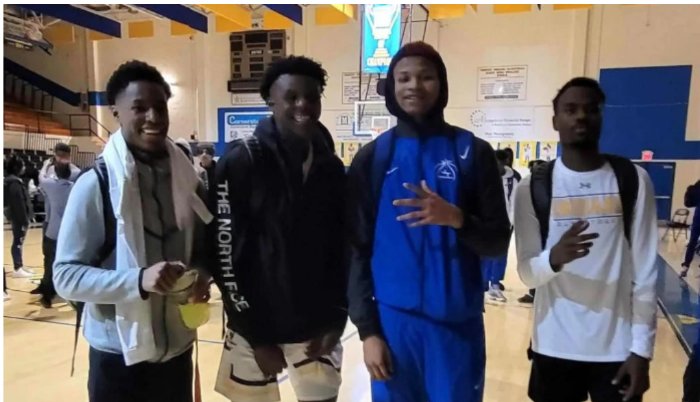
Jacksonville isd john alexander gym schedule