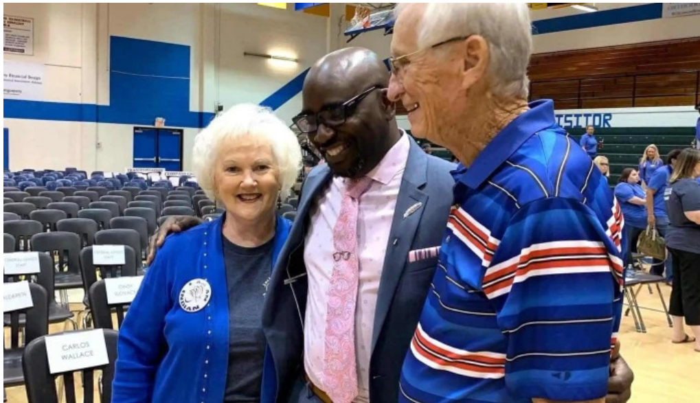
Jacksonville isd john alexander gym photos