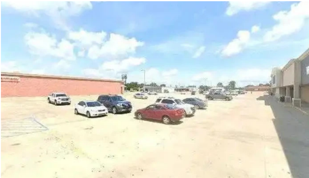
Anytime fitness street view 360deg