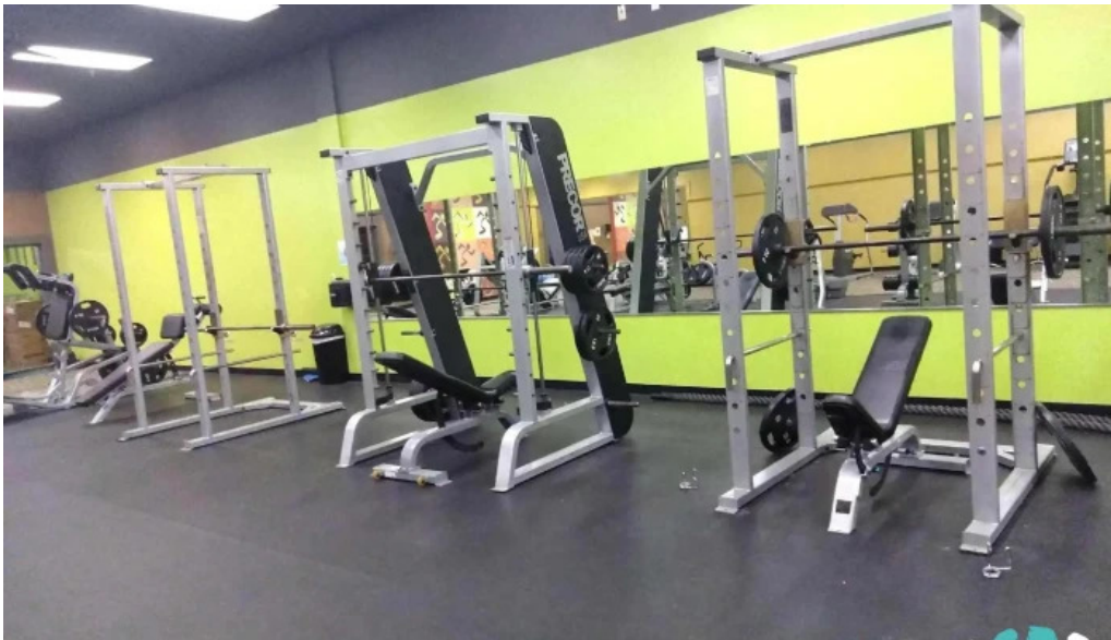
Anytime fitness exercise machine