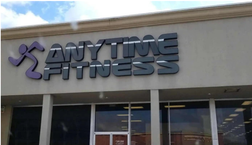
Anytime fitness discounts