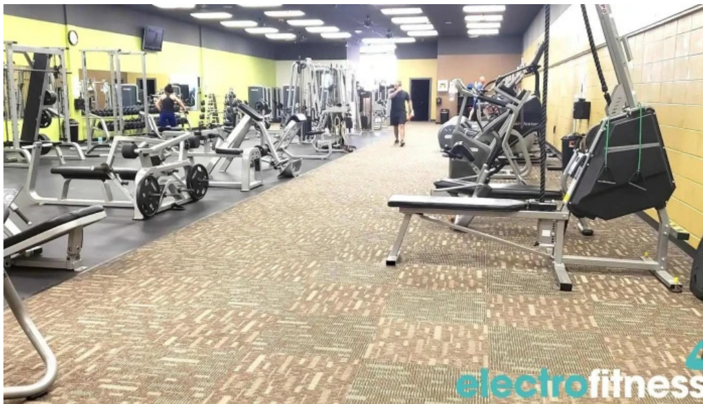
Anytime fitness all