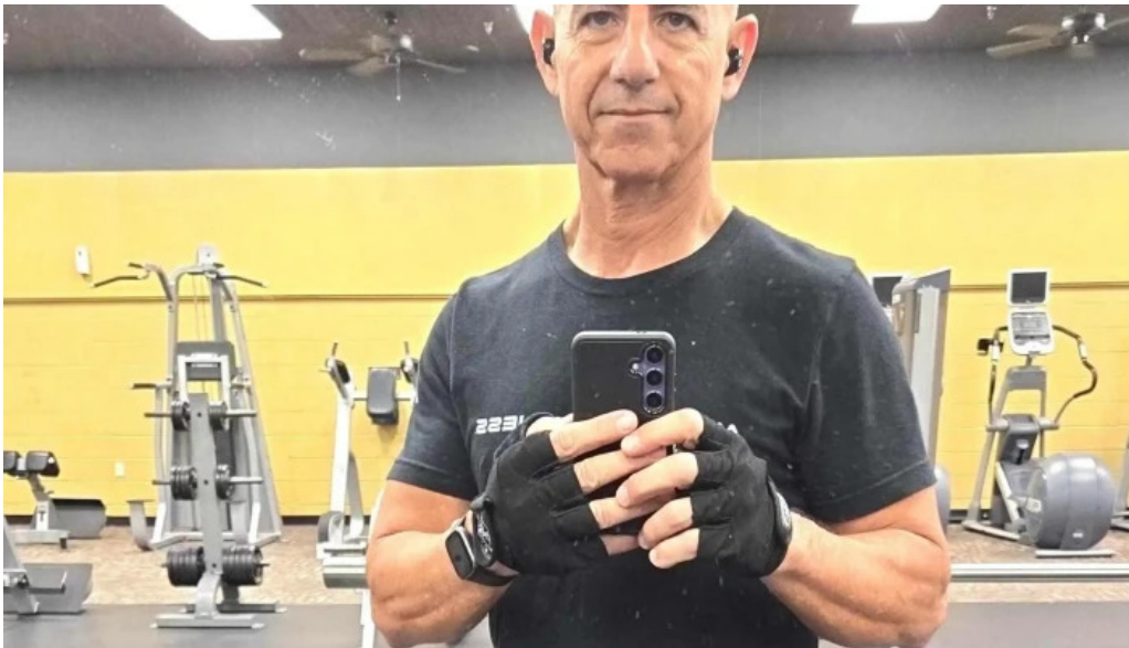
Anytime fitness jennings