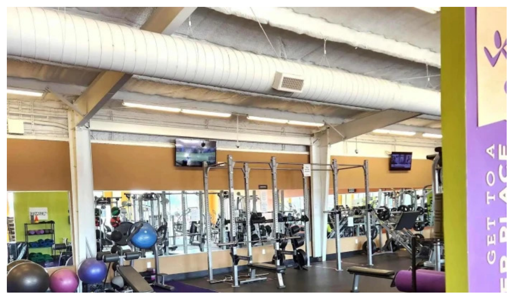
Anytime fitness gym