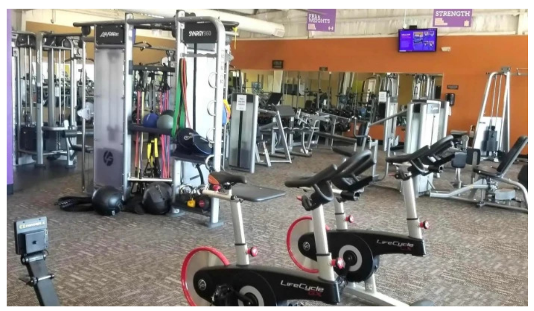
Anytime fitness location