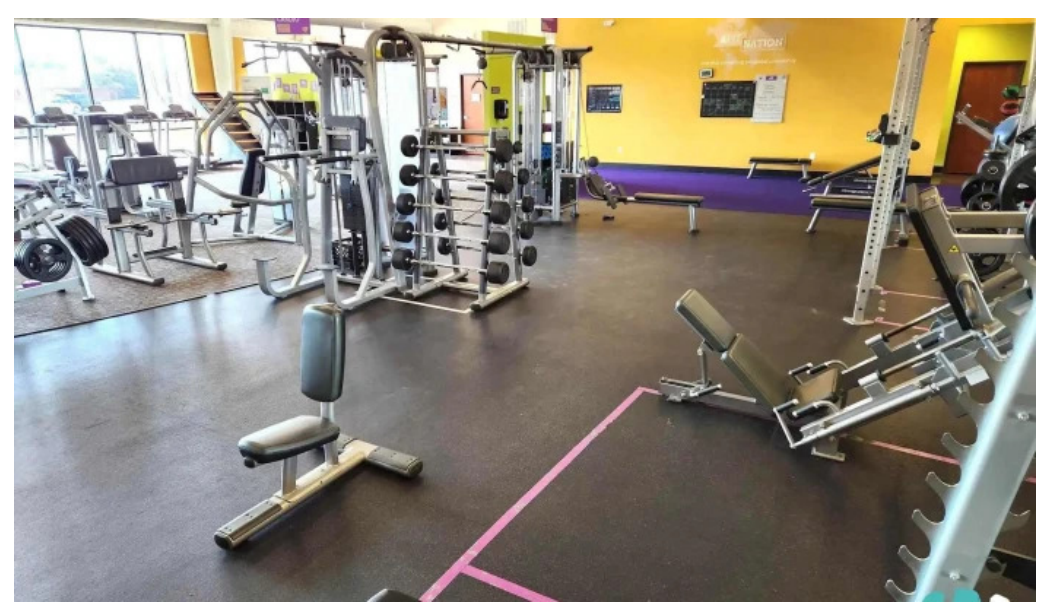
Anytime fitness all