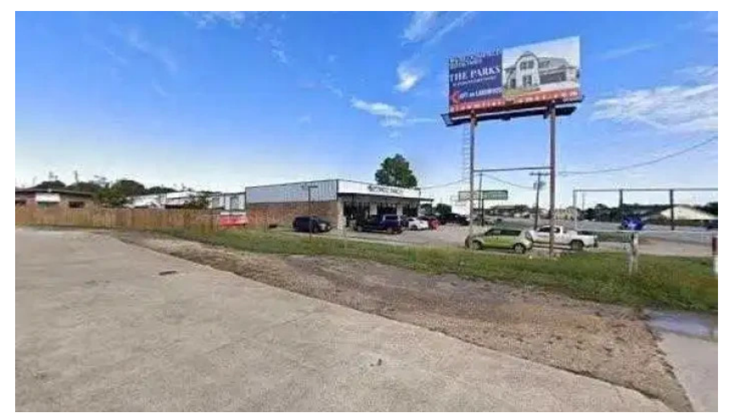
Anytime fitness street view 360deg