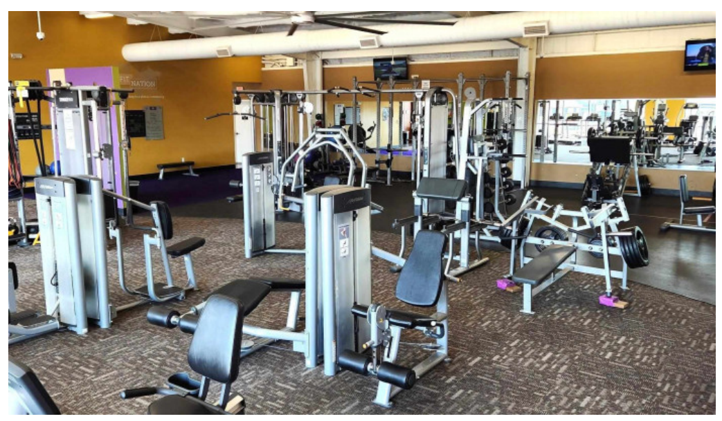
Anytime fitness promotion