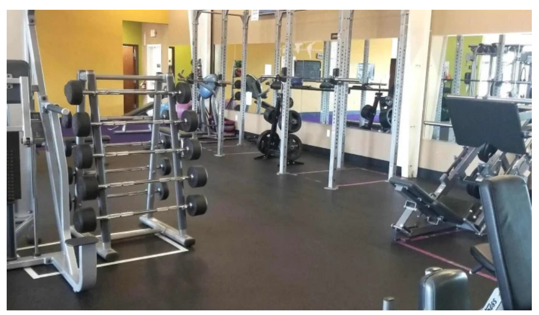
Anytime fitness catalog