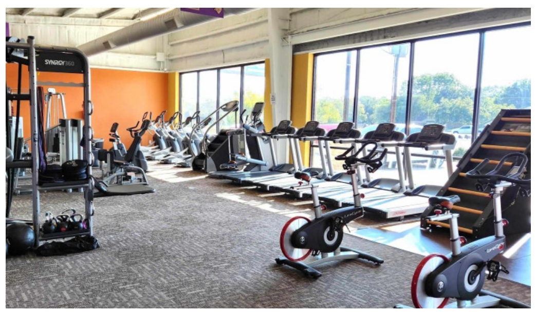
Anytime fitness joshua