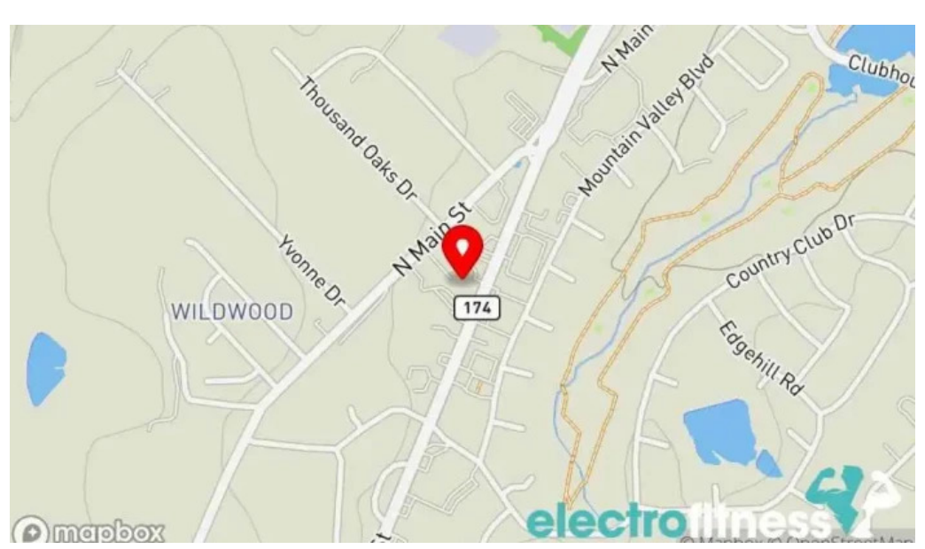
Anytime fitness map