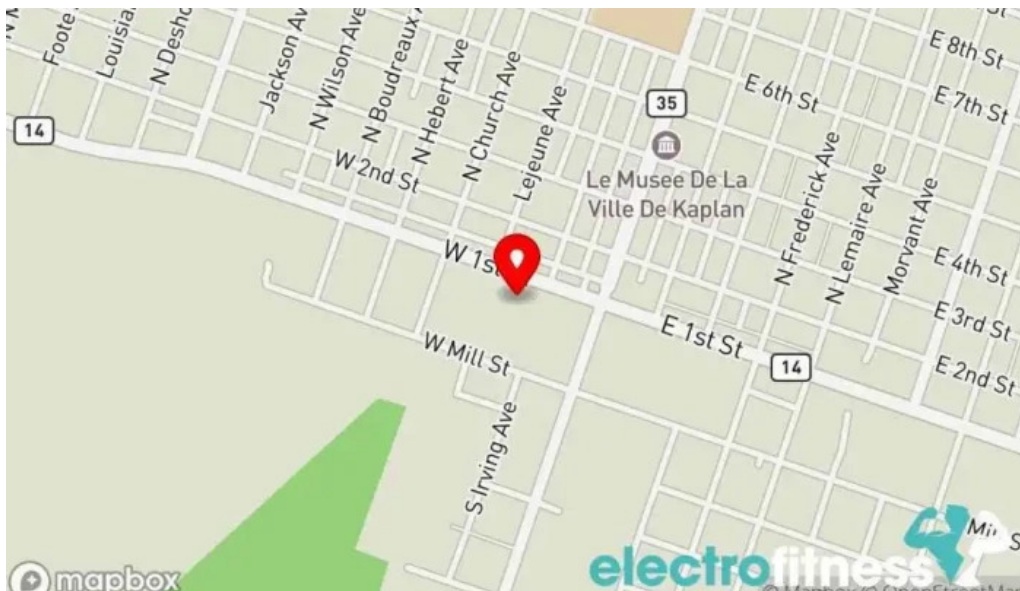
Anytime fitness map