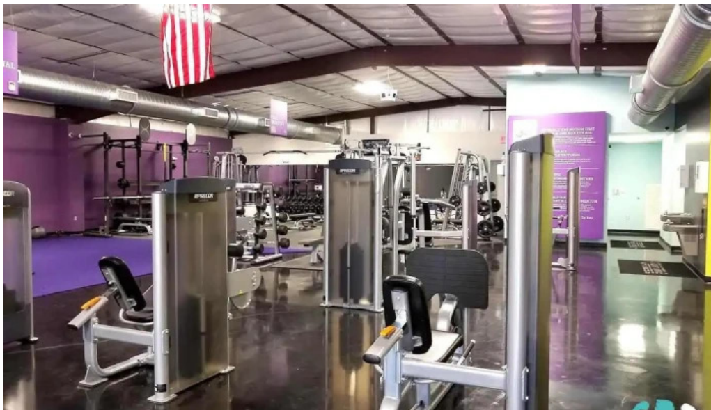
Anytime fitness kaplan