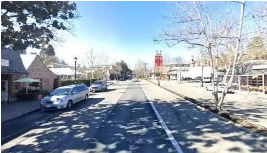
9round fitness street view 360deg