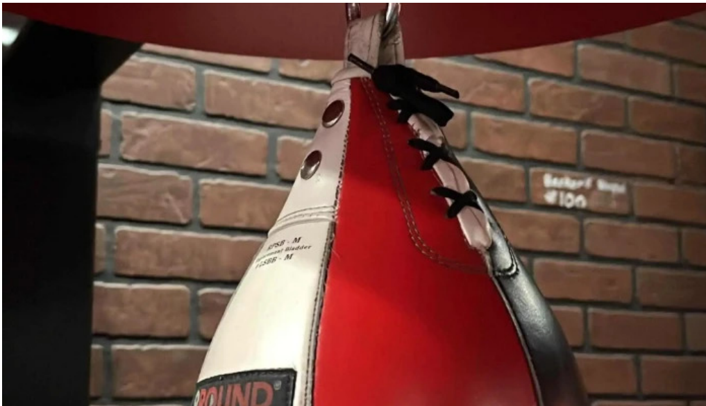
9round fitness gym