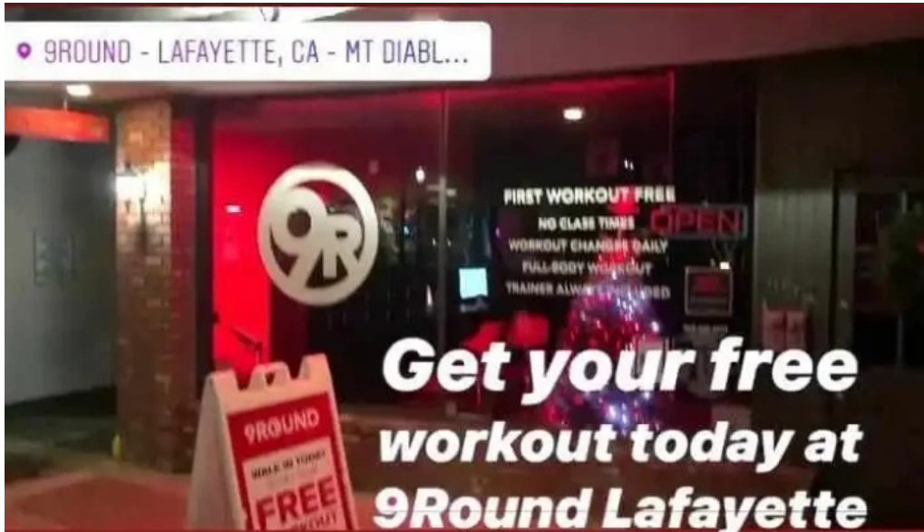
9round fitness videos