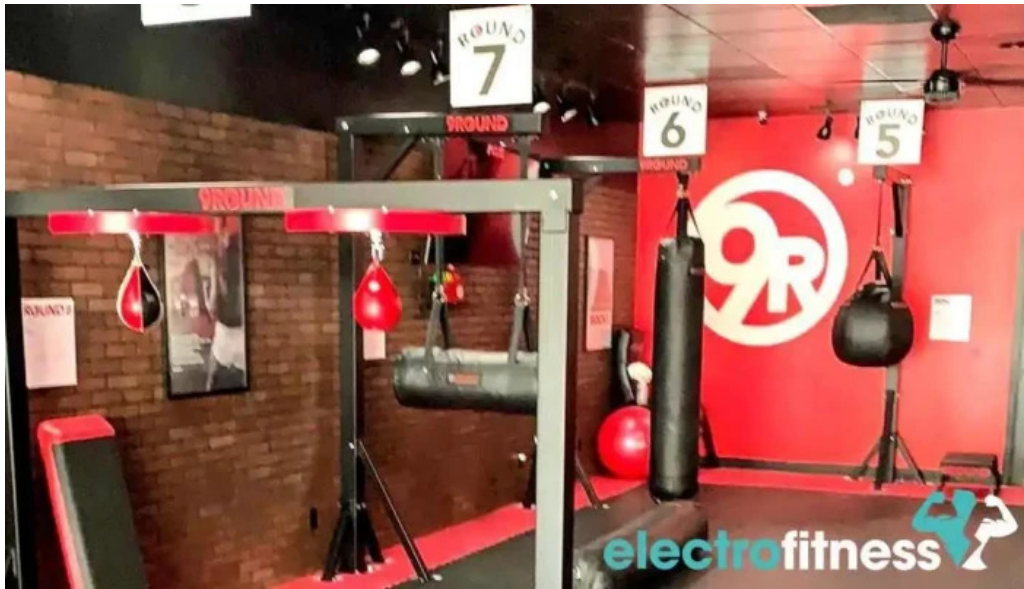
ground fitness lafayette