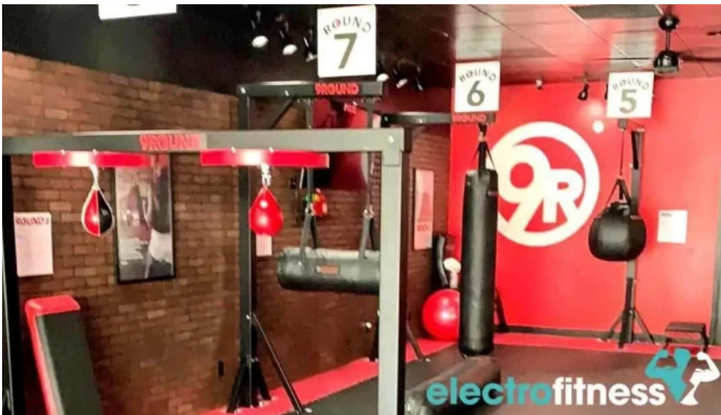
9round fitness all