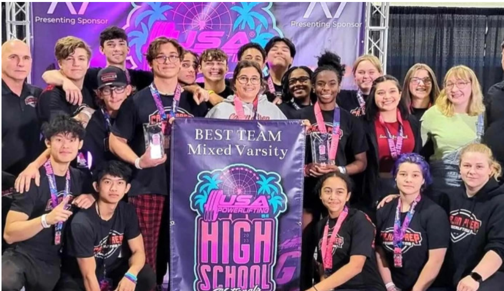
Cajun prep powerlifting gym