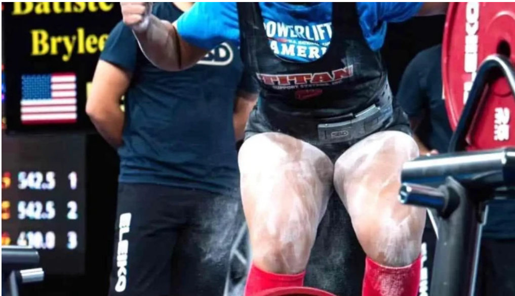
Cajun prep powerlifting all