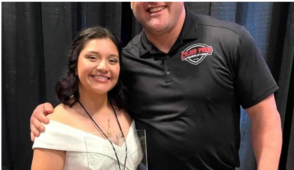
Cajun prep powerlifting lafayette