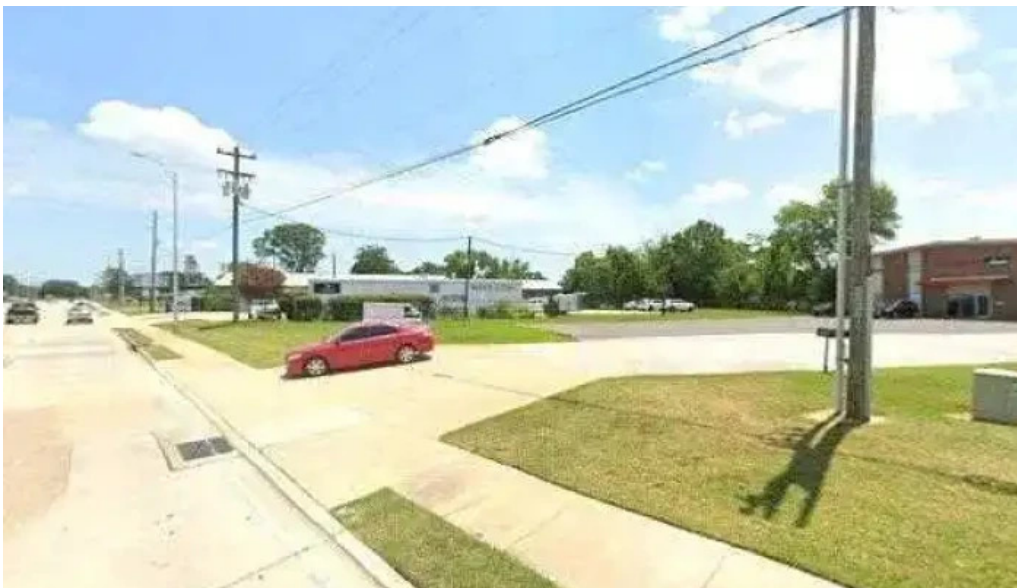
Cajun prep powerlifting street view 360deg