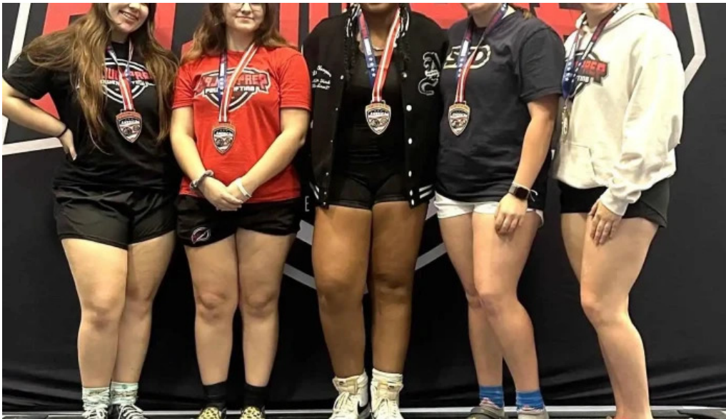
Cajun prep powerlifting by owner