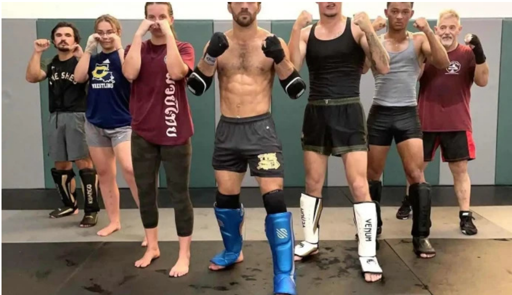
The shed all