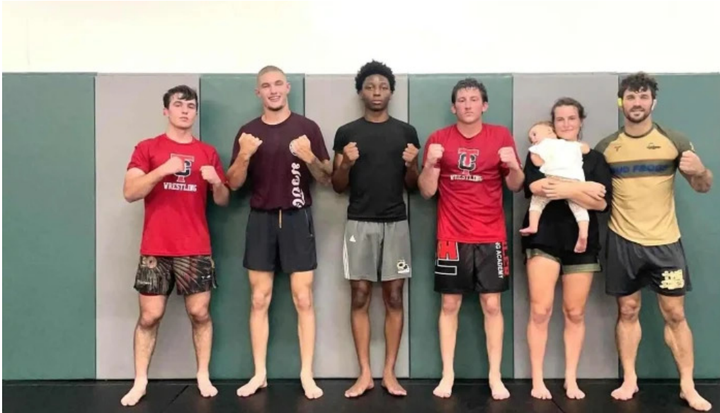
The shed by owner