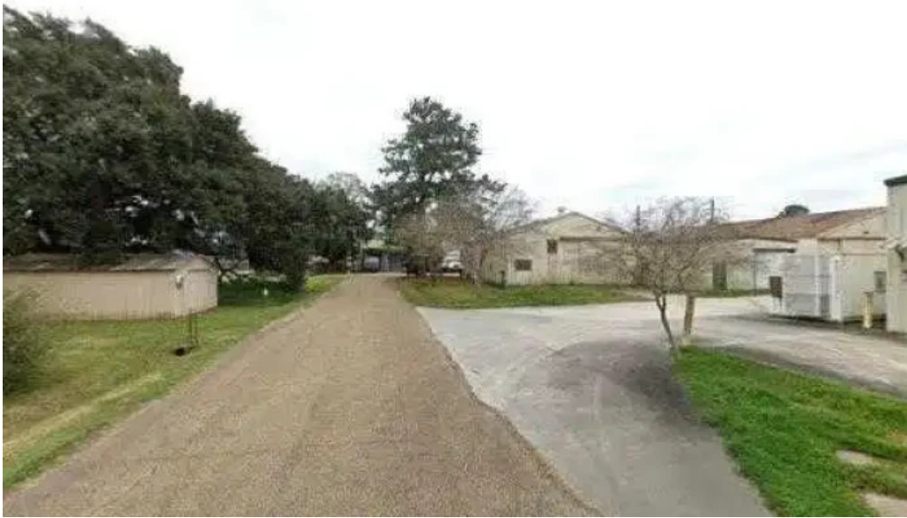
The shed street view 360deg