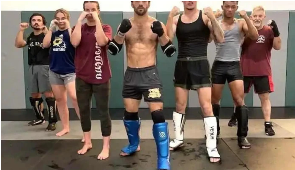
The shed lafayette