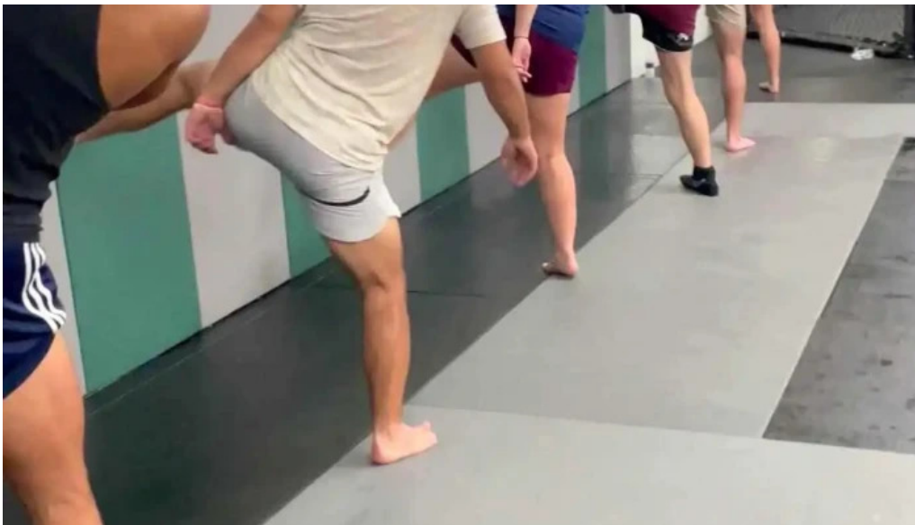
The shed videos