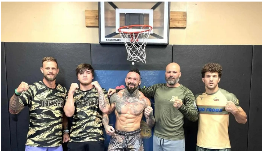
The shed gym