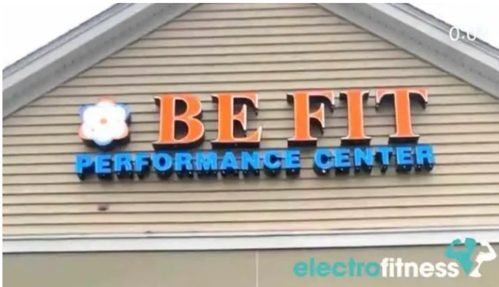
Be fit performance all