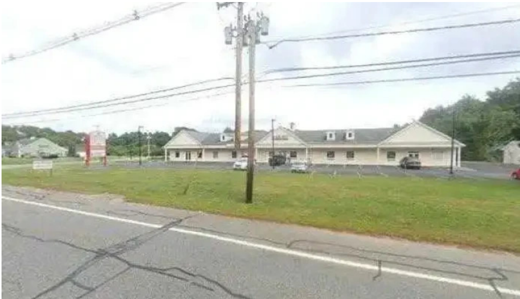
Be fit performance street view 360deg