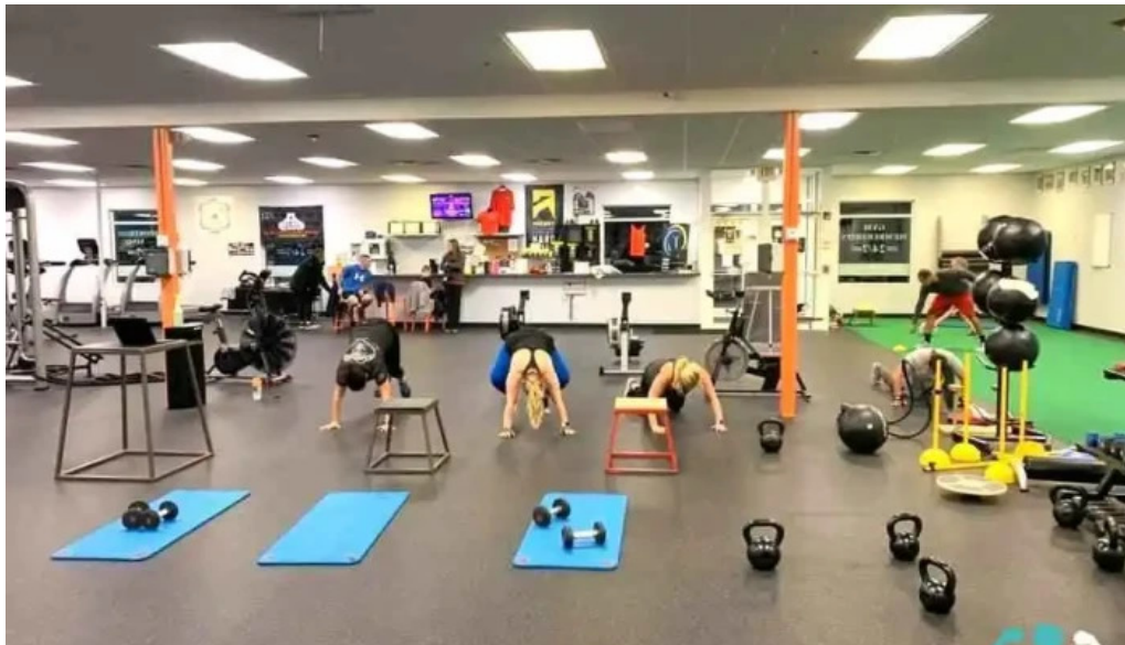
Be fit performance by owner