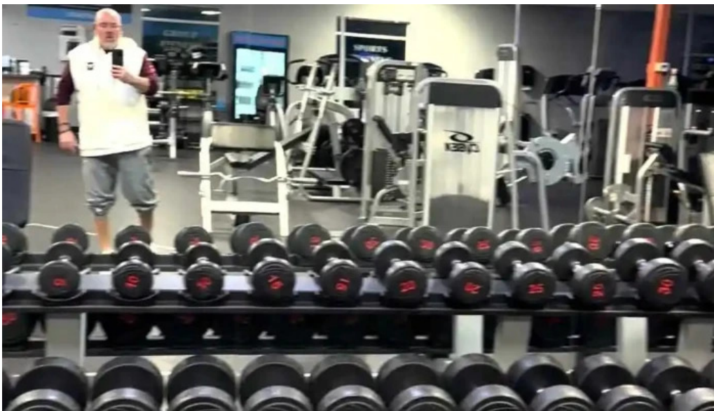
Be fit performance videos