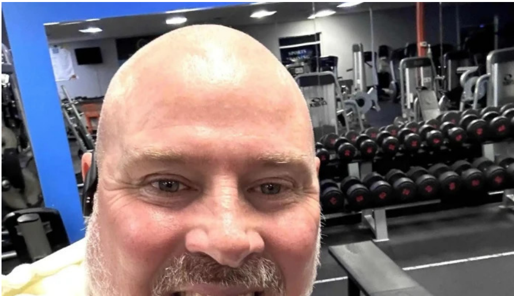
Be fit performance gym