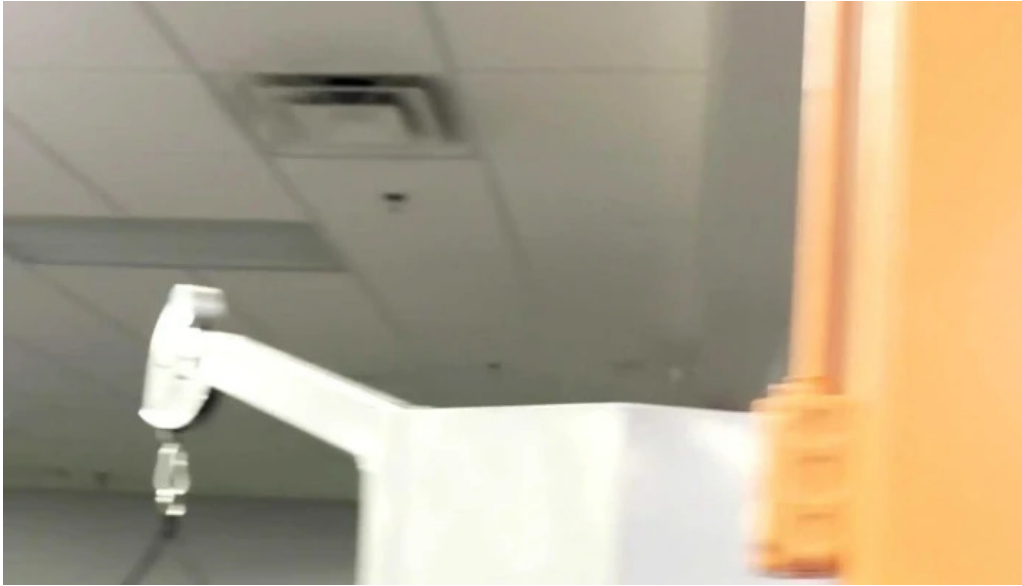
Be fit performance lakeville