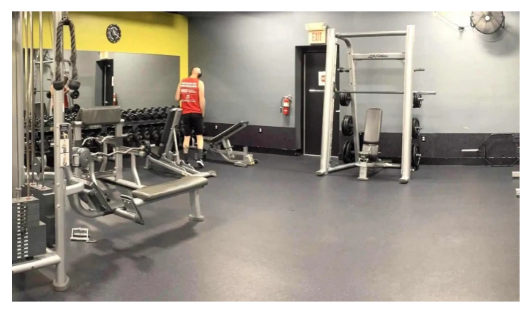
Anytime fitness number