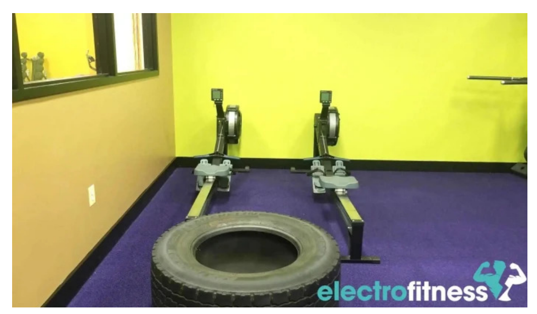
Anytime fitness exercise machine