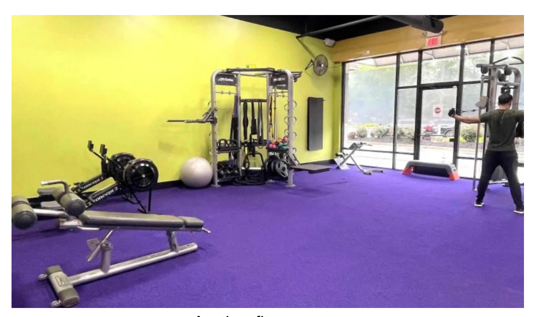
Anytime fitness near me