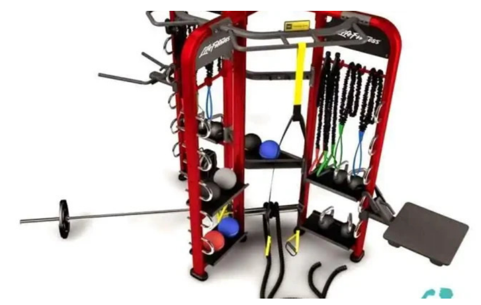
Anytime fitness by owner