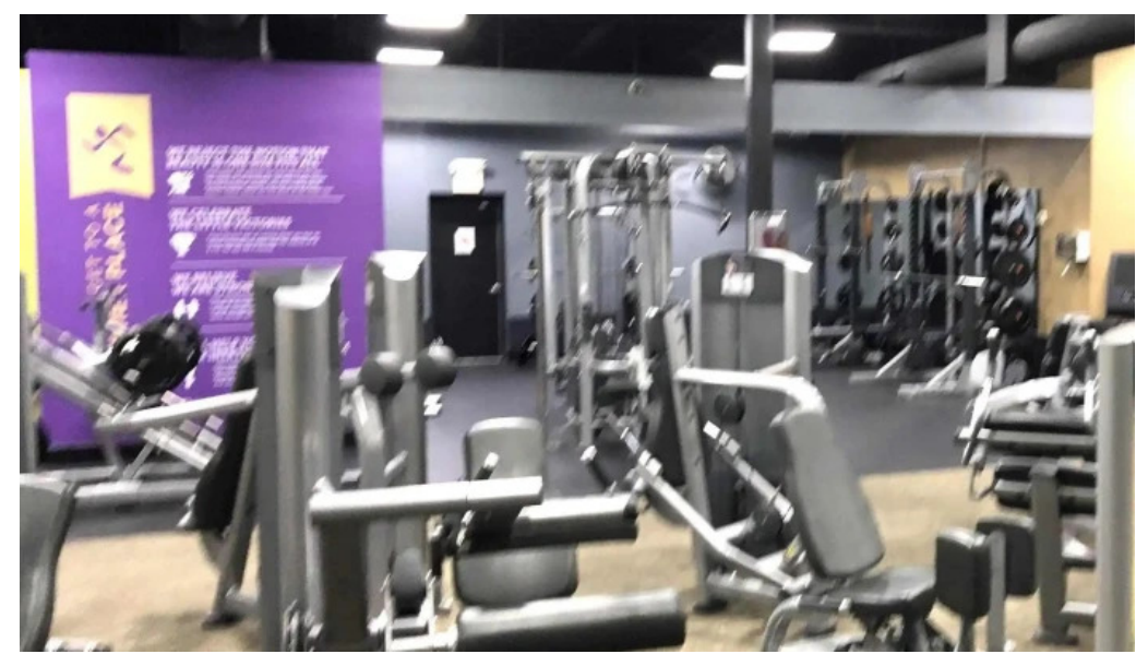
Anytime fitness linthicum heights