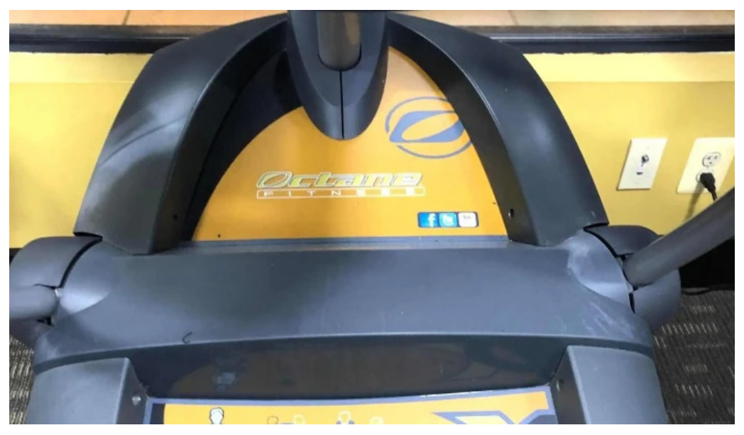
Anytime fitness address