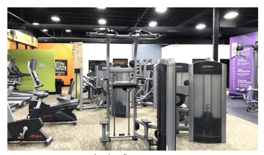
Anytime fitness comments