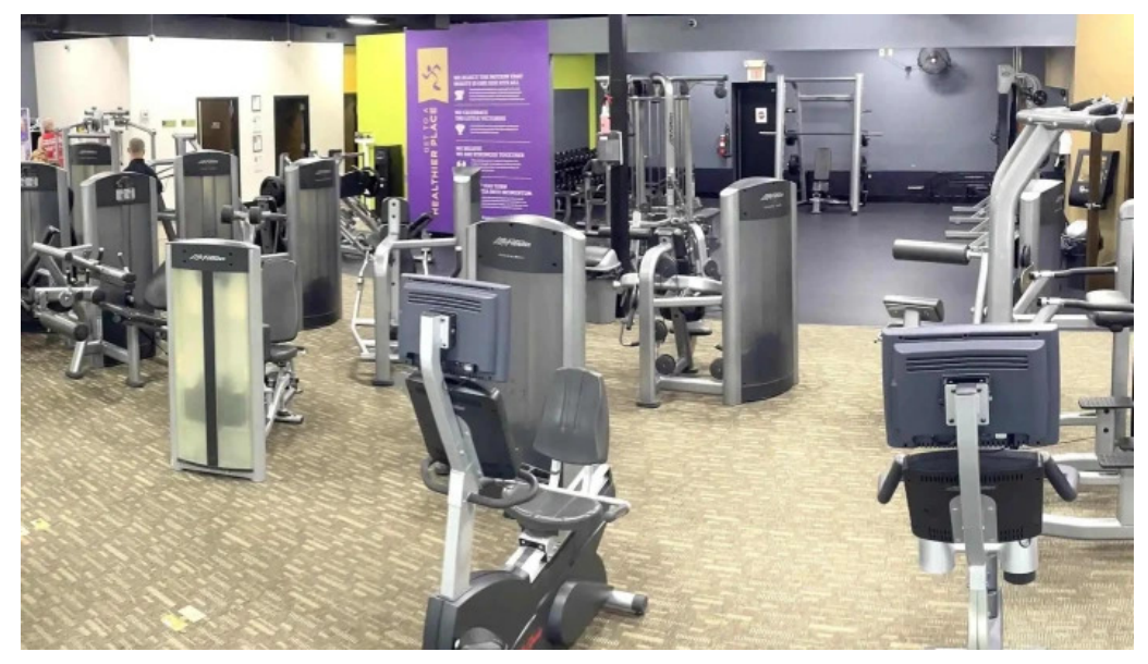
Anytime fitness videos