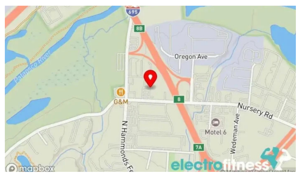
Anytime fitness map

1. What is another word for increase in muscle size? 2. What type of exercise boosts metabolism 24 hours aday/7 days a week? 3. What does HIIT stand for? 4. What is the strangest muscle in the body?